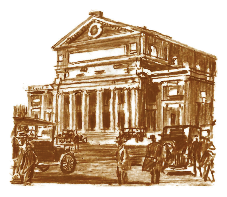
Boston Symphony Hall was a symbol of high-brow opposition to the spread of jazz music in the 1920s.