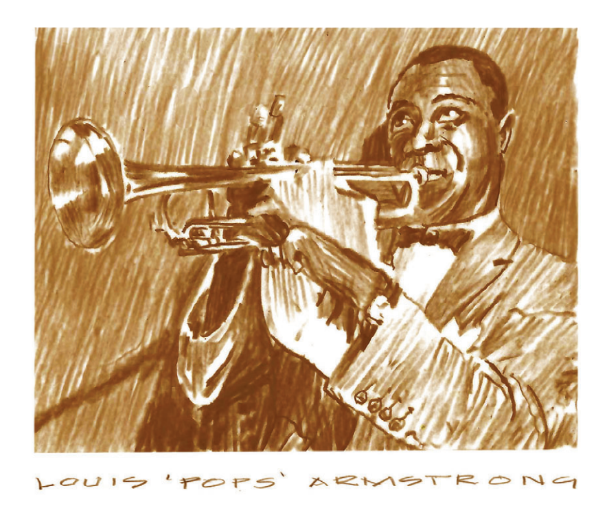
Louis Armstrong stayed in Frederick Douglass Square when visiting the city.