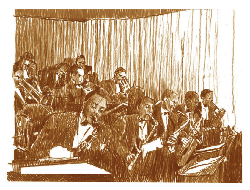
The Duke Ellington Orchestra wind and brass sections played like one man.

talent known as the "Boston-New York Pipeline." One advantage of the Harlem scene was the nondiscrimination policy of the New York chapter of the American Federation of Musicians. Unlike the Boston union, New York had accepted Black players as early as 1886 with the registration of violinist Walter Craig. Although the union cherry-picked Black musicians for theater and orchestra work, the city offered a larger market in the size of the Black community specifically and in the scope of work opportunities generally. Boston's Black community of 20,500—about two percent of the population—was outmatched by New York's Black population of 328,000 (about six percent).<sup>29</sup> Moreover, the New York scene was a wide-open jazz outlet compared to Boston under Prohibition. By comparison, the New York clubs served alcohol from 8 a.m. to 4 a.m. daily except Sunday, when service began at noon. In contrast, Boston prohibited the sale of liquor after 11 p.m., and none at all in the dance halls. Such constraints led the Boston Herald jazz col-