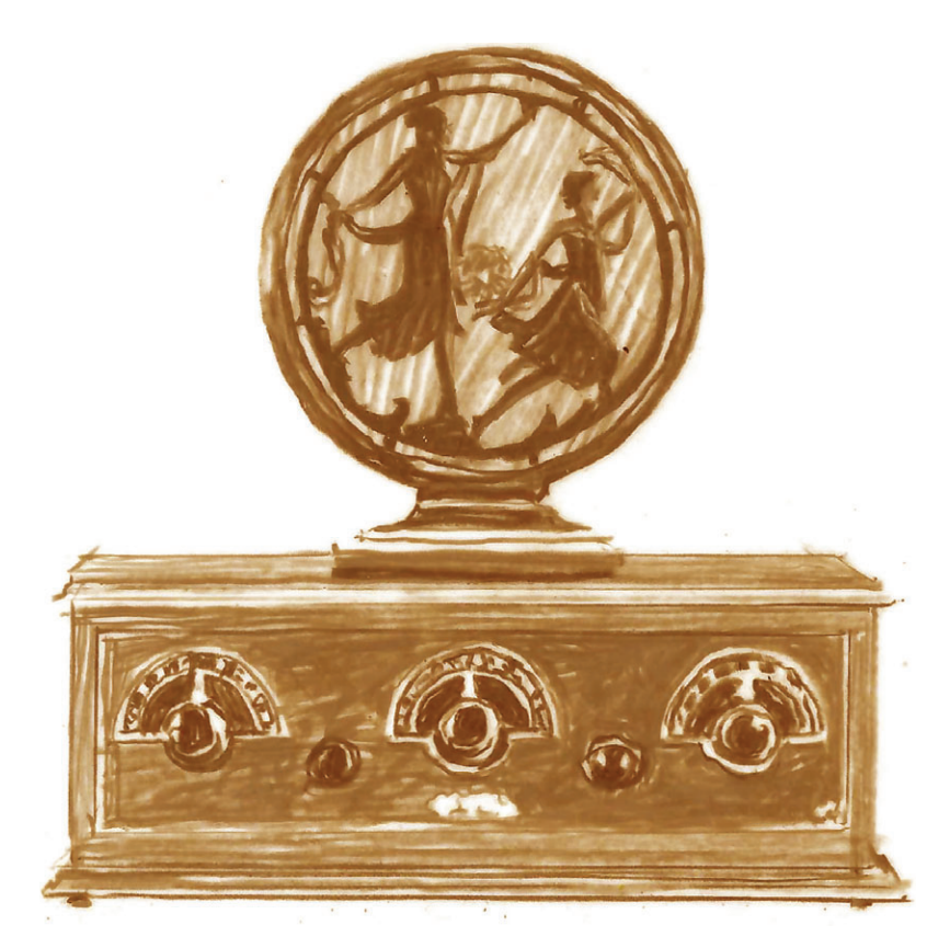
Art Deco radio and speaker decorated with the figurines of two dancers. The stylish radio set provided listeners with a variety of music and sound quality.