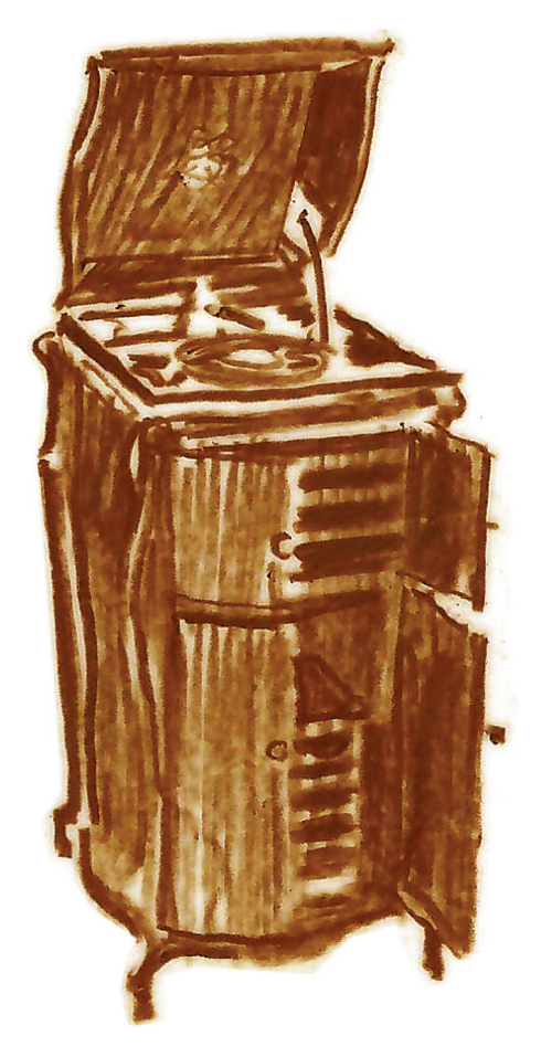
The "Victrola" was a large floor-standing record player used as a stylish furniture piece and source of music entertainment in the 1920s.

in economic determination promoted by prominent leaders such as the educator Booker T. Washington and the nationalist Marcus Garvey.