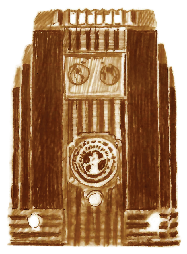
Tabletop radio with a step pyramid design provided an elegant source of music and entertainment for South End listeners.