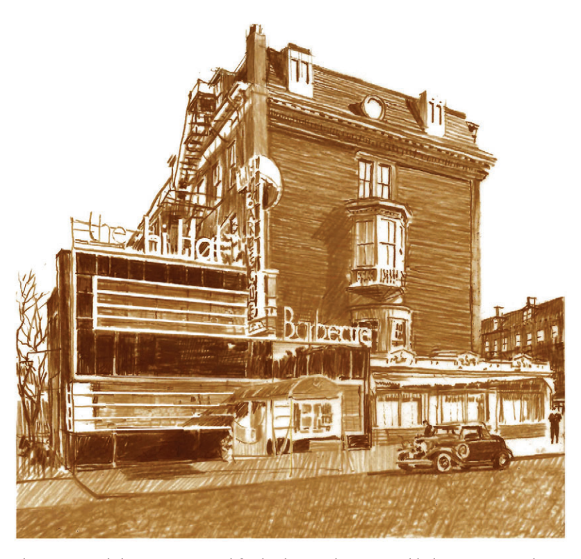
The Hi Hat Club was renowned for barbeque dinners and bebop music in the post-war South End.