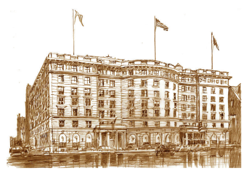
The Copley Plaza Hotel featured jazz orchestras for the exclusive ballroom dances of the interwar years.