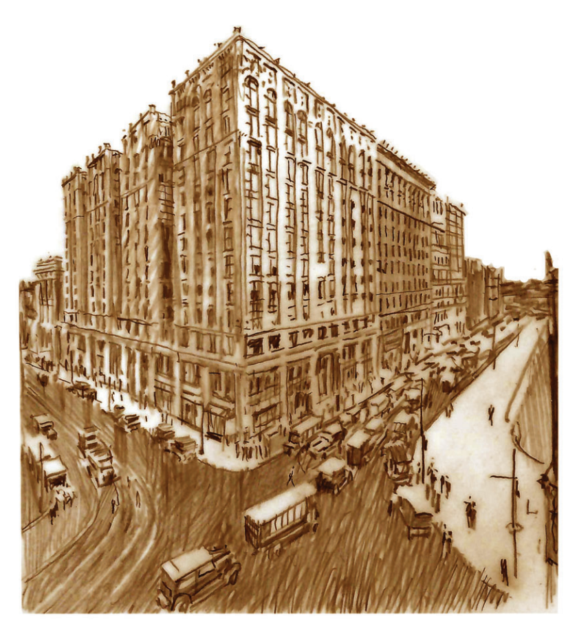
The Little Building, at the intersection of Boylston and Tremont Streets, leased the office of the Charles and Simeon Shribman booking agency.