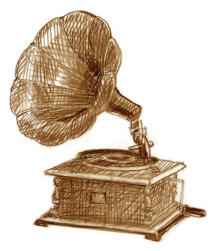
The Graphophone was a tabletop phonograph used to play 78 rpm records. The inexpensive machines were popular with South End record buyers in 1919 and afterwards.