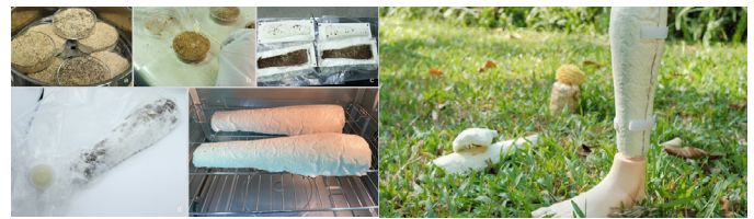
Figure 2. Left: Mycelium protective cover cultivation process: (a) substrate disinfecting; (b) inoculation; (c) adding material into the mold; (d) mycelium grows naturally; (e) drying material ; right: mycelium prosthesis protection cover wearing effects.

A material testing machine was used to test the mechanical properties of the prosthetic material. The mechanical properties of the complete mycelium prosthetic cover were tested. The test was divided into a vertical cross-section and a transverse cross-section of the protective cover, test process, and results (Figures 3). A series of material performance tests proved that the performance of mycelium material is between that of rigid polymer foam and polyethylene, and the prosthetic protective cover made of mycelium material can