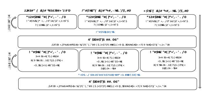
Figure 1. Evaluation Approach

expert evaluation technique is typically conducted by professionals who have a high level of expertise in a particular field or subject matter (Ghaoui, 2005), in the case of this project Human-Computer Interaction and Design specialists. Experts used their knowledge and skills to assess the usability of the system and user learning experience. Whereas end-user evaluation technique involves collecting feedback from actual users of a product or service (Ghaoui, 2005). This approach allowed for a more practical and realistic assessment of WVH system, as it is based on the experiences and needs of the users (i.e., students, lecturers, and clinicians).