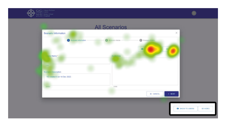
Figure 3. A heat-map of scenario information page

Users began by setting up their scenario content by inputting basic information and uploading media. Following typing a title and description, many users were hesitant regarding two buttons, "Show to Users" and "3D Video", before progressing. This can be seen in the eye tracking data in Figure 3, where they fixated on these elements overall. It was not clear to us-