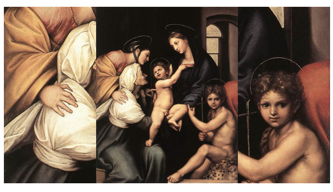
Figure 3. Madonna dell'Impannata, Raphael, 1513