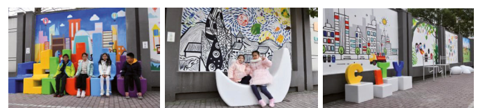
Figure 8, 9 and 10. The second phase of the exhibition of 100 chairs - creative seat community rafting.