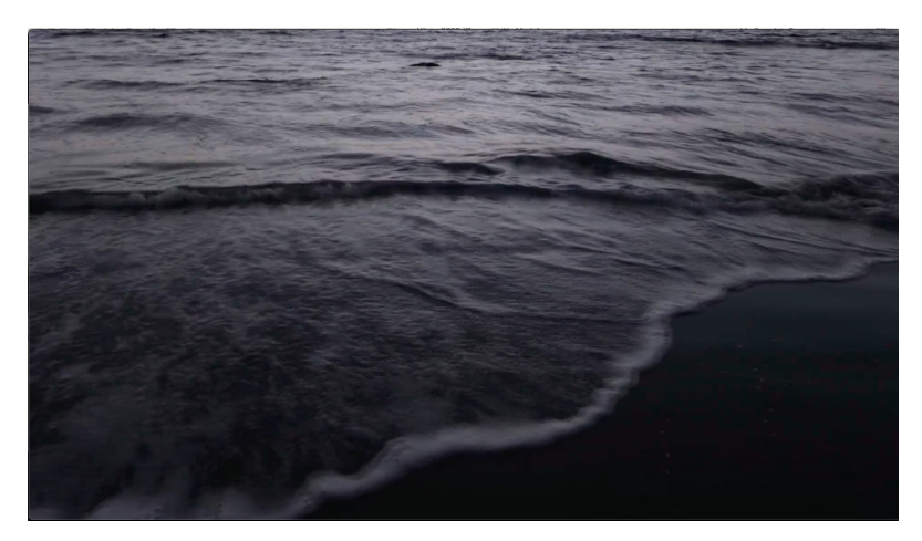
Figure 10. Nelly-Eve Rajotte. 2017. Blanc [Film still]. HD film, 9:30 minutes, sound.