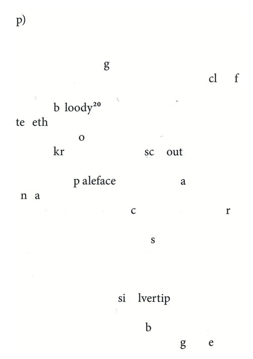
Figure 2. visualization of the poem of Abel (Abel, 2016, p. 18).

The structure that Abel creates in his sequence is, too, the most evident in the forms and shapes of the poems, ranging from compact and conventional stanzas to letters dispersed all over a page, when the text itself falls apart. The sequence opens with several poems made of five neat couplets each, often employing parallel structures and rather regular rhythm (e.g. the poem f) discussed earlier), and focusing on the nameless 'he.' It is only with the poem g) that Abel starts playing with format by indenting some lines and introducing spaces within them, or later adding more lines to stanzas; with the poem m), some words start breaking up into arbitrary clusters of letters – not syllables, – and with n), the poems turn into concrete poetry, with words broken apart into clusters of or mere letters, which are dispersed on pages, as for instance in the poem p) (see Figure 2).