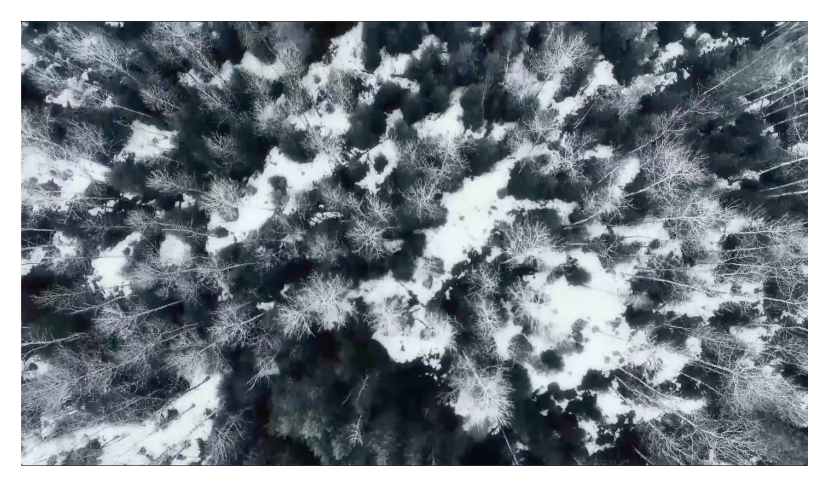
Figure 3. Nelly-Eve Rajotte. 2017. Blanc [Film still]. HD film, 9:30 minutes, sound.