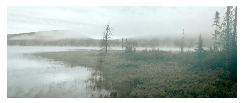
Figure 6. Nelly-Eve Rajotte. 2020. Stem [Film still]. HD film, 12 minutes, sound. Hydro-Quebec collection.

shore, which forms a peninsula where a tree stands apart from the rest of the forest, with the camera closing in on that shore alternately from two sides. The UAV stays at relatively the same height over the water, at a distance that prevents any kind of human embodiment, but at one point its camera pivots as the UAV keeps relatively still, reminding the viewer about the apparatus.