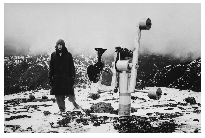
Figure 9. La Région Centrale [Production still], 1971. 16mm film, 190 minutes, colour, sound. Photograph by Joyce Wieland. Courtesy of Michael Snow.