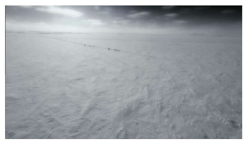
Figure 4. Nelly-Eve Rajotte.2017. Blanc [Film still]. HD film, 9:30 minutes, sound.

Stem is a one channel 12:00 minute-long video with sound produced in 2020 and intended as an architectural projection, presented for the first time during the summer of 2020 at the Rencontres internationales de la photographie en Gaspésie. It only shows travelling shots of a northern forest and lake, at the Manicouagan reservoir, whose dam is visible for a short moment during the opening credits. The piece focuses mainly on one lake