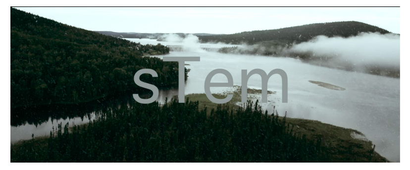
Figure 5. Nelly-Eve Rajotte. 2020. Stem [Film still]. HD film, 12 minutes, sound. Hydro-Quebec collection.