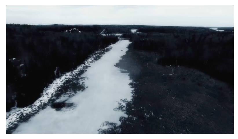
Figure 2. Nelly-Eve Rajotte. 2017. Blanc [Film still]. HD film, 9:30 minutes, sound.