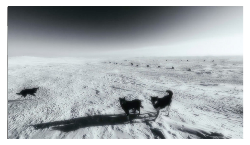
Figure 12. Nelly-Eve Rajotte. 2017. Blanc [Film still]. HD film, 9:30 minutes, sound.

Stem presents a subtler returning of the gaze by playing with the Romantic tableau of a single tree standing apart from the forest on a lake shore. Singled out, the tree becomes an individual that also insists, because of its disposition, on the presence of the other trees, in a known composition effect. It is tempting to consider, as is the case in Tom Thomson's The Jack Pine (1916-17), an influential painting for the Group of Seven and the Canadian landscape movement, that the 'solitary tree is a stand-in for the specular witness' (Bordo, 2002, p. 299). For Bordo, witnessing is determinant in modern picturing, as indicated by the constitutive framing operation of picturing, and is connected with the notion of wilderness in colonial art. In paintings such as The Jack Pine, the single tree figures the witness of wilderness, before European human presence in North America; this figure obliterates history by positing testimony as the rupturing event that inaugurates human presence in the land. Where in modernity 'the subject as a witness comes to organize the space, frame, and contents of visual arts' (Bordo, 2002, p. 299), the postmodern posthumanist eye of the drone shifts the witness figure of the single tree to a singular being with its dose of uncertainty. The tree is no longer a static stand-in witness that attracts, thanks to the painting's composition, the spectators' gaze and in which the spectators