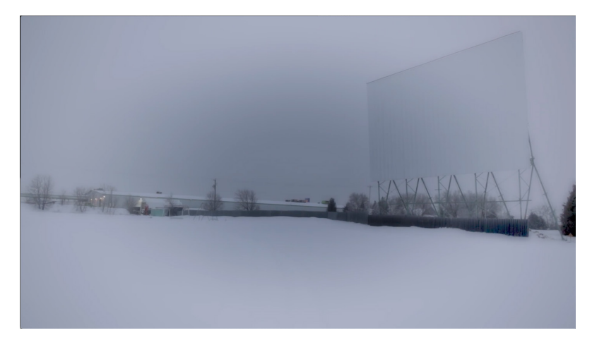
Figure 1. Nelly-Eve Rajotte. 2017. Blanc [Film still]. HD film, 9:30 minutes, sound.<sup>3</sup>