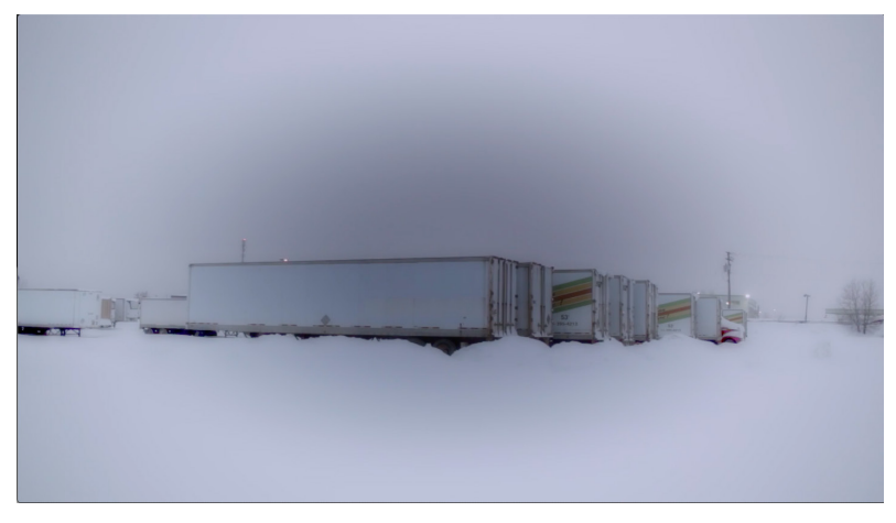
Figure 11. Nelly-Eve Rajotte. 2017. Blanc [Film still]. HD film, 9:30 minutes, sound.