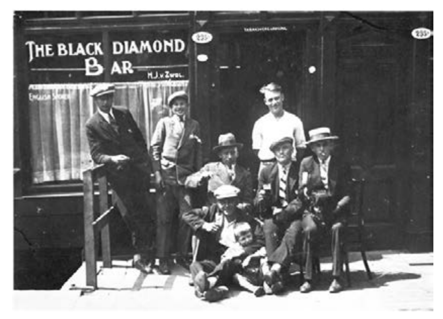
Figure 5.3 Photograph of The Black Diamond Bar on the Schiedamsedijk, presumably during the 1930s (exact date and creator unknown).

discerned on bars' front windows in some pictures, indicating that certain languages other than Dutch were default inside establishments. Commentators at the time linked the global street signs to a genuine amalgamation of international visitors on the Schiedamsedijk.<sup>50</sup> Cosmopolitanism appears as another intrinsic character trait of sailor districts, but similar to hedonism, it can be problematised and regarded from different perspectives that potentially subvert the romantic and safe nature often attached to it.<sup>51</sup> Foreign language inscriptions on bar windows may have functioned as welcoming invitations, but just as well as explicit markers of segregation and underlying ethnic conflicts that bring additional concerns with it for local security forces.