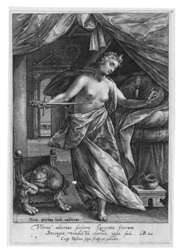
Figure 10.6 Crispijn van de Passe I, Lucretia , 1589/1611, engraving, 23.3 × 16.2 cm, Amsterdam, Rijksmuseum, Inv. Nr. RP-P-1986-284 (Public Domain).

The precarious situation painted by De Hooch recalls the ancient story of Lucretia, which had become very popular in the European Renaissance and the subject of many images. As told by Titus Livy, Ovid and other authors of classical antiquity and afterwards, Lucretia, a very beautiful and virtuous Roman woman, was raped by a relative in her own house. In consequence of this loss of honour, she took her own life with a dagger, and the events triggered an uprising of the people against the monarchy. An engraving by