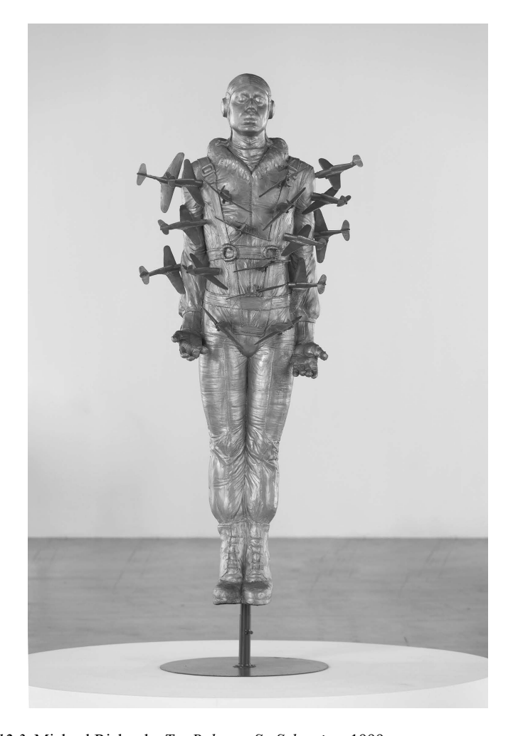
Figure 12.3 Michael Richards, Tar Baby vs. St. Sebastian, 1999.