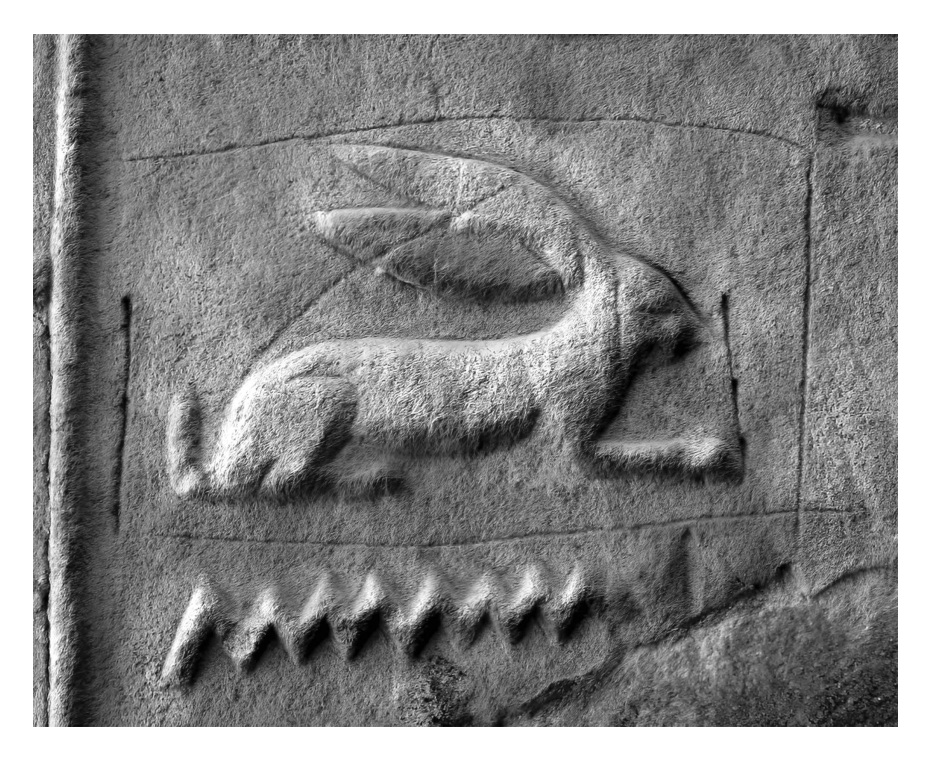
Figure 4.1 A hieroglyph showing a long-eared desert hare, used to represent the verb "to be".

initiate the creation of the world (Obenga, 2004, 33–42). The Book of the Dead was a book of intellectual engagement with metaphysical realities, teaching the philosopher how to pass through the trials of initiation (Scott, 2016).