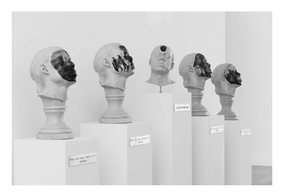
Figure 12.1 Michael Richards, A Loss of Faith Brings Vertigo, 1994.

Four white busts rest on a pedestal with plaques that say, "When I was young I wanted to be a policeman". They look as though they are wearing black masks; up close, it's clear that the masks are really photographs of police