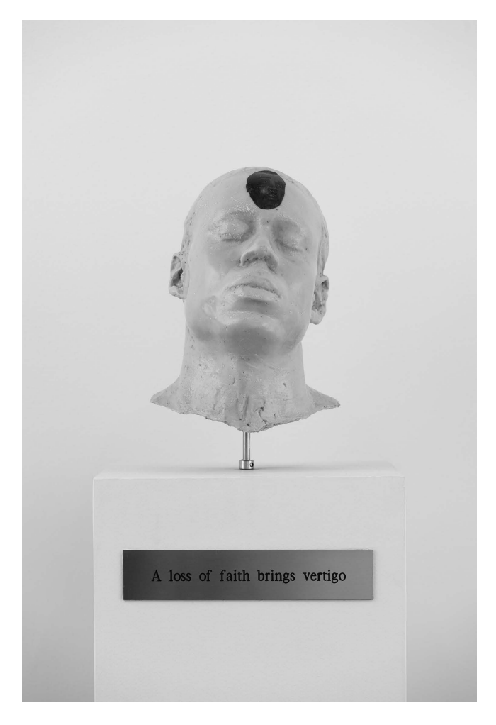
Figure 12.2 Michael Richards, A Loss of Faith Brings Vertigo (detail), 1994.