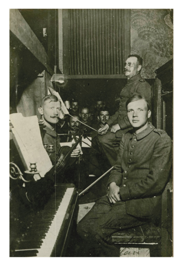
FIGURE 6 Field theatre in Berclau, 1916 (TWS KTH ID 40097)

The older ones generally had little interest in music. At no point did I hear conversations about music or musicians, and they performed their musical duties without enthusiasm. When they weren't playing cards – and in fact they did so all day long – they were usually reading in an attempt to prepare for their future careers as postal workers or tax officials.<sup>41</sup>