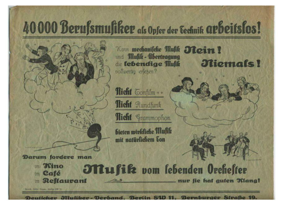
FIGURE 9 Pamphlet produced by the German Musicians' Union, undated (BArch RY 22/291)

For ordinary musicians, the new record market apparently offered hardly any additional sources of income during this period; at least, they did not perceive it as doing so. Instead, they exhibited a certain scepticism and, as practitioners, intuitively sensed what Walter Benjamin described in his famous essay on 'The Work of Art in the Age of Its Technological Reproducibility' as the atrophying of the musical 'aura'.<sup>113</sup> As an article in the Deutsche Musiker- Zeitung put it, 'gramophone music overwhelmingly leads ear, feeling and taste astray. The monochromaticity of gramophone acoustics erases completely the original sound of a song or instrumental performance'.<sup>114</sup> Like the other new media, however, the record was only identified as a real danger to the profession of musician towards the end of the decade, as a pamphlet published by the Musicians' Union illustrates (figure 9). After the stock market crash in October 1929, the hopes placed in film, radio and records flipped over into outright technophobia.