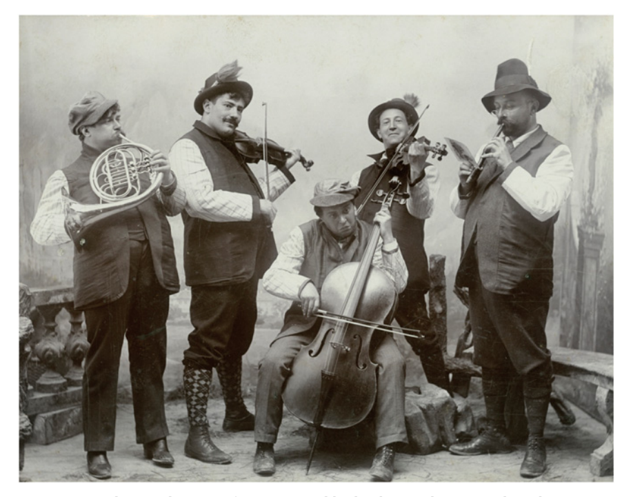
FIGURE 2 Schrammel Quintet, featuring Arnold Schönberg and Fritz Kreisler, July 1900

The ambivalent attitudes of famous musicians dedicated to so-called serious music towards popular music is a topic worthy of systematic study in its own right. The Schrammel Quintet (figure 2), which had a top-class line-up, with Fritz Kreisler on the violin and Arnold Schönberg on the cello, shows that the gap between the two, which educated middle-class music criticism and musicology never tired of measuring, was often less deep in practice.<sup>77</sup> In such cases, even (or especially) the avant-garde paid homage to genres quite different from those they generally extolled, although evidently only for the joy of making music.