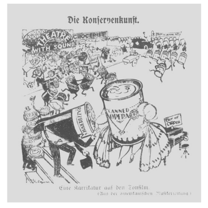
FIGURE 8 Caricature of the sound film, 1930 (adapted from Der Tonfilm , 5)

United States, for example, where radio was operated privately from the very beginning, broadcasting in Germany was placed in the hands of the government and financed through fees. By the end of the republic, a little more than four million devices had been registered, and probably more than ten million people were listening to the radio. Similar to cinema, radio was initially an urban phenomenon, because the range of the broadcasting stations was fairly limited and tube radios, which could receive broadcasts even over great distances, were complicated to use and quite expensive in the early years.<sup>94</sup>