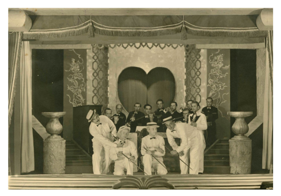
FIGURE 11 Revue Rampenfieber, POW Camp 72, Bedfordshire, October 1947 (TWS LTH ID 20213)

a lively cultural scene developed, and musicians were often granted privileges.<sup>61</sup> As is well known, for German prisoners this experience extended well beyond the end of the war. The photograph from Camp 72 in Bedfordshire, UK, illustrates the professionalism with which the inmates set about their work. The coordinated setting, featuring musicians in black tuxedos and singers in white ones, as well as the sophisticated set, provide no hint that the revue Rampenfieber was an instance of prisoner-of-war theatre (figure 11).