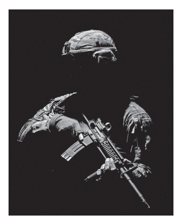
FIGURE 1.3 A 'human' warfighter.

2018. Compare: The Geneva Conventions of 1949 and Additional Protocols I and II of 1977; Henckaerts and Doswald-Beck 2005), vet in IHL targeting and the use of semi-autonomous weapon systems there must be a 'human in the loop'. Who, or what, is 'human' in the human warfighter-uniformneurostimulation-pharmaceutically enhanced-technological-media-mud-air body performing IHL targeting in contemporary technology-intensive warfare? Even with the best and sharpest of distinctions, doctrines and international legal arguments the question is not easy to answer. The suggestion from posthuman feminist jurisprudence is that the question is not the one that international law, scholarship and practice should be most concerned about. Instead, I and many other scholars with me have argued, the relevant question for international law is to how to curb lethal planetary destructive violence on all levels - regardless of it is 'artificial', 'human', 'natural', combined or otherwise (Arvidsson 2018, 2020, 2021, 2023b; Arvidsson and Sjöstedt 2023; Jones 2023; Parsley 2021).