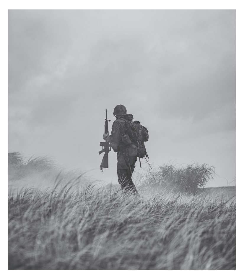
FIGURE 1.4 A human–nonhuman environment.

to order. In other words, international law seeks to describe that which it orders in ways that are convincing to those who are to recognize international law's normative power (Orford 2012). This means that international law's categorizations and distinctions are only relevant if, and to the degree that, they can convincingly describe that which it seeks it order. For this reason, international law is in a constant need of theoretical and methodological frameworks that can offer opportunities for the international legal scholar and practitioner to see, sense, cut and (re)describe the new - and old - in more relevant ways (Aristodemou 2014). As the world changes - through scientific findings and technological innovations, geopolitical disruptions or 'natural' and human-created disasters – international law adapts, it stretches and bends. It is the task of international lawyers – scholars and practitioners – to 'bend' creatively, critically and ethically.