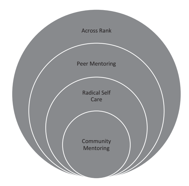
Figure 1.1 Black women networking of mentoring model (BWNM; Kelly & Fries-Britt, 2022)

marginalized identities and status in the academy; Kelly & Fries-Britt, 2022). Many of these components are well established in the literature. The unique aspect of our model is the centering of Black women and the power that comes from utilizing all aspects simultaneously and in support of each other's success. Unfortunately, the ability of Black women to find mentors and support in their graduate education remains an enduring challenge most especially at historically white institutions (HWIs).