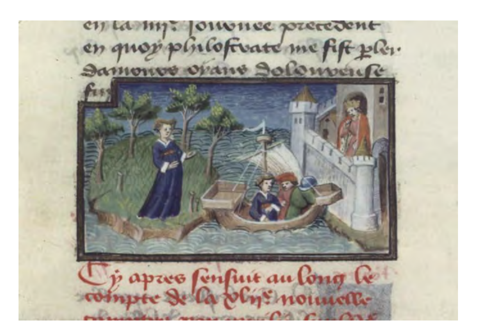
Fig. 13: The boat and crossings, in Decameron , trad. Laurent de Premierfait, ms. Fr. 239, fol. 145v, Century, France, 15th century, BnF, Paris.