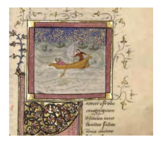
Fig. 2: Water or....the invention of navigation, in Barthélemy l'Anglais, De proprietatibus rerum (trad. Jean de Corbichon), ms. Fr. 22534, fol. 184, 1st quarter 15th Century, BnF, Paris.