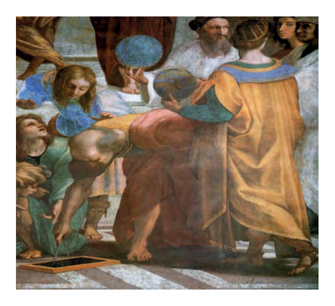
Fig. 8: Raffaello, Astronomers, Mathematicians and Geographers (NB Ptolomey with the globe), Scuola d'Atene , 1510, Stanza della Segnatura, Città del Vaticano.