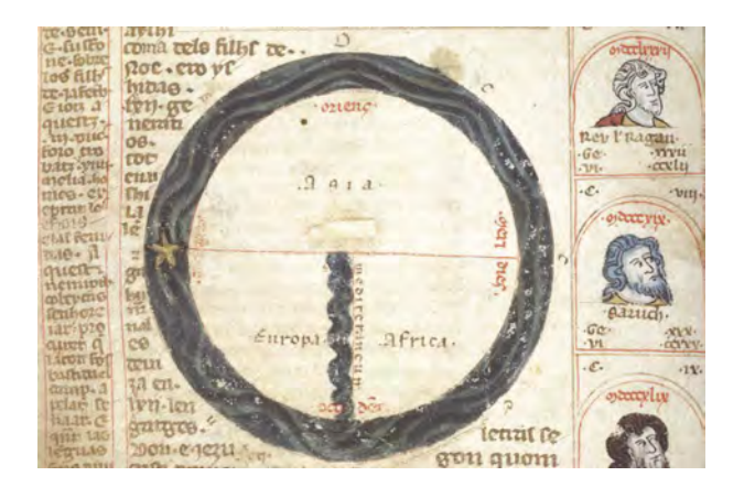
Fig. 3: T-O Map. In Abbreviamen de las Estorias or Chronologia magna , Paulino Veneto, ms. Eg.1500, fol. 3v, London, British Library.

https://creativecommons.org/licenses/by/4.0/" CC-BY Licence.