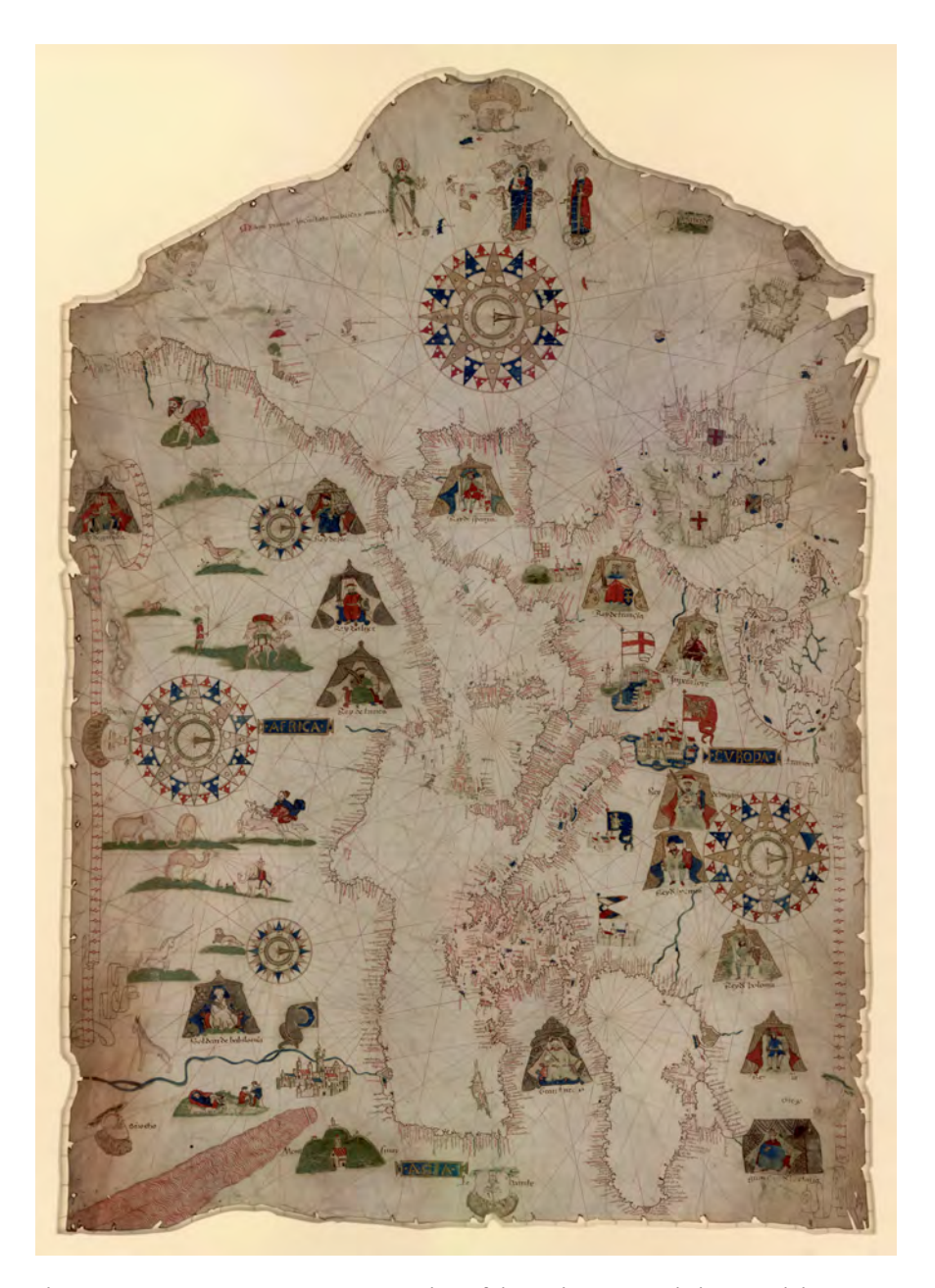
Figure 1: Prunes, Mateus, active 1553–1599 [Chart of the Mediterranean, Black Sea, and the coasts of western Europe and northwest Africa], In civitate Majorica: Mateus Prunes, anno 1559.