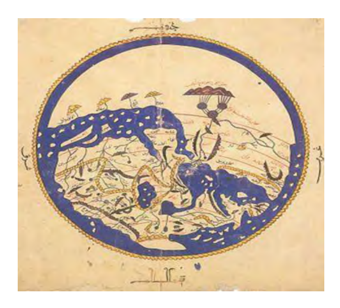
Fig. 7: The Mediterranean at the center. Map of the World by Al-Idrisi (repr. 1456).