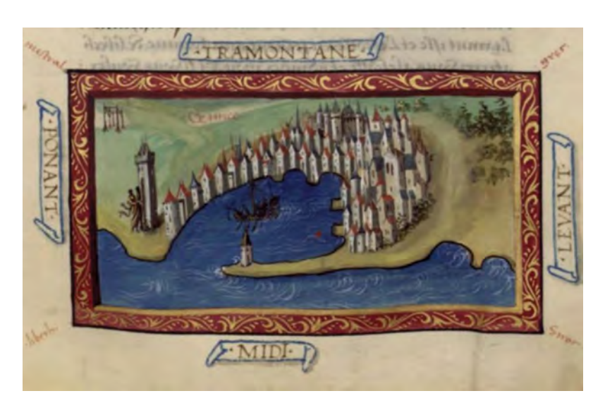
Fig. 11: Genova , in Description des iles et des côtes de la Méditerranée , ms. Fr. 2794, fol. 11, 16th, Century, France, BnF, Paris.