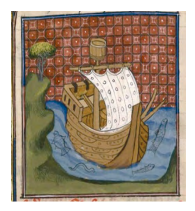
Fig. 1: "Cy commence le XIIIe livre <u>de l'eaue</u> et de ses differances et de son <u>ournament</u>": Water and the Sea, in Barthélemy l'Anglais, De proprietatibus rerum, (trad. Jean de Corbichon), ms. Fr. 22534, fol. 167v, 1st quarter 15th Century, BnF, Paris.