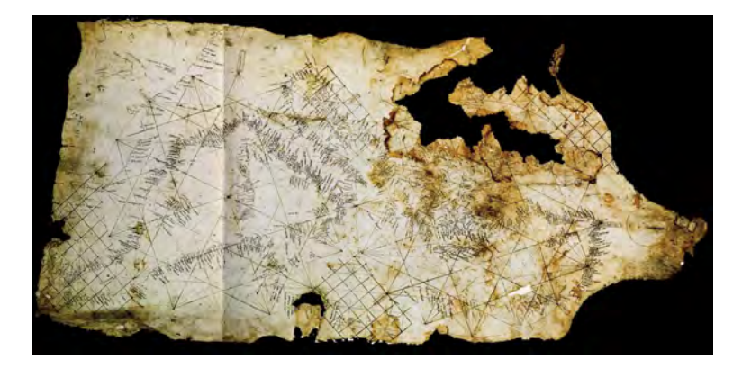
Fig. 5: Carta pisana (nautical chart, end of 13th Century ca.) BAF, Paris.