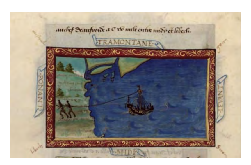
Fig. 12: A coast of France: Men weighing anchor, in Description des iles et des côtes de la Méditerranée, ms. Fr. 2794, fol. 7v, 16th, Century, France, BnF, Paris.