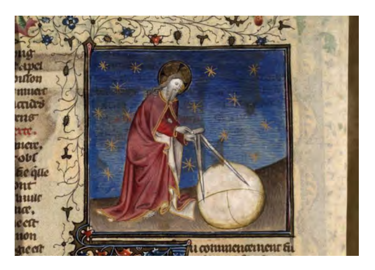
Fig. 9: God the Geometer , in Guyart des Moulins, Bible Historiale , ms. Fr. 3, fol. 3v, BnF, Paris. 14th Century.