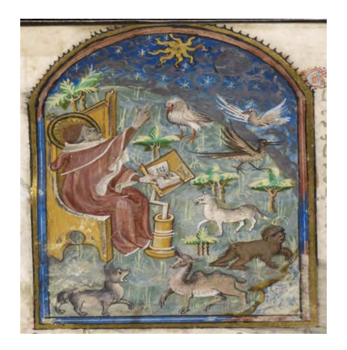
Fig. 10: God the Poet writes the Book of the Universe , in Image du Monde attributed to Gautier de Metz, ms. Harley 334, fol. 1, II quarter of 15th Century, British Library, London. https://creativecommons.org/licenses/by/4.0/" CC-BY Licence.