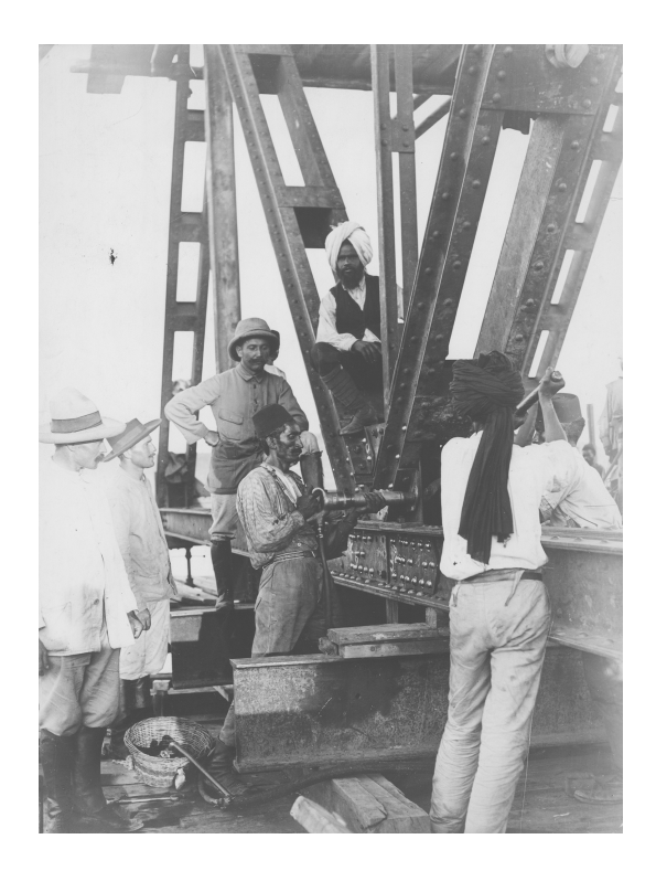
Figure 2: Indian craftsmen riveting bridge parts using modern machinery at the Malagarassi-Bridge 1912–13.