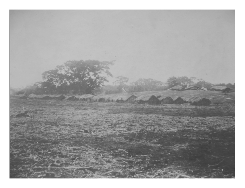
Figure 7: First workers' camp in Kilossa.