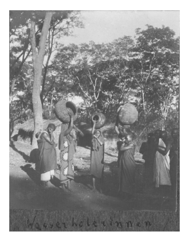
Figure 9: Female water carriers.

coast for shipment to Europe. What regulated the labour of these men most was nature: For any working task, the most intense activity took place in the dry season, whereas activity regressed to a minimum in the rainy season. During masika , only the most important tasks like conservation and general surveillance of the area under excavation were carried out. This seasonal fluctuation was also reflected in the number of male workers employed at the Tendaguru Expedition in the year 1909: "Sixty local men had been engaged by April 23. [. . .] This grew to 70 and 80 in the [following] two months. [. . .] At the height of the season [in July], the Expedition employed 420 men. The number fell to 230 in November, to 200 at