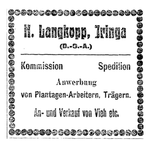
Figure 1: English: "H. Langkopp, Iringa G(erman) E(ast) A(frica). On-sale-return. Forwarding agent. Recruitment of plantation workers, porters. Purchase and sale of cattle, etc".