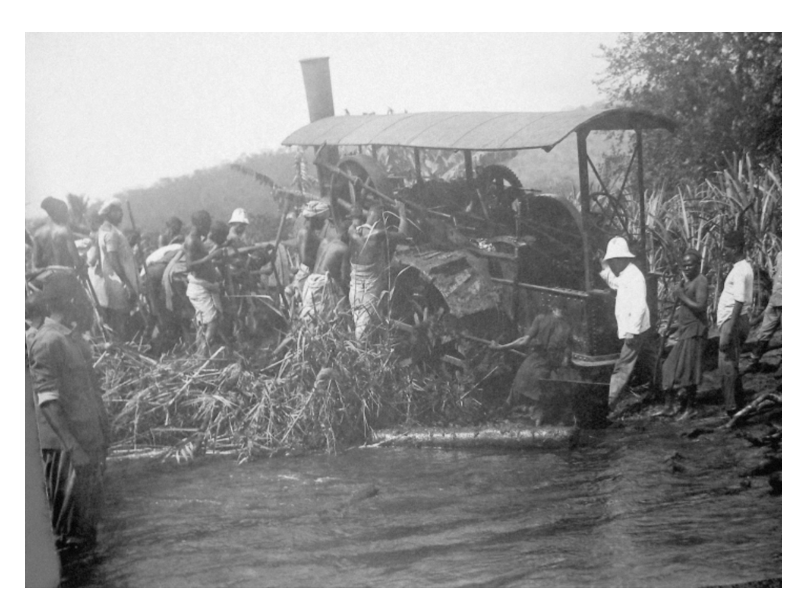
Figure 5: Steam Plough Sunk in Mukondoa River.

is said that Heinrich Otto even attempted to sell both steam ploughs to other planters because they were of no use to his plantation in German East Africa at all. ^{103}