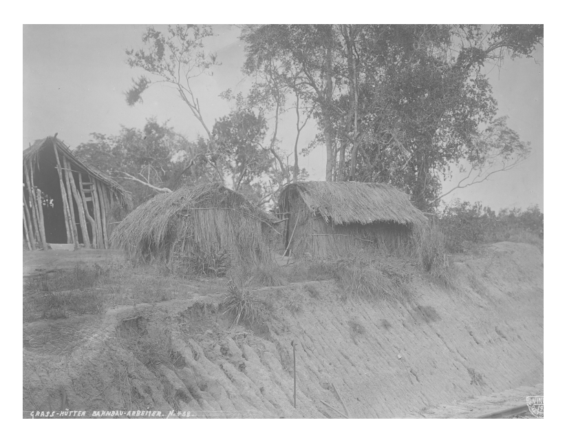
Figure 4: English: "Grass huts of railway workers, no. 458".

Gillman's dwelling and went southwards to "the hut of [the] foreman", an Italian, who appears to have had a colleague from Montenegro living nearby. <sup>285</sup> This is where the sphere for Europeans-only ended, and another began.