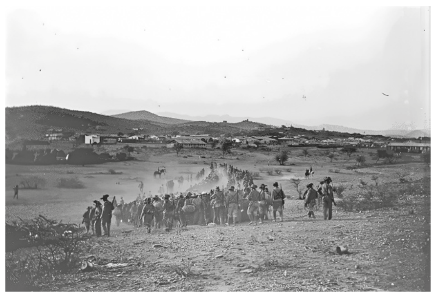
Alexander von Hirschfeld, Photograph, Namibia; date unknown (approximately 1905 to 1907) source: from the collection of photographs of the museum am rothenbaum. Kunst und Kulturen der Welt Hamburg (MARKK), INV. NO. 2018.1, 85