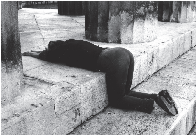
Figure 2.5. Valie Export, Theseustempel (Stufen) , 1982. Copyright Valie Export, Bildrecht Wien, 2018. Courtesy Valie Export.