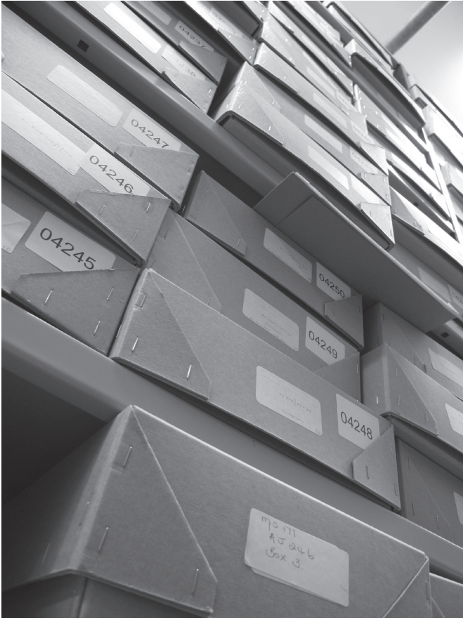
[Figure 1.2.] Image from the Archive Space exhibition, curated by Jane Birkin.

place, but in the context of design, art practices, and contemporary culture. Furthermore, this essay is accompanied by a series of images that, on one level, refer to the artistic and curatorial projects that are part of the dialogue and, on another level, narrate the argument in their own right. They mark the spot of remains as