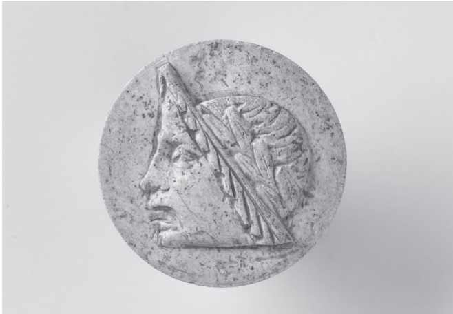
[Figure 2.1]. Roman Gaming Piece , first century to second century CE.

the face of the mask on the face of an actor on the face of a bit of bone looks toward a space off, gesturing toward another scene. Look!