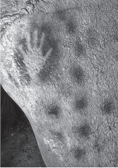
[Figure 2.11.] Pech Merle Hand, Paleolithic, Lot, France.

That is, even if the cave hand wasn't "originally" a hail, does it become one—even illegitimately—by virtue of response? Or does it become, backward, a response by virtue of a hail? If I fundamentally engage the Paleolithic hand because I also have one, and respond to the gesture of the upheld palm because I also make one or might make one, does liveness, as a matter of exchange, exist only as intervallic reiteration (which is neither sameness nor difference but both)? 21 Is there then a time limit on the interval? Or on liveness?