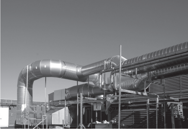
[Figure 1.7.] Image from the Archive Space exhibition, curated by Dr. Jane Birkin.

ends: to discuss possible toxic legacies of technological culture and to investigate possibilities of reuse of materials, for example, copper that remains of the wired city. What an archaeological discovery of a past media culture! Björn Wallsten explains this aspect in more detail in his research on urban mining and hibernating infrastructures, exposing the situated nature of remains on a different scale, not merely as a thing but as a site. Wallsten's way of narrating the longer-term understanding of the city as a sedimented layer of mines that can be defined both by the inverted mines of buildings like skyscrapers (Brechtin 1999; Wallsten 2013, 1) and less glamorous places of residue, such as landfills, is something that does not intuitively fit in the usual framework of media and technology studies but importantly expands the media archaeological agenda. The remains of technological culture are not just things of a media historical collection value that include (rare or not) instruments of recording, transmitting, receiving, calculating, and other things that reside in museums, labs, collections, and other sites of staged obsolescence. But they can be things out there, too: broken systems, infrastructural remains, landfills and