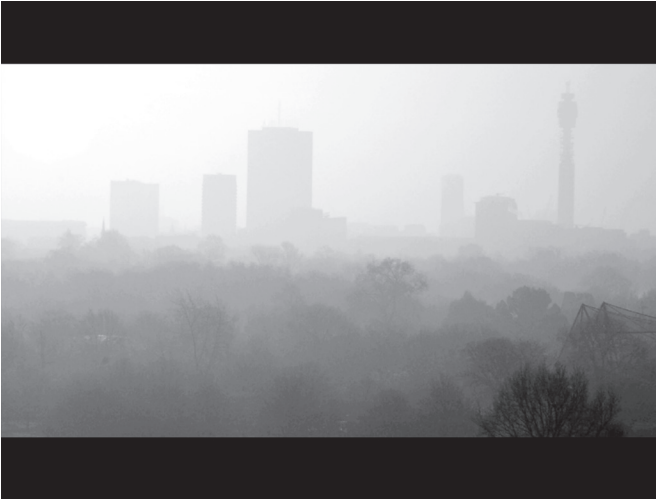
[Figure 1.1.] John Akomfrah, All That Is Solid , 2015, single-channel HD color video, 5.1 sound, 29 minutes 52 seconds.

in what sort of institutions of memory, as well as in what sort of practices of engaging with remains?