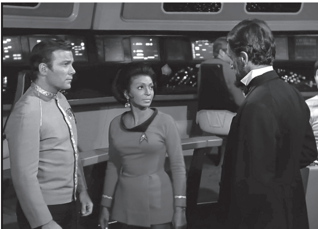
Figure 2.12. Kirk, Uhura, and Lincoln in "The Savage Curtain," Star Trek , season 3, episode 22.

At a disarmingly awkward moment early in "Savage Curtain," Lincoln, only recently arrived on the ship as a living lump of stone,