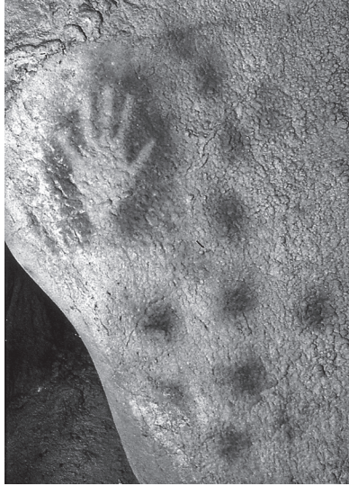
Figure 2.4. Pech Merle Hand, Paleolithic, Lot, France.

entirely, might we listen to the stone and the red ochre of a negative hand stencil as engaged in call and response? My response, as a twenty-first-century hand at the Paleolithic scene, is to the ongoing event at an incredible speed of connectivity: forty thousand years.