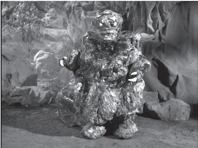
Figure 2.10. Living Rock in “The Savage Curtain,” Star Trek , season 3, episode 22.

I start with this rather daft example of a theater-making, crab-clawed inanimate life-form from outer space to highlight how absurd the idea of something/someone being equally inanimate and animate at once appears to the exemplary space-going liberal humanist trekkers. It’s strange enough to be presented as precisely that: alien . And yet, at the same time, that alien becomes “us,” both theatrically and in actuality. A debate about whether the rock-conjured historical personages were “mere” images runs across the episode but ends with Kirk’s resolute and decidedly swooning declaration that, no, he feels that he “actually met Lincoln.” The gleam in Kirk’s eye, captured now in a close-up, is meant to seduce us all to accept his juicy sphere of cross-temporal, cross-alien