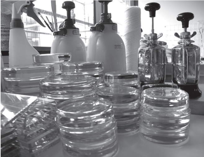
[Figure 1.4.] Image from the Archive Space exhibition, curated by Dr. Jane Birkin.

is how museums were in the first place inaugurated as media environments. To gaze and to admire were particular gestures that performed the space as it was supposed to be performed—as a stage of historical intrigue and also distance. Such were the learned affective attitudes that connected the new techniques of looking from dioramas to shopping arcades and department stores (Henning 2006, 5–36), while also becoming embedded in particular nation-state functions of educational value. As Michelle Henning (2006, 46–52) demonstrates, dioramas were places of education while producing a visual spectacle of social and natural history. The visibility included how time was maintained as if frozen; time was mediated as a photographic snapshot where the visitor is a spectator admiring a scene: to visit an imaginary past as a situation catered before your eyes.