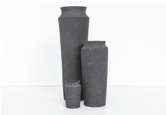
[Figure 1.8.] Unknown Fields Division, Rare Earthenware.

Such mapping, expeditions, and collective work can also be performative: remain unfolds in time and across multiple geographies. It comes out through the methodological structure of the expedition that starts to unfold what the remainder of technological production also might be. Designers and studios, such as Liam Young and Kate Davies's Unknown Fields Division, address the wider infrastructural question through annual design research expeditions to the peripheries of infrastructures of technology; container ship traffic, e-waste in Mongolia, lithium mining in Bolivia, the rural landscapes that are essential as the planetary-scale "conveyor belt" of technological, remain as an issue also for the broader context of critical design.