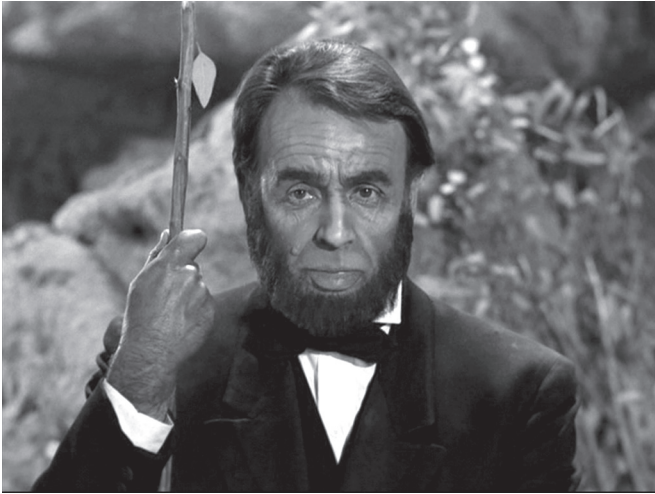
Figure 2.13. Lincoln in "The Savage Curtain," Star Trek , season 3, episode 22.

the title "savage" as well as with the allusion to theatricality in "curtain"?). At one point, blackened Rock/Lincoln faces the camera in a full frontal close-up that presents him as a bust. He is in full blackface at this point, and says, stone still and staring directly at his future audience, "I was reputed to be a gentle man when I was commander in chief during the four bloodiest years of my country's history. I gave orders that sent one hundred thousand men to their death at the hands of their brothers."