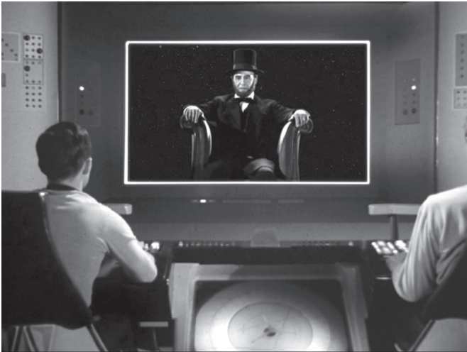
[Figure 2.8.] Lincoln encountered by the Enterprise crew in “The Savage Curtain,” Star Trek , season 3, episode 22, first aired March 7, 1969.

As the rock-become-Lincoln steps aboard the Enterprise , is scanned and read as living, the crew switch from the pronoun “it” to “he,” and the drama begins to unfold. Only the medical doctor McCoy seems suspicious. As Lincoln and Kirk head from the transporter room to the bridge, McCoy steps to the side to speak to Scotty: