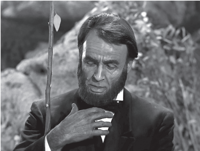
Figure 2.14. Lincoln in “The Savage Curtain,” Star Trek , season 3, episode 22.

as if it might strike him across a fault line in the rock that is his self, or across the history that is not past. His hand trembles now like the leaf as he says, simply, to Kirk, “There is no honorable way to kill.”