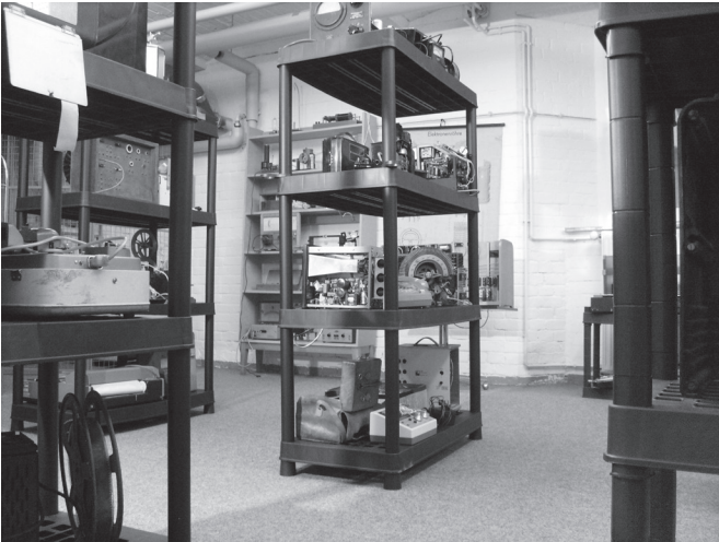
[Figure 1.5.] The Media Archaeological Fundus, an image of the earlier cellar space at Sophienstrasse, Berlin.

thus and other sites as creative infrastructures for encounters with remains of technological past as archaeological objects. In addition, one should mention the complementary work of the Signal Lab upstairs in the same building in the Media Studies Institute. Both contribute toward spatial situations of remain(s). Let's start with the Fundus, which lies, at least metaphorically, at the bottom.