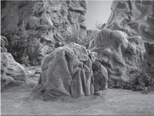
[Figure 2.9.] Rock creature in "The Savage Curtain," Star Trek , season 3, episode 22.

appears to return to rock, we know no more about it or him or them than the capacity to stand by, and in standing by, become.