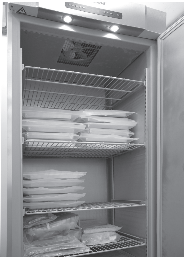
[Figure 1.3.] Image from the Archive Space exhibition, curated by Dr. Jane Birkin.

question later, in the context of issues of infrastructure as well as obsolete hibernated stocks of technological culture that seem to form the other environmental context of remain(s).