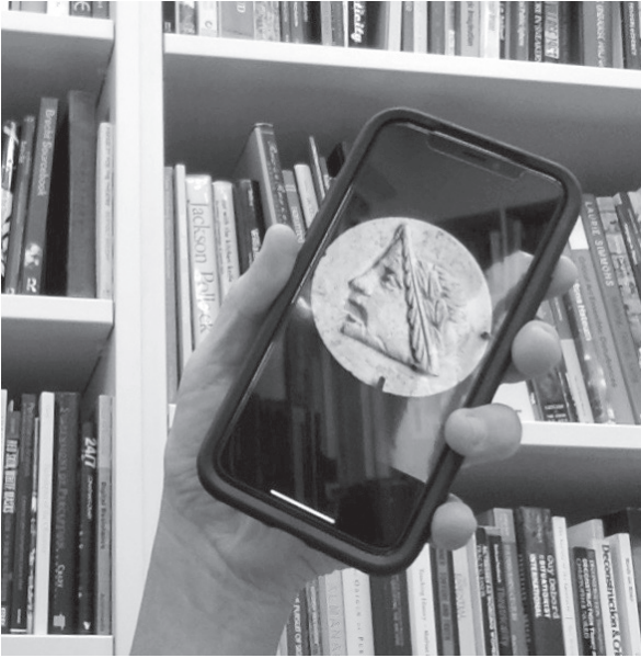
[Figure 2.7.] Gaming Piece on phone screen, 2018.

of oldness and newness. Something's coming! Something's going! Again! And again, the event will mask itself as something never before seen or experienced, something just out of reach brought close to hand, or something close to hand pressed just out of reach. Can we mark a collective thrall to the continual reproduction of obsolescence as an embodied habit of empire? Is obsolescence a physical habit, a learned experience? Is it itself is a kind of ongoing and live habit of sloughing media like skin, a gestic mode of use and refuse that could be considered a part of media's remains?