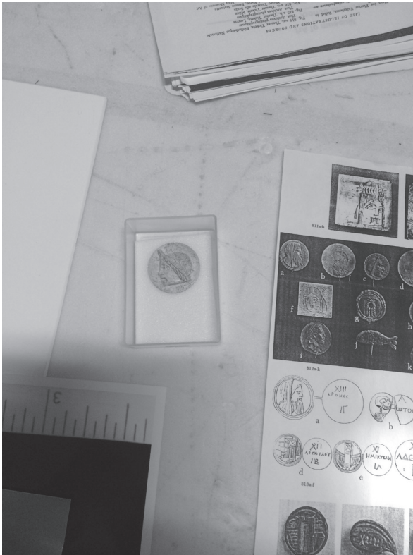
[Figure 2.2.] Gaming Piece in its box at the Museum of Art, Rhode Island School of Design, 2014.

boldly telling what no man has told before of what had already occurred but has yet to be encountered. In Greek tragic practice, something of the past recurs to hit with the full force of new(s) only belatedly—new only by virtue of being bygone. Restaging Greek tragedies, Romans changed this practice to reenact the horror in full view of the audience—such as Medea murdering her children. If Oedipus still gashed his eyes out offstage to be told by