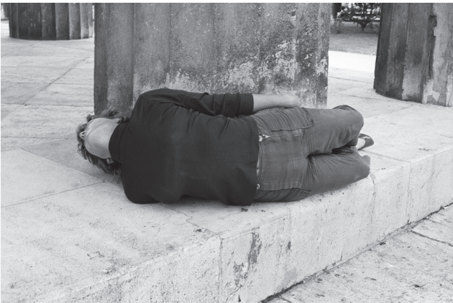
Figure 2.6. Valie Export, WVZ 229 , 1982. Copyright Valie Export, Bildrecht Wien, 2018. Courtesy Valie Export.