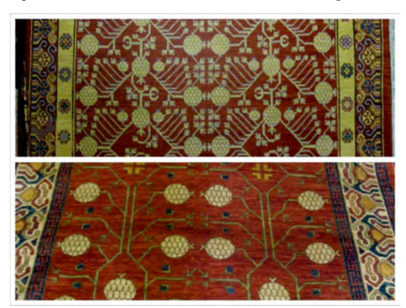
Figure 2: Old (above) and new (below) Khotanese carpets.

Nowadays, people in Khotan don't make good-quality carpets anymore. But the design is very beautiful, so now they make them in Afghanistan. They copied the design from the old carpets I sold to the Pakistani, and now they bring me new ones. This [pointing at one of those carpets] is made in Afghanistan, but the design is from Khotan. It's a local design (interview, May 2013).