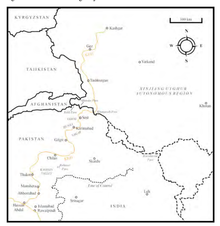
Figure 1: The Karakoram Highway