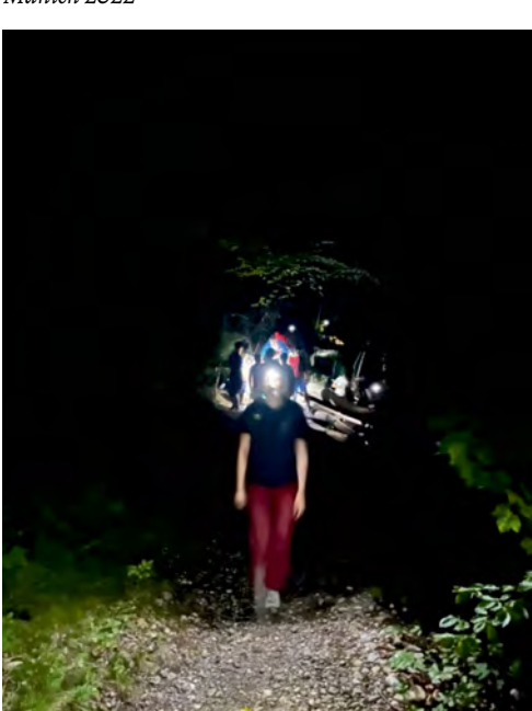
Along the River Isar at 3:42 am with The Long Run, Munich 2022