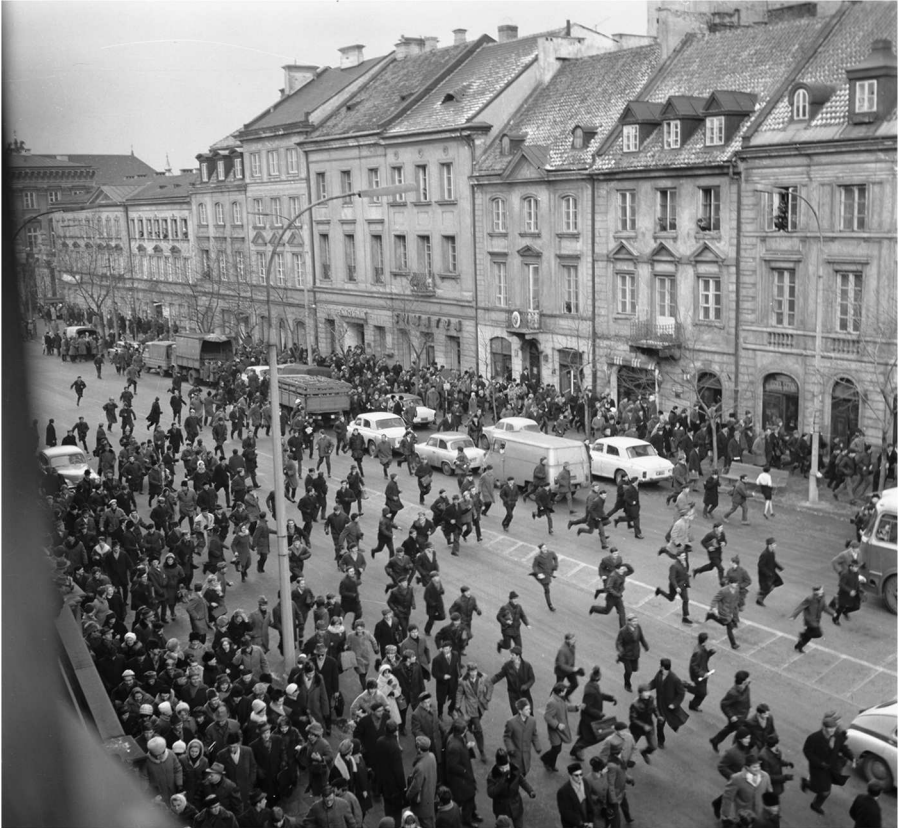
Figure 6.1 In 08.03.1968 thousands of students gathered in the courtyard of the University of Warsaw in protest against the violations of the extraterritoriality of the university. The militia attacked the youth and dispersed the demonstration.