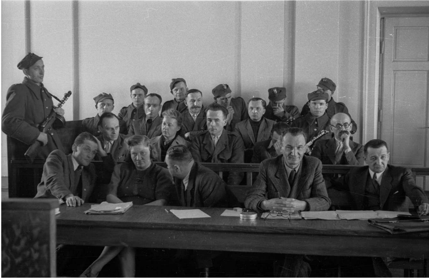
Figure 0.1 Polish war-hero, resistant fighter and spy for the Allied West Witold Pilecki at his show trial in Warsaw on March 3, 1948. Pilecki was executed two months later. At the picture Pilecki is sitting first on the left in the second row. In the first row are the solicitors.

during the interwar years, the protocol was not as lucid with regard to the countries in East Central Europe that fell under Soviet occupation from 1944 to 1945 (Naimark, 2017, pp. 63–65). Stalin himself, apparently lacking a pre-conceived and consistent blueprint for disseminating the communist revolution to East Germany, Czechoslovakia, Poland, and Hungary, announced the possibility of ‘different paths’ to communism (Naimark, 2017, pp. 65–70).