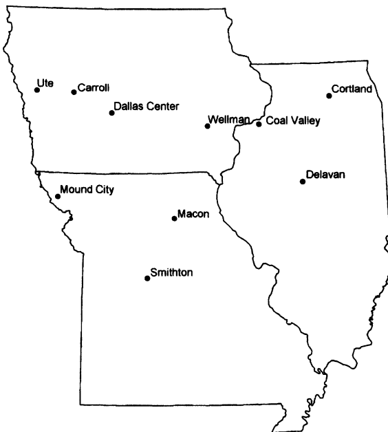
Map 2. Tour of the Lower Midwest

Rural Midwesterners' records also show that readers of farm newspapers were diverse in terms of economic status, age, and place of origin. The following case studies give a taste of the background and characteristics of the