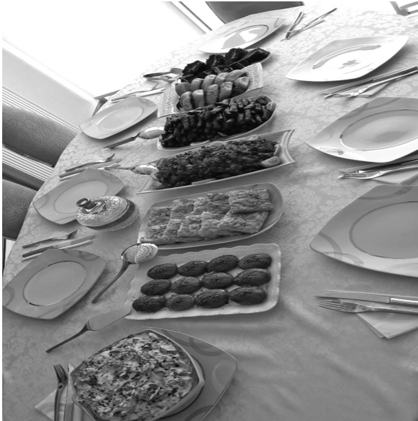
Figure 8.3 An example of the food served at Reception Days in Yasemin Park.