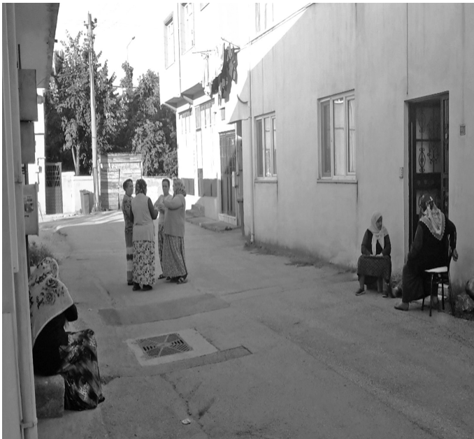
Figure 8.1 Traditional working-class women of Panayır chatting with their neighbours in the afternoon.

People live in the traditional Anatolian culture. We have good neighbouring relations. If we go along some side streets, we can find a scene where women are all together eating some kısır 1 and drinking tea. This is quite a positive, sharing activity.