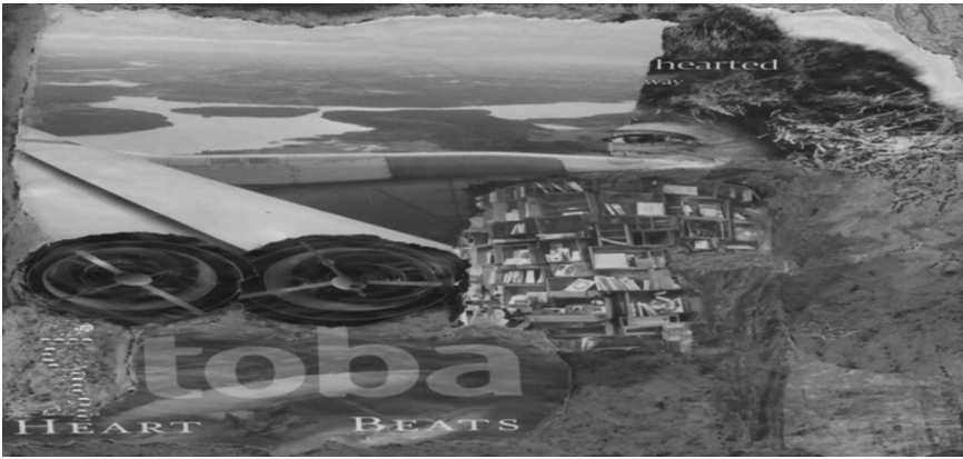
Figure 8.3 Adventurous journeys alongside the demands of study; nurturance and perseverance help, by Tuula Heinonen.