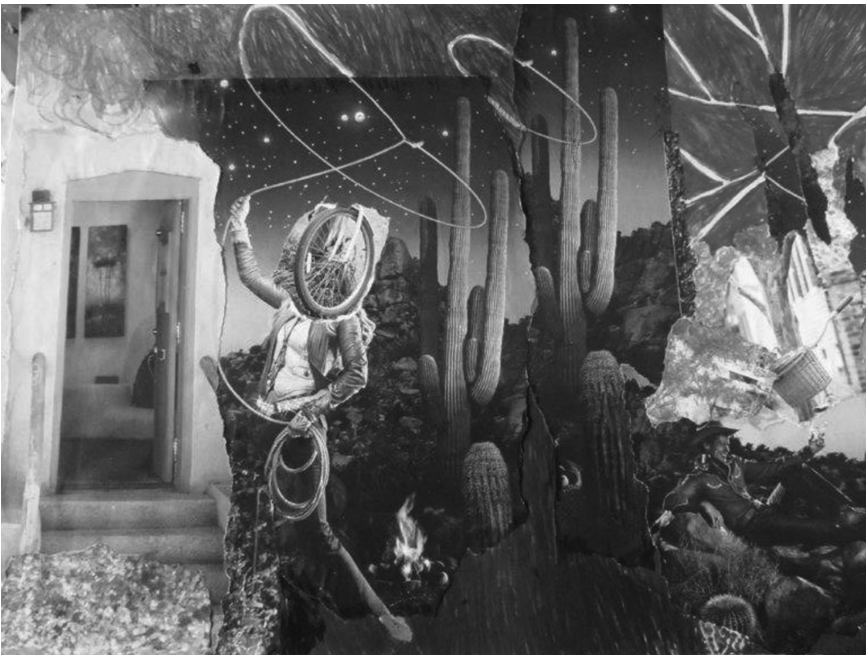
Figure 8.4 Home fires and solid earth; ideas keep turning and spinning; need for grounding, by Tuula Heinonen.