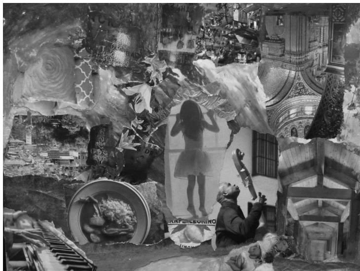
Figure 8.1 Time to finally enjoy life again; no longer looking in from the outside, but actively living after the degree, by Tuula Heinonen.