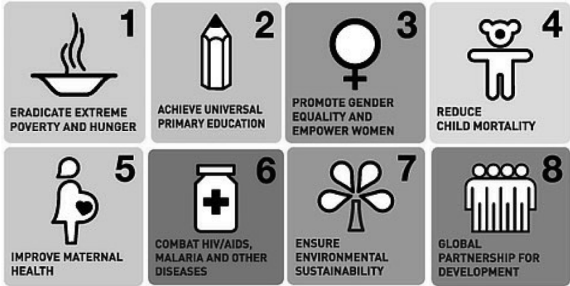
Figure 4: Millennium Development Goals

referred to as the MDGs, were eight easy-to-remember, time bound, focused and measurable goals that people worldwide could rally behind (see Figure 4). They were drafted in the late 1990s and came into force through the Millennium Declaration, adopted by the UN General Assembly on September 8, 2000. They were intentionally ambitious, with goals such as “halving extreme poverty” and “providing universal primary education” by 2015.