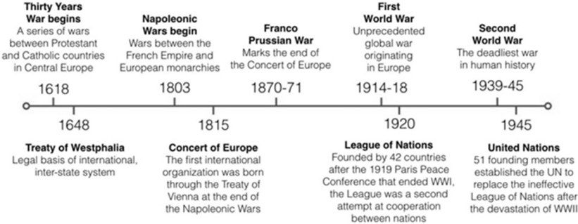
Figure 1: Evolution of international organizations, until 1945

The United Nations is not the first but the third in a series of international organizations that date back to 1815. To give some historical context to the establishment and workings of the United Nations as it is today, the first part of this chapter describes these organizations and the key events that led to their creation (see Figure 1).