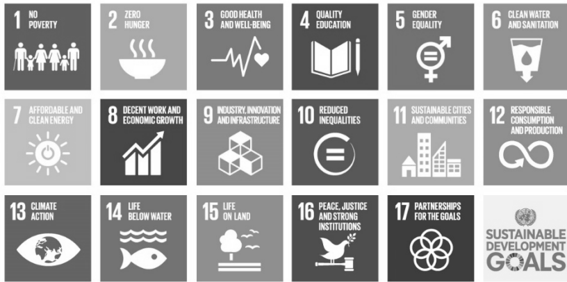
Figure 5: Sustainable Development Goals