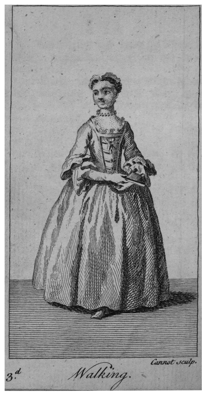
Figure 4.2a 'Walking' in The Polite Academy (London: R. Baldwin and B. Collins 1762). © The British Library Board (Shelfmark Ch.760/41)