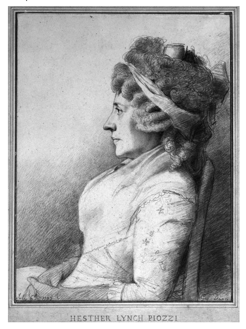
Figure 6.2 George Dance, Hester Lynch Piozzi (1793).

subversive female act of sexual equality. By marrying Piozzi, Hester Lynch Thrale 'actively defied the self-regulation that other bluestocking women had insisted upon' to gain social respect as women stretching gender boundaries, and chose 'to follow instead her unrestrained passions'. Nussbaum argues that Thrale regarded a woman 'openly following her passions as establishing a new kind of sexual equality' and thus established a gender-bending code of conduct of her own.<sup>209</sup> Indeed, as one of the most strictly regulated areas of women's life, sexuality also held subversive potential. It is this potential we will examine in the following final section of this book.