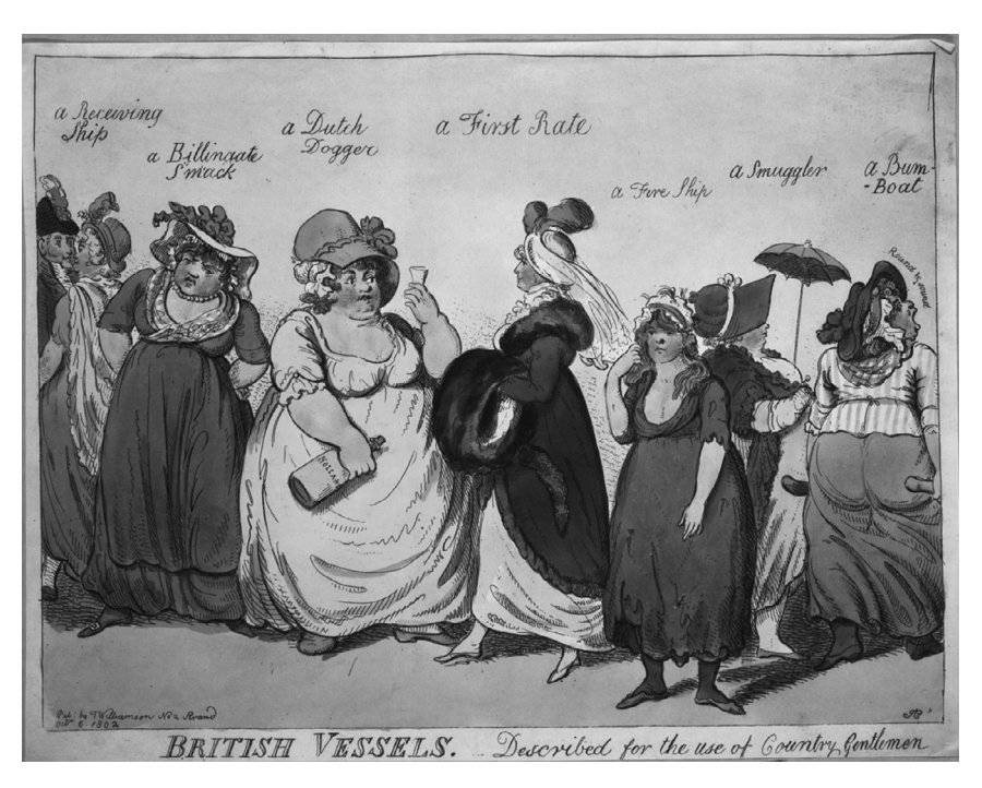
Figure 4.1 British Vessels. Described for the Use of Country Gentlemen. (London: T. Williamson 1802).

However, the power dynamics of eighteenth-century female bodily display were far less straightforward than simply men asserting an evaluative and desiring gaze over women. For one thing, women were doing the watching as well. Indeed, women of polite society actively and vigorously patrolled the boundaries of acceptable female behaviour, and could, indeed, be each other's keenest and strictest critics. This is, of course, an example of the practical manifestations of patriarchy, where women are taught to observe themselves and each other through masculine spectacles. Sandra Lee Bartky writes that a woman, knowing that 'she is to be subjected to the cold appraisal of the male