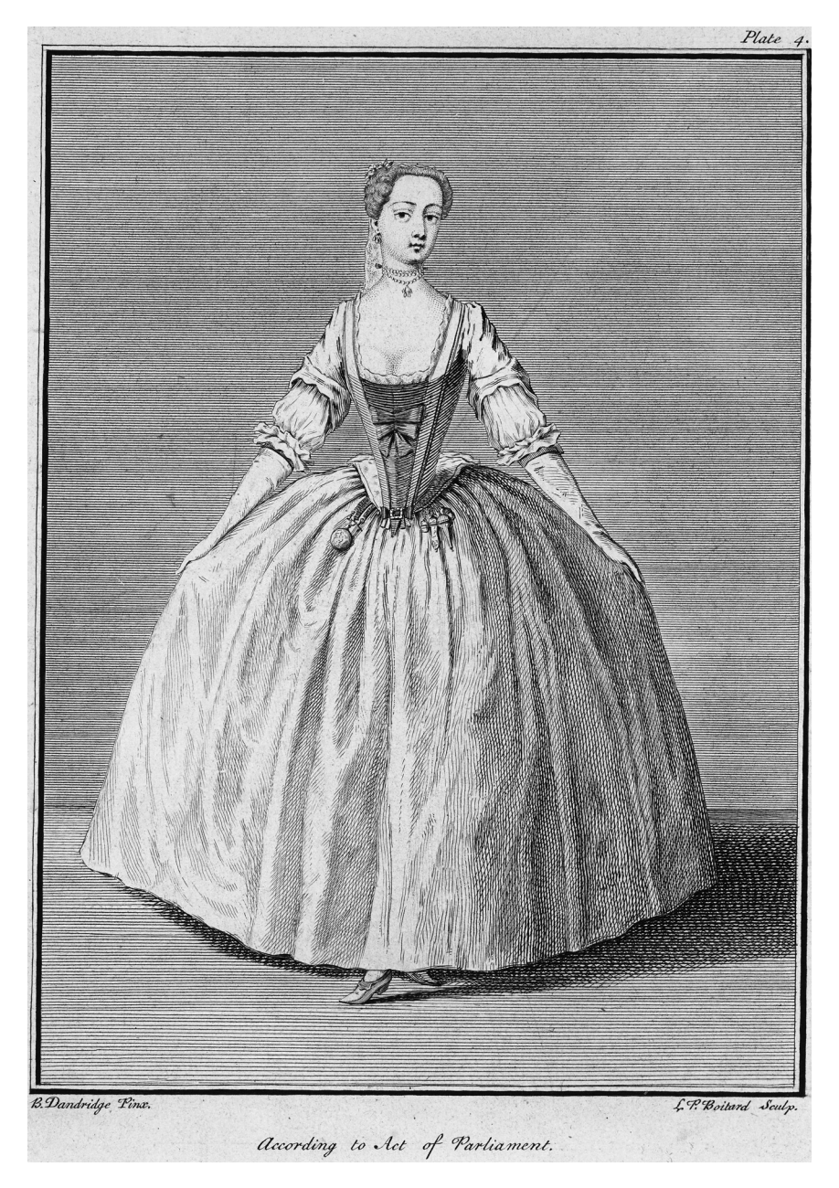
Figure 4.3 'Dancing' in François Nivelon, The Rudiments of Genteel Behavior ([London?]: [s.n.] 1737). © The British Library Board (Shelfmark 1812.a.28)