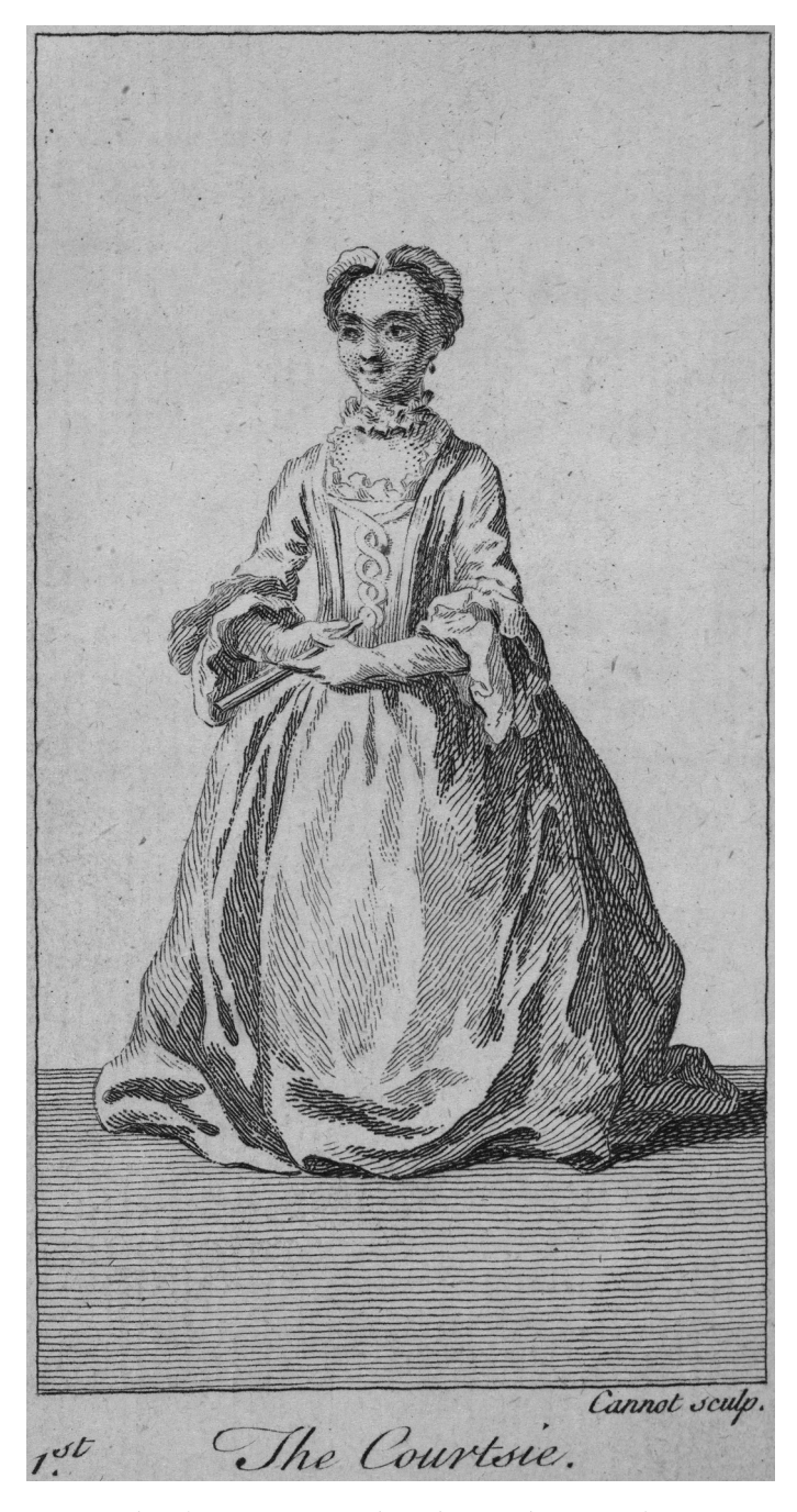
Figure 4.2b 'The Courtsie' in The Polite Academy (London: R. Baldwin and B. Collins 1762). © The British Library Board (Shelfmark Ch.760/41)