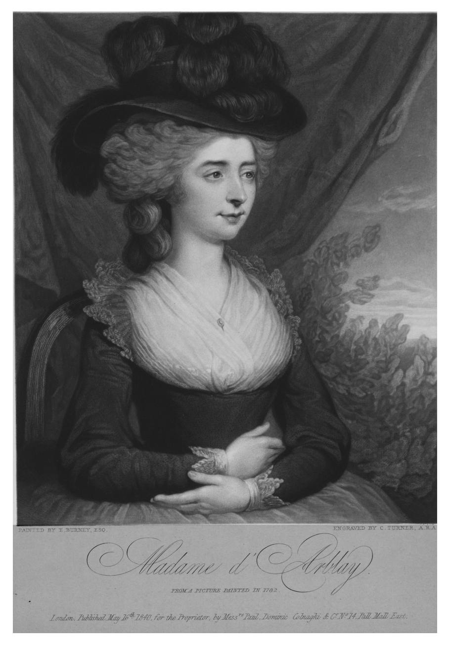
Figure 5.2 Charles Turner after Edward Francisco Burney, Fanny Burney (1840).