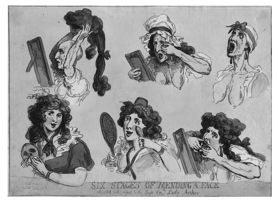
Figure 4.4 Thomas Rowlandson, Six Stages of Mending a Face (London: S. W. Fores 1792).

'is Virtue and Goodness only, that make the true Beauty'. 144 However, despite the implicit connection between beauty, goodness, and transparency, beauty, too, could be put on as a 'beautiful mask' to gild the 'otherwise deformed vice of impurity' with the help of artificial enhancements. 145 Equating beauty with morality was little more than a rhetoric tactic to frighten women into conformity by threatening that unfeminine behaviour would wither their beauty. Even Melmond's panegyric on Indiana's beauty in Camilla reveals itself to be, more than anything, a derision of the blind belief in physiognomic correspondence between inner goodness and outer beauty, since the reader knows perfectly well that Indiana's spoilt character by no means lives up to her good looks. Indeed, since beauty played such an important role in ideals of polite femininity, it was widely used as a discursive whip, forcing women to discipline themselves into propriety and morality in order to preserve their good looks.