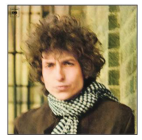
These album covers are not covered by the CC BY licence, and can not be reused.

The covers of albums 5, 6 and 7 are all in color. While nos. 5 and 6 have letters spelling "Bob Dylan" and the album title in their frames, Blonde on Blonde has no frame or writing at all. Without frames, the viewers are not held outside, and without writing, nothing is predefined. According to Machin (2010, ch. 2), when the portrayed artist's gaze addresses the viewer, it breaks out of the frame or border (here the album itself is the frame) so that the artist can communicate with the viewers/listeners instead of communicating with other people in the photos. This openness towards the audience is balanced against the artist's direct and demanding gaze. We meet this gaze in several portraits, most clearly on the covers of Bringing It All Back Home and Highway 61 Revisited. Kress and van Leeuwen claim that "if the picture is at eyelevel, then the point of view is one of equality and there is no power difference involved" (1996, p. 146). That may be right, but after working with religious art, in particular with the pantocrator (see above), it is hard to avoid seeing the power differences here, too.