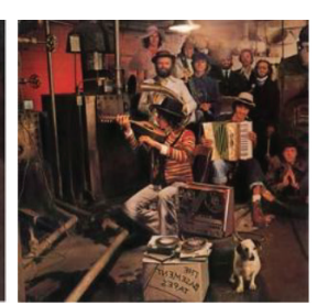
These album covers are not covered by the CC BY licence, and can not be reused.