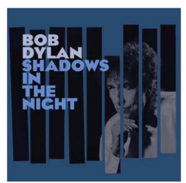
These album covers are not covered by the CC BY licence, and can not be reused.

The final two images to be commented on in this essay were published in 2001 and 2015. They are in black-and-white, and they are both rather dark. The word "theft" and the fictional jailhouse make me think that this is about crime and prison. The cover of "Love and Theft" has much in common with other albums discussed above – for example, the artist's gaze leveled directly at the viewer.