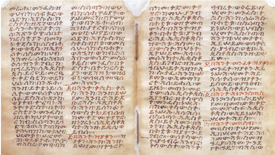
Fig. 2: Manuscript of the Aksumite Collection , foll. 17v–18r, after restoration (foll. 16v–17r according to a preliminarily reconstructed numbering, cf. Bausi 2011c, 30–33). Traditio apostolica , 3:3–4; 7; 8:1–8; 13; 11; 10:1–3.

the study of the texts was troubled by a series of problems which now seem to be finally resolved. An edition is being prepared, and the texts will soon be put at everyone's disposal. Meanwhile, increasingly detailed descriptions of the contents, also covering some linguistic aspects, and partial editions have appeared. 68