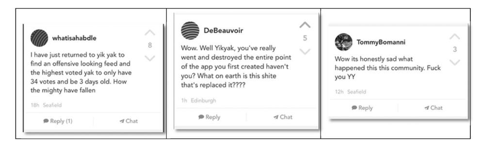
Figure 4. Example yaks posted in response to the removal of anonymity.

The introduction of a username and profile was a terrible decision by the app creators, it would be interesting to find out why they did this as the main appeal of Yik Yak was the anonymity it provided. The username made people less likely to post in general, repeat posts would be noticeable and any comments or responses would be clearly attributed to a profile.