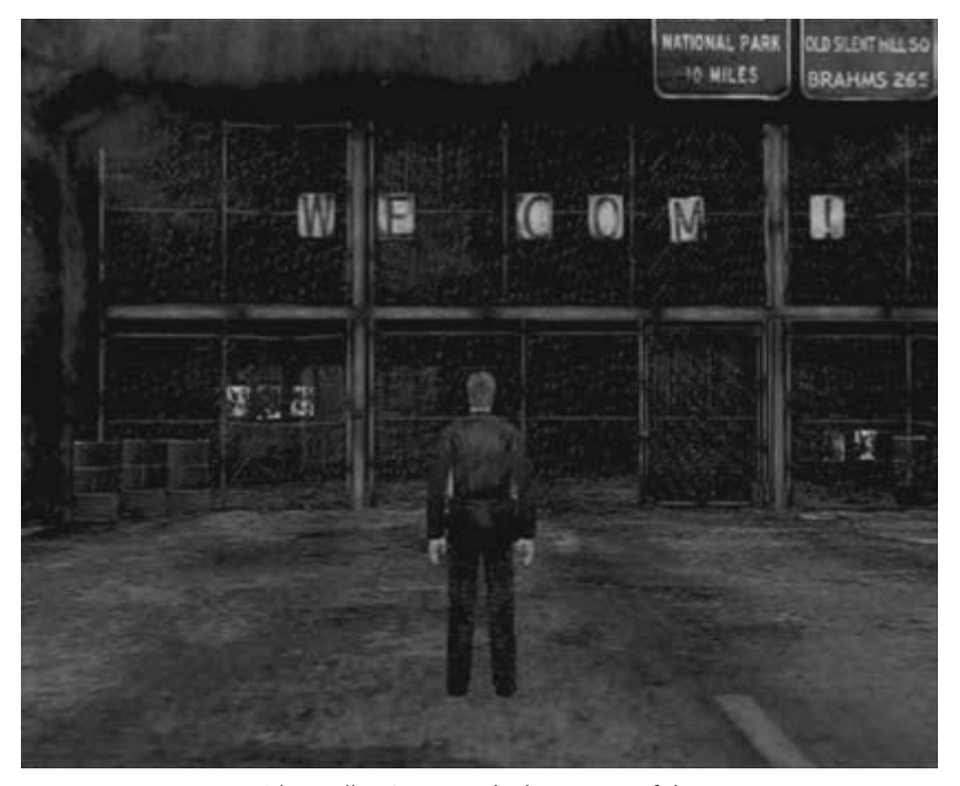
Fig. 7. Silent Hill 2: A sign at the beginning of the game

crossed corridors slowly deteriorate. The atmosphere becomes completely insane. The ceiling changes to a grate. Jacob glances at mournful patients rocking weirdly. An eerie room tone of groans and muffled screams comes from behind closed doors, while the sound of the gurney wheels seen in closed shots is heard. Blood, pieces of flesh, and limbs lie strewn on the ground. In a room, a muscular black man with no legs vibrates endlessly, his head covered with a black hood (one of the movements opening SH3). Silent Hill completely stretches out the nightmarish journey of Adrian Lyne's movie. It is not for nothing that Jacob's Ladder is regarded as one of the game's main inspirations. The beginning of SH: Homecoming and the bonus clip titled "USAGI" of Lost Memories: The Art & Music of Silent Hill (2003) remain direct homage to the movie's gurney ride, as is the similarity of the army jackets that both Jacob and James Sutherland (SH2) wear.