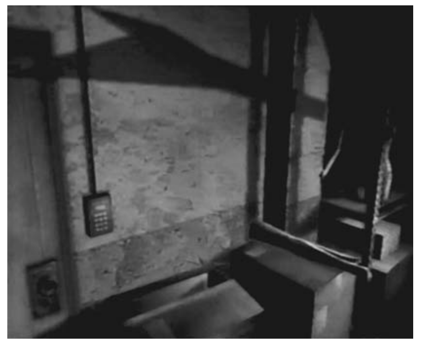
Fig. 4. Silent Hill 3: The silhouetted arm of a Mannequin running across the wall of the storeroom

around only to see the shadows following your move, as around Heather's school desk in SH3 , or casting nice shadows while you follow Michelle Valdez and Lisa Garland home in SH: Shattered Memories .