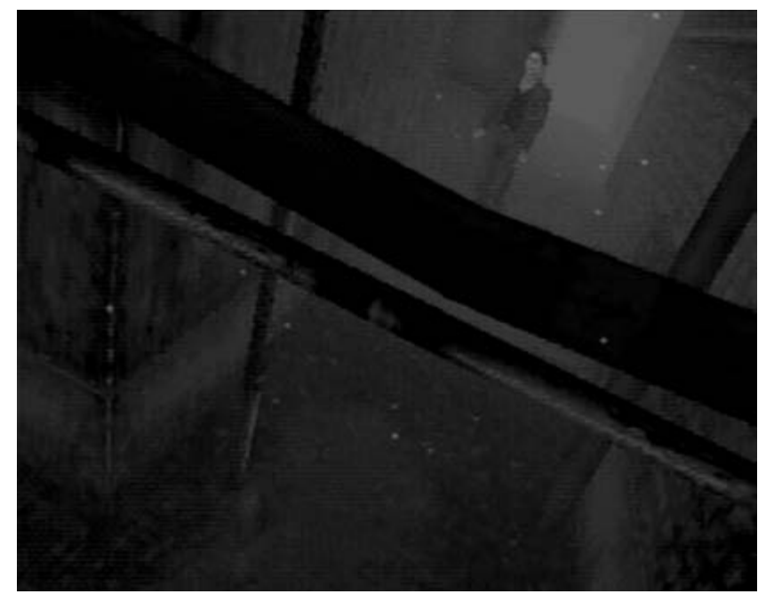
Fig. 10. Silent Hill 1: The camera moving to frame Harry Mason through pipes

moves in a peculiar manner to show the distressed father through several pipes (fig. 10), rises up, and looks down vertically as he reaches a corner.