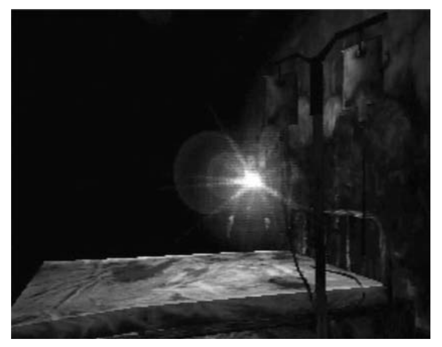
Fig. 8. Silent Hill 1: A lens flare

fights with monsters; they are also added in SH4: The Room when ghosts appear—during short dying cut-scenes and during the passages through the hole connecting the different worlds. But even with a lower-resolution image, SH1 has a filmlike appearance. Michael Riser reminds us of this in his review of SH3 : "The original Silent Hill still looks quite attractive for a PS title, but there's something far more important about it: it gave the series' art style its roots" (2003). Consequently, a more obvious visible (and to become very popular) element gives the series its visual style: the lens flare effect simulating the glow-over part of the image caused by a source of light hitting the lens of a camera. While there is no sun in Silent Hill (as compared to Liberty and Vice cities of the Grand Theft Auto series) to create such an aesthetic impression, each time you stare into the lens with your flashlight, it creates such flares (fig. 8).