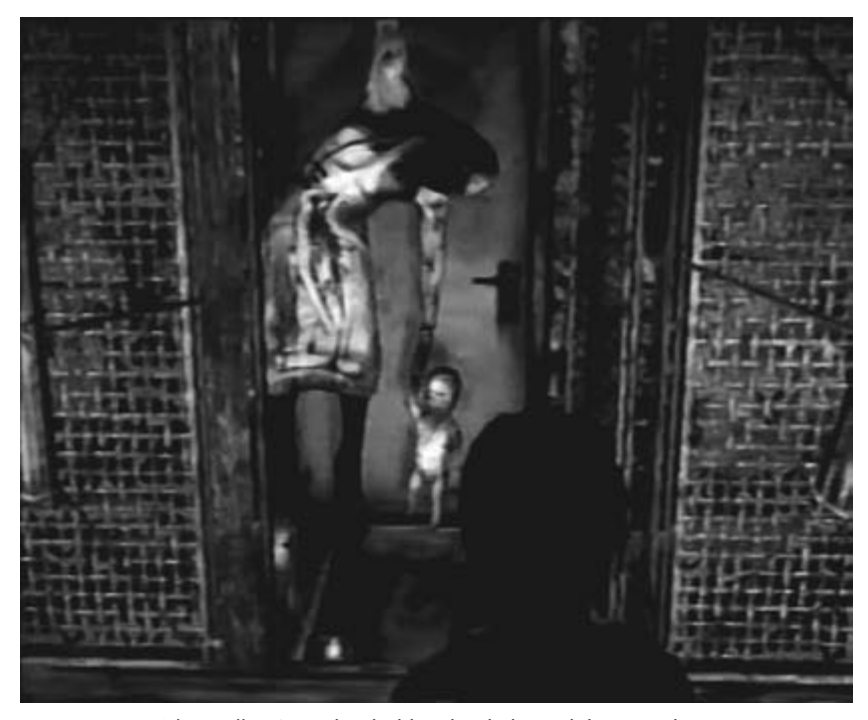
Fig. 2. Silent Hill 3: A mother holding her baby with her womb cut open

However, the role of Silent Hill is even more important in the series. In interviews, Akihiro Imamura usually gives the same answer to this question: