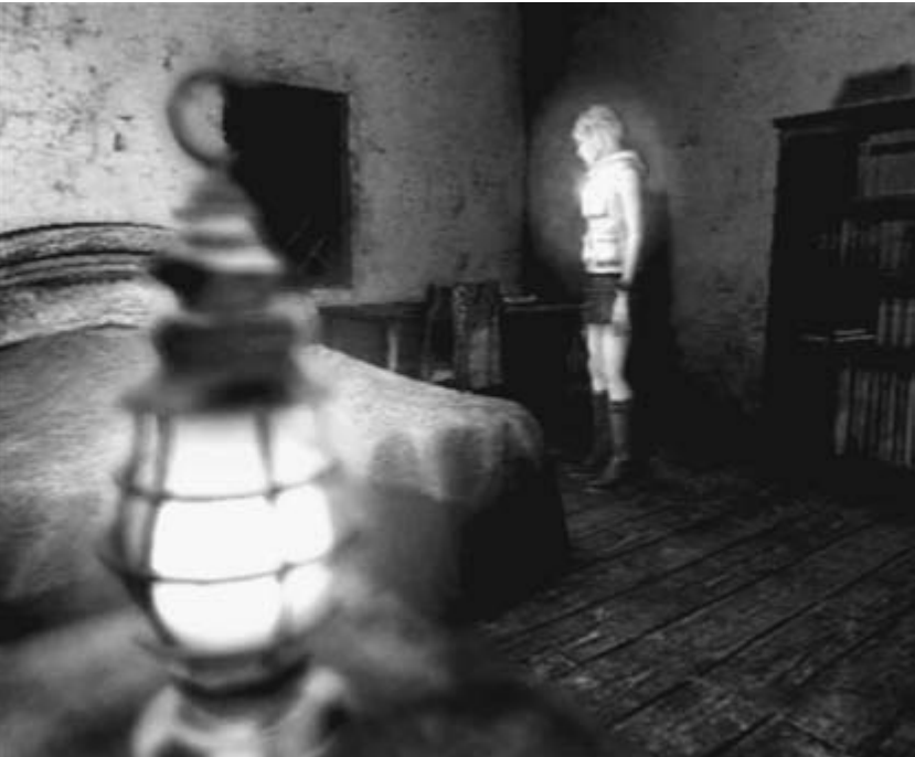
Fig. 9. Silent Hill 3: Two beautiful shots showing Heather Mason, first in the basement of the Brookhaven Hospital, then in a room of the church