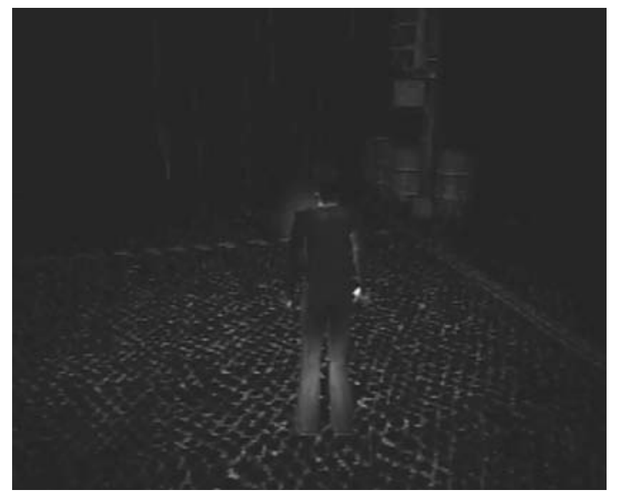
Fig. 1. Silent Hill 1: Harry Mason walking in the dark, over the bottomless abyss of the Otherworld

builds a whole new frightening atmosphere. To render its fully real-time 3-D environments, Team Silent dealt with the finite processing resources of the PlayStation by limiting the field of vision. The fog and darkness are used to hide what is not depicted. As many reviewers have noted, this technical limitation has resulted in one of the most praised aesthetic effects of the game. The feeling of entrapment is very pronounced. You don't see very far when wandering the streets of the resort town. The limits remain uncertain. You are always expecting to run into something awful. When you end up in the Otherworld and the streets change to grates, you are really made to feel as if you were walking over a bottomless abyss (fig. 1).