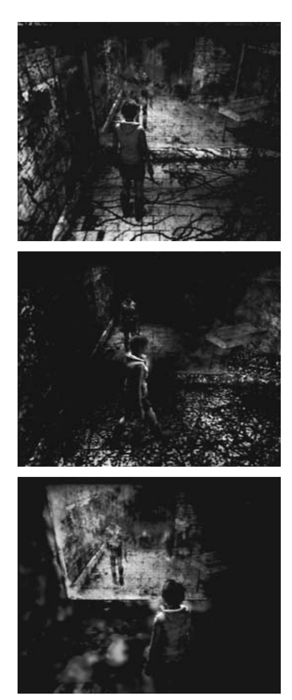
Fig. 5. Silent Hill 3: Three stages of the frightening event taking place in the storeroom of the nightmarish Brookhaven Hospital \,