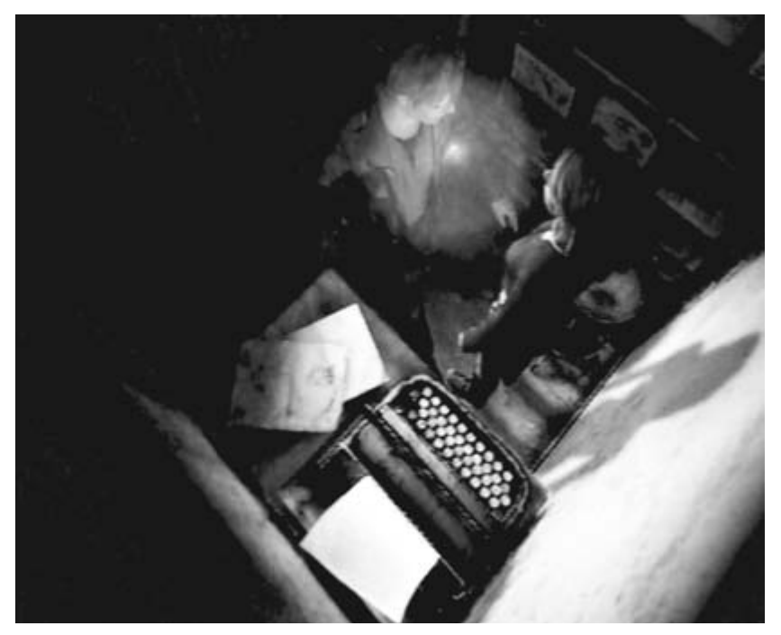
Fig. 11. Silent Hill 2: Maria making a sudden apparition next to the typewriter in the small document room of Brookhaven Hospital

can only see in front of you with the flashlight, you hurriedly look around to see what made that noise and if a monster is there. What's more, when you are made aware of the threat from the left, the right, or behind you, you become conscious of the use of surround sound and of the 360-degree space of the video game. You truly look around.