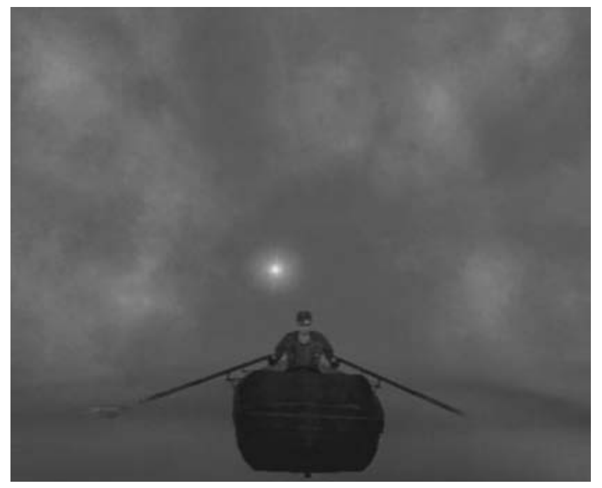
Fig. 12. Silent Hill 2: James Sunderland crossing Toluca Lake to reach the Lake View Hotel

The notion of duration cannot be overlooked with regard to the crossing of the Toluca Lake either. You have to row the boat across the lake to reach the Lake View Hotel. Without the help of the green arrow on the map showing your position, it is a light seen through the fog that serves as your beacon (fig. 12).