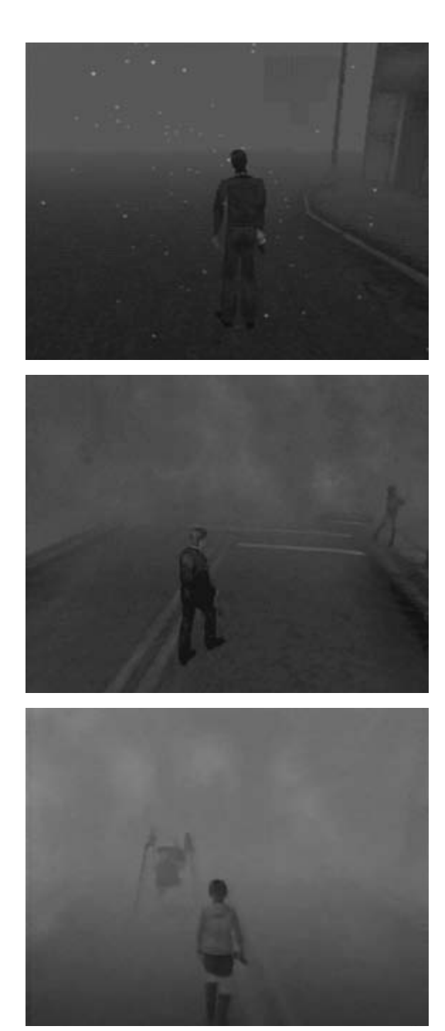
Fig. 3. The fog in (a) Silent Hill 1, (b) Silent Hill 2, (c) Silent Hill 3