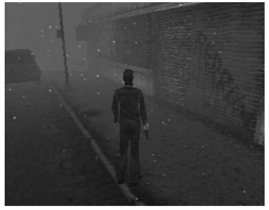
Fig. 6. Silent Hill 1: A clin d'oeil (wink) at Stanley Kubrick's The Shining on Bloch Street

sign at the beginning of SH2 is ample evidence: with two letters missing, it doesn't say "Welcome!" but "We com!" (fig. 7).