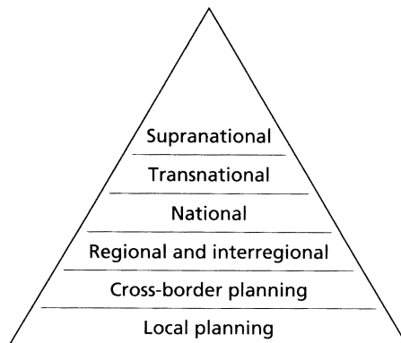
Figure 13.1 Typology of scales of EU spatial planning

Supranational planning is perhaps the easiest to define of the non-domestic scales of planning. It refers to planning for the territory of a group of countries as a whole. It has, of course, attained a high EU profile with the Europe 2000 and Europe 2000+ documents (CEC 1991, 1994) and with the European Spatial Development Perspective because the European Union is a jurisdiction. However, the latter condition does not necessarily have to be met. Work by the Council of Europe on the European Spatial/Regional Planning Schema in the 1980s (see Williams 1996: 79–80) is also an example of supranational planning, as was the 1991 Perspectives in Europe study by the Dutch government (RPD 1991; Williams 1996: 86–7). The spatial scale