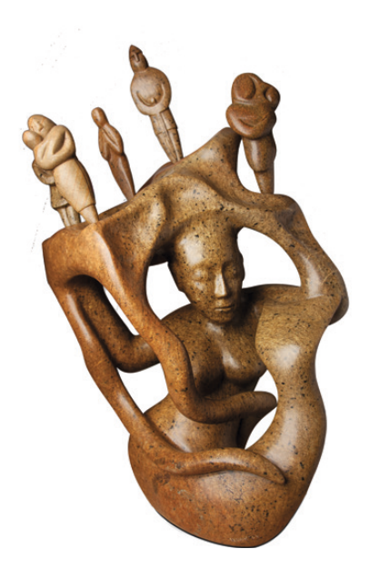
Figure 4.5 Abraham Anghik Ruben, 'Sedna: Life out of Balance'.