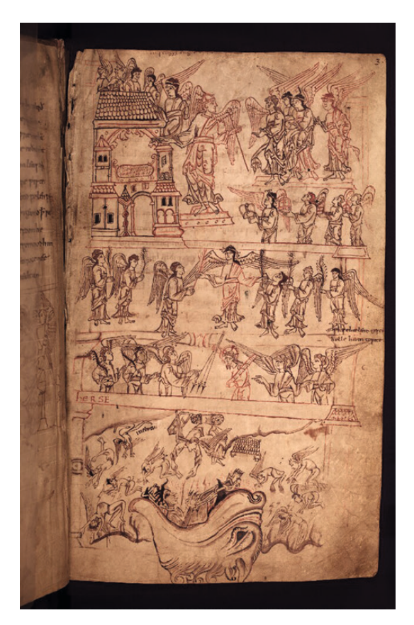
Figure 3.2 'The Fall of the Angels', Oxford, Bodleian Library MS Junius 11, p. 3.

Every man falls, the Christian tradition argues, but the angels fell first. The pictorial image and related poetic accounts of the fall of the angels in the early medieval Junius manuscript adapt and translate this scene into early English culture. The depiction of the falling angels finds an analogue in the slightly later Old English Hexateuch (London, British Library, Cotton MS Claudius B iv), while the two poetic narratives known as Genesis A and Genesis B , with which this image is connected, derive from the scriptural Genesis and from an Old Saxon version of it known as The Heliand . The relevant section of the first poem, Genesis A , the account of the fall of the angels from the second, Genesis B (found in a later section of the manuscript), and the pictorial image of angels falling are in unsettled conversation, with their relationships not entirely clear (see Figure 3.2). On page 2 of the Junius manuscript we find lines 33–48