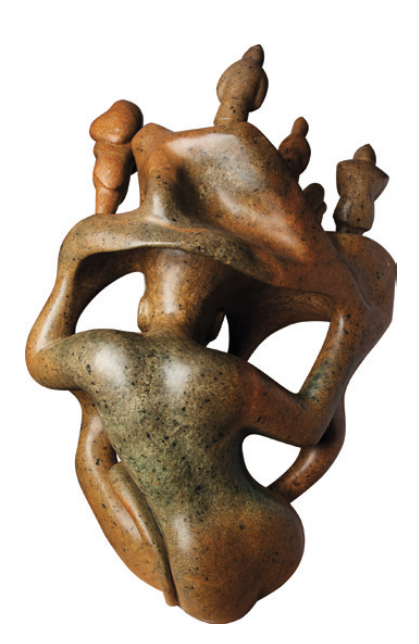
Figure 4.6 Abraham Anghik Ruben, 'Sedna: Life out of Balance' (reverse).