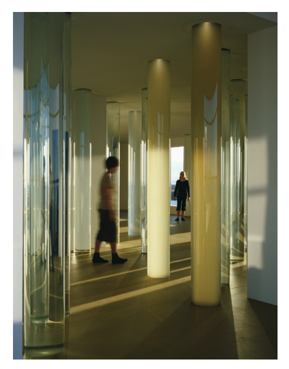
Figure 5.3 Roni Horn, Water, Selected , 2003/07. Twenty-four glass columns, each holding approximately 53 gallons/200 litres of water taken from unique glacial sources in Iceland. Permanently installed at Vatnasafn/Library of Water, Stykkishólmur, Iceland.