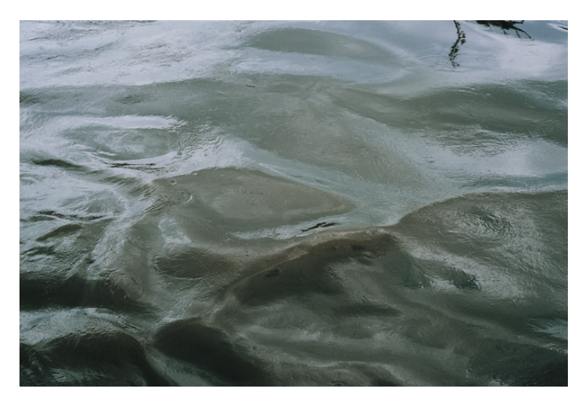
Figure 4.2 Roni Horn, Some Thames , 2000 (detail). Eighty photographs printed on paper. 25 \times 38'' / 63.5 \times 96.5 cm each.