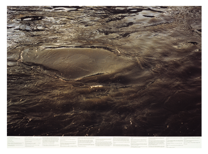
Figure 4.1 Roni Horn, Still Water (The River Thames, for Example) , 1999 (detail). Fifteen framed photographs and text printed on uncoated paper, 30.5 \times 41.5'' / 77.5 \times 105.4 cm each.

water. The photographs in the series point to the many meanings that this phrase might hold. Water can be still, can be stilled, literally and metaphorically, and can still be our subject, our 'master' verb, as Horn herself notes. Characteristically, Horn's phrase provokes. It poses the question of whether or not water can be gendered and so challenges us to think about mastery as a practice that might move beyond its conventional associations with masculinity and domination – and indeed the human – to something more fluid, transitional and relational. Expertise and expert knowledge come into play here too, as practices never quite mastered and always in flux: there is, after all, always more to be learned.