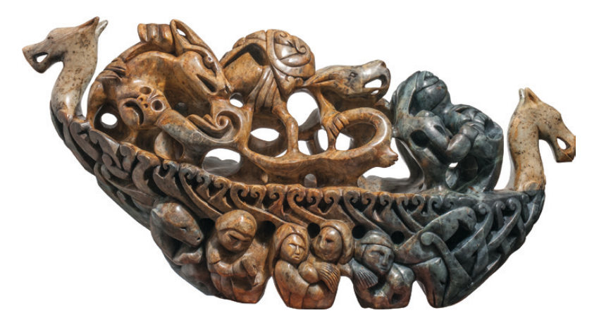
Figure 4.7 Abraham Anghik Ruben, 'Into the Storm: Ragnarok, End of Days'.

brought us in, we were stripped of clothing, showered and changed into new garments and went to roll call. By the time that was done, I had forgotten my parents' names.'<sup>27</sup> The pain of displacement is a theme he returns to frequently and imagines across Norse and Inuit cultures. Given this vital body of work, we were hard-pressed to choose out of thousands of sculptures, but out of the many pieces imaging journeys and boats by Ruben, we settled on this one (Figure 4.7), called 'Into the Storm: Ragnarok, End of Days'.