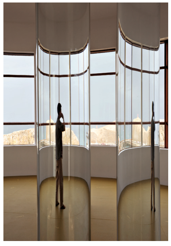
Figure 5.2 Roni Horn, Water, Selected , 2003/07. Twenty-four glass columns, each holding approximately 53 gallons/200 litres of water taken from unique glacial sources in Iceland. Permanently installed at Vatnasafn/Library of Water, Stykkishólmur, Iceland. Photo by Roni Horn.