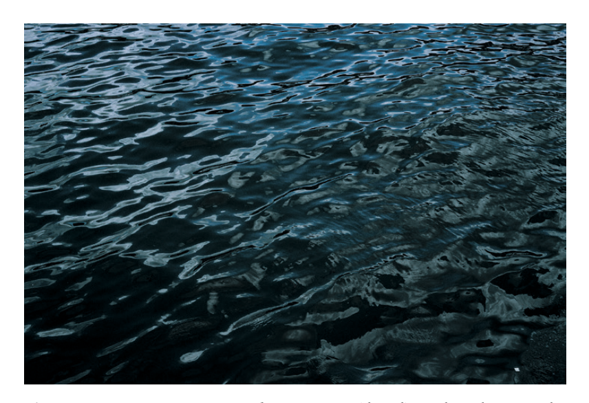
Figure 4.3 Roni Horn, Some Thames , 2000 (detail). Eighty photographs printed on paper. 25 \times 38'' / 63.5 \times 96.5 cm each.