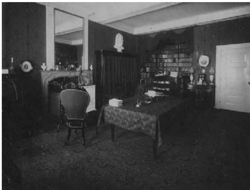
A domestic science: Fruin's study at the Steenschuur in Leiden at the end of the nineteenth century (Leiden, Regional Archives).

feeling that the promise contained in the Tien jaren was not being or had not been made good. 28 After his death, Fruin's critics publicly pronounced the diagnosis: the Leiden professor had become desiccated. In a confused and grandiloquent piece published shortly after Fruin's death, Willem G.C. Byvanck wrote that Fruin had lacked 'inspiration', and 'something else too: the divine joy of a life led generously and freely'. Albert Verwey repeated this in 1905: Fruin had been 'a good but frugal figure'. 29 However, his friends classified the minor work differently: the 'small change' was also said to be 'superior coin'.