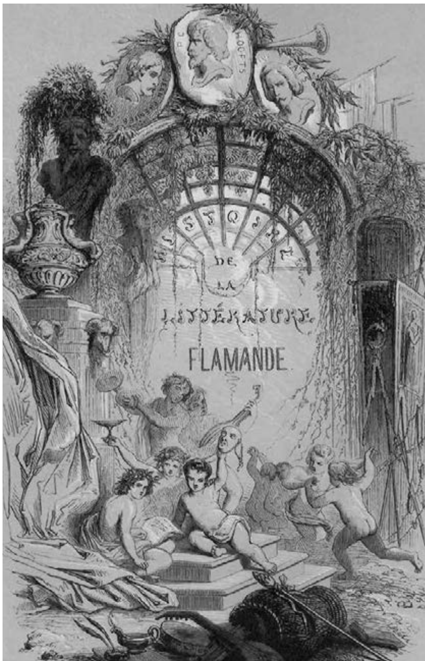
Title page of Snellaert's Histoire de la littérature flamande (1848) with the portraits of 'Jean Premier', 'P.C. Hoofts' (sic) and 'Kats' (sic).