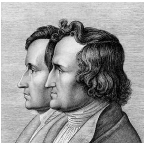
The brothers Jacob (right) and Wilhelm Grimm (left). Drawing, 1843.