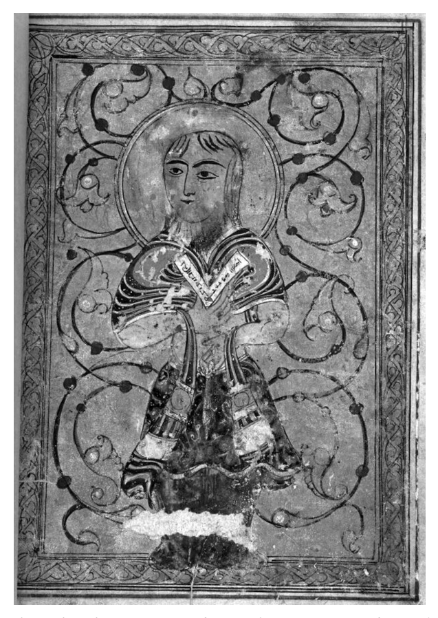
Figure 26.4 Book on the Characteristics of Animals (BL Or. 2784, f.2v). The contents of the breviary derive from the works of pseudo-Aristotle and 'Ubaydallāh ibn Ğibrīl ibn 'Ubaydallāh ibn Bokhtīshū' (d. 1058) who is tentatively to be identified as the individual depicted