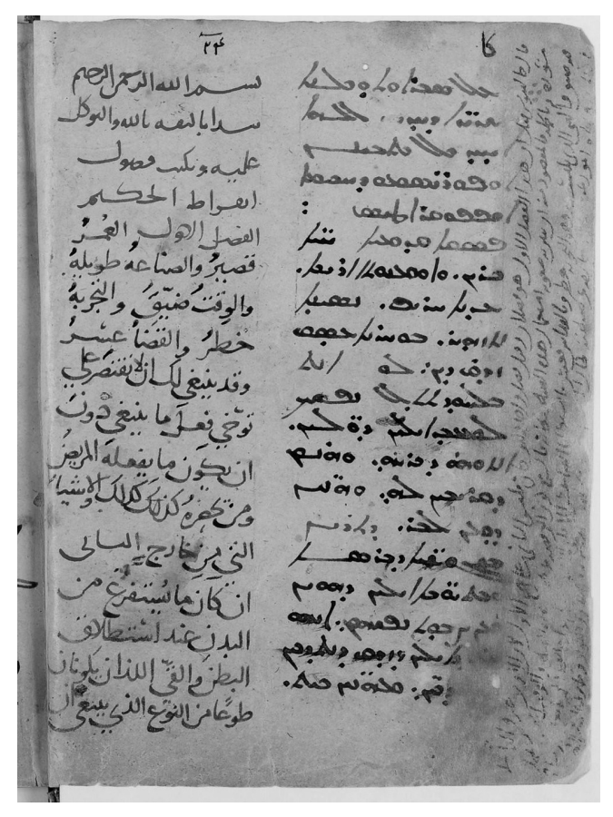
Figure 26.1 The beginning of the Syriac and Arabic versions of Hippocrates's Aphorisms (BNF arabe 6734, fol. 29v., dated 1205)