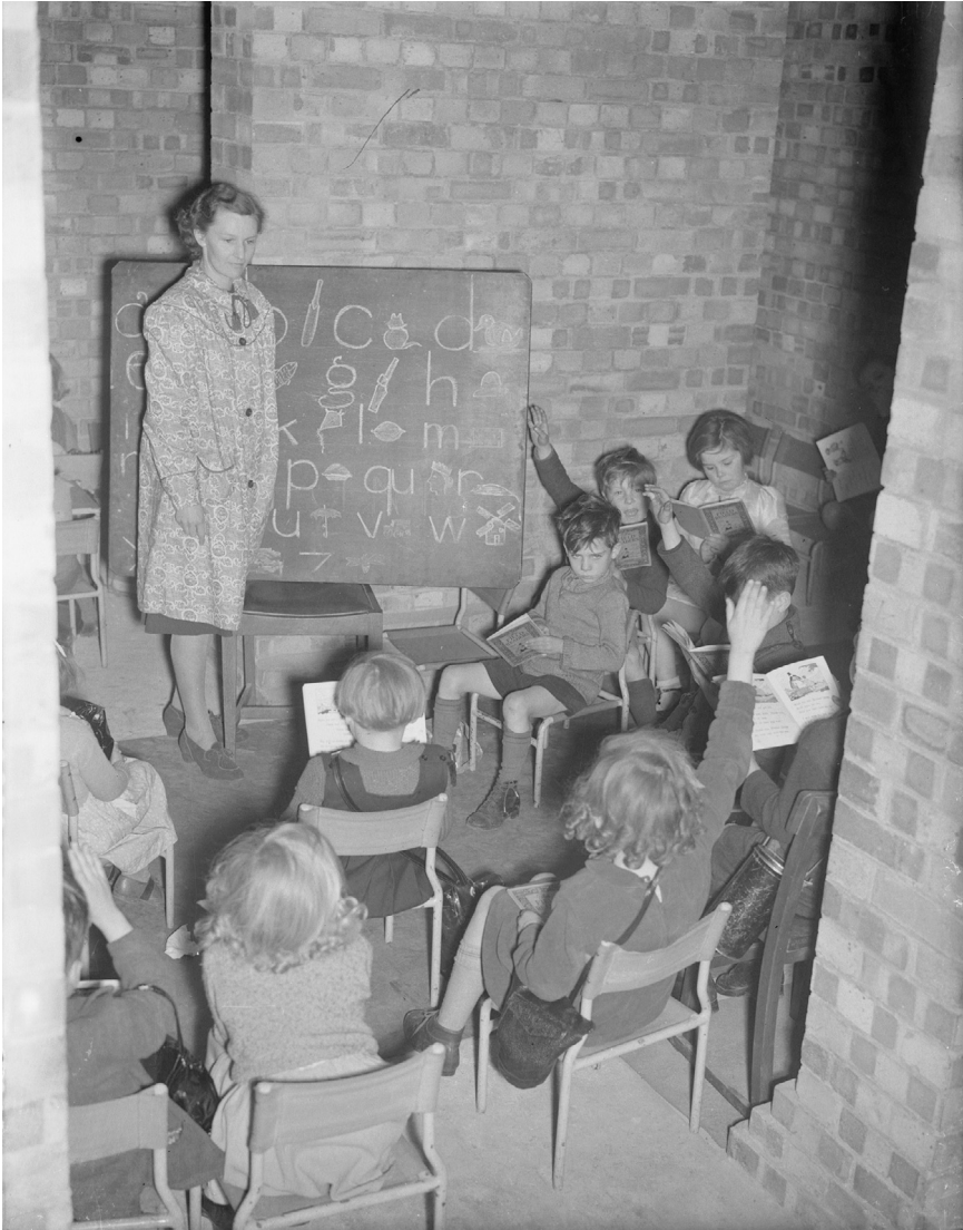
Figure 3.2 Lessons continue in the basement air raid shelter at Greek Road School, South East London. Several of the children are carrying their gas mask cases. © Imperial War Museum, D 3161.

Hanging over these restrictions was the memory of the bombing of Upper North Street School in Poplar in the First World War, when a 50kg bomb killed 18 young children and injured dozens more. School shelters, like the majority of public shelters, were designed to hold up to 50 people: the size restriction was an arbitrary one designed to limit mass-casualties in a direct