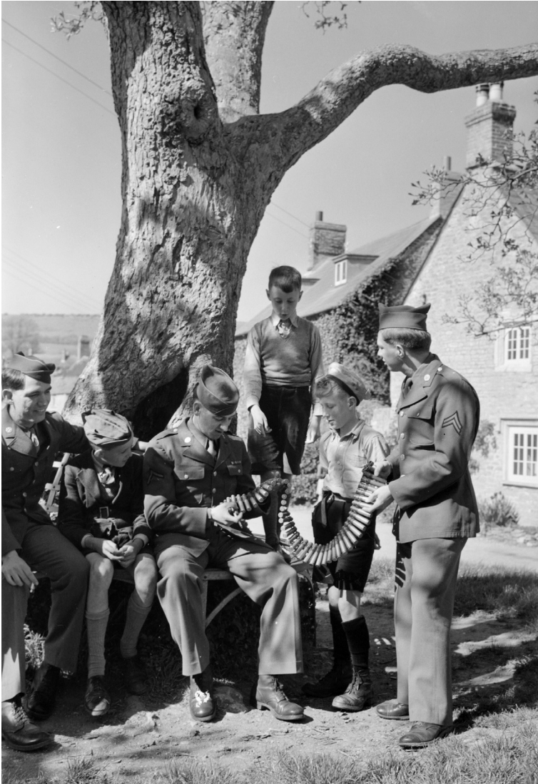
Figure 2.2 Children in Burton Bradstock, Dorset show American servicemen a machine gun belt that they had found on the local beach. It appears to be .50 BMG cases with M2 links.

cadet troops as fundraising events for the war effort. Some were more informal but born of the same patriotic enthusiasm: