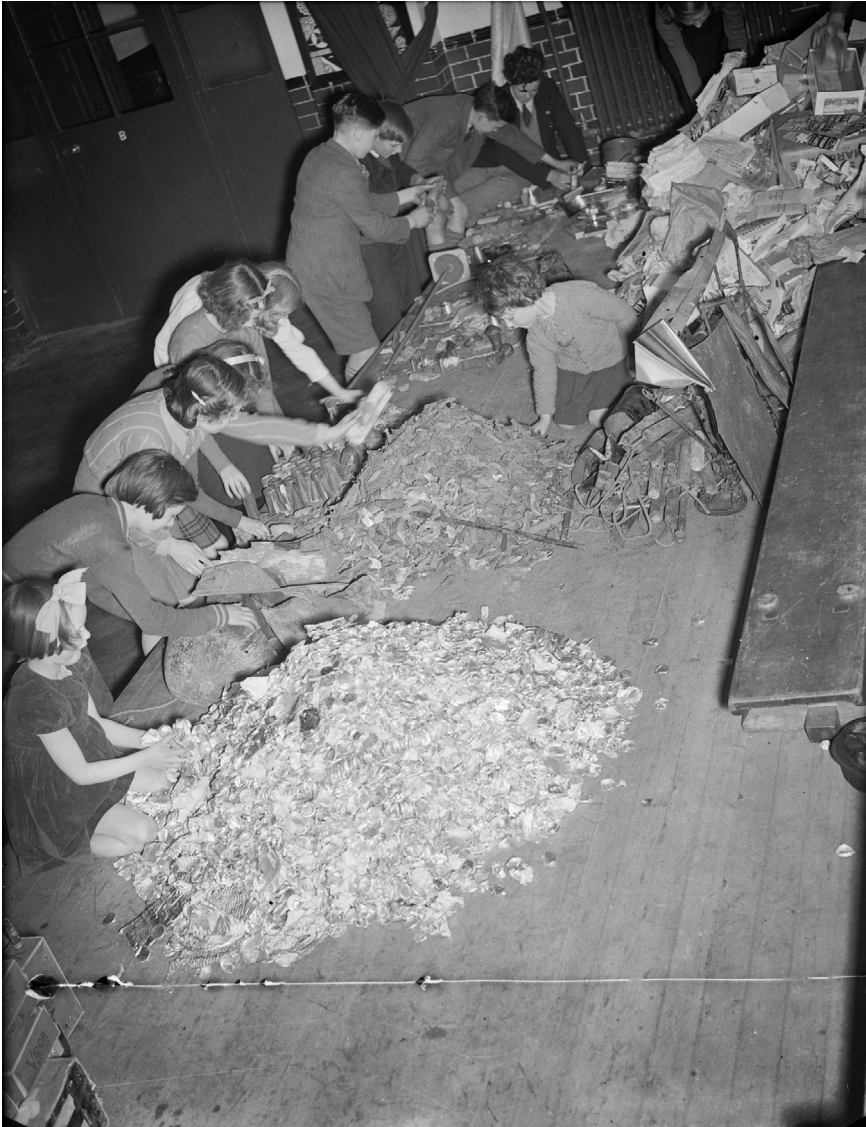
Figure 2.3 Pupils at Ancona Road School in South East London sort salvaged metal for recycling. Alongside milk bottle tops and sash window weights there is a heap of shrapnel fragments and a cluster of incendiary bomb tail fins.

polishing and/or mounting the fragments, or turning them into trinkets of various kinds: 'I spotted a piece of shrapnel which turned out to be the nose cap of the shell. This I have kept ever since, highly polished, and have recently put it