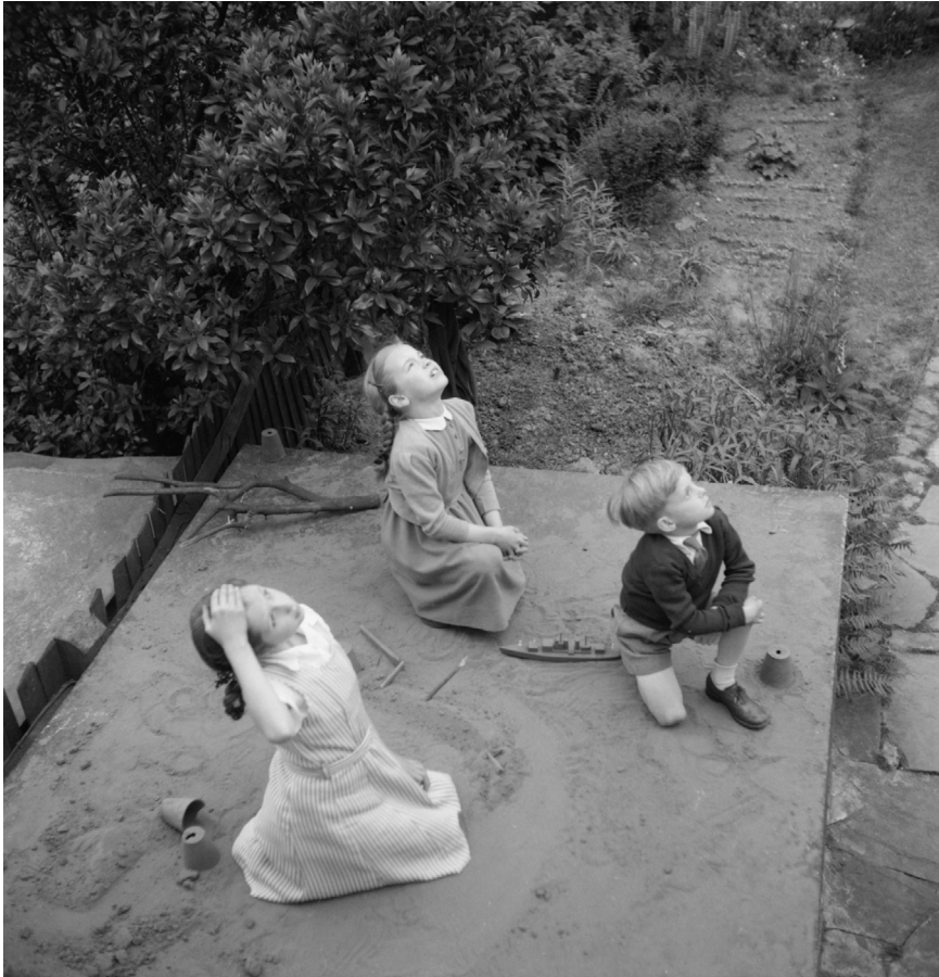
Figure 5.1 Children playing in a layer of sand on the roof of their air raid shelter stop to watch aircraft pass overhead. © Imperial War Museum, D 20623.

industry of wooden models, kits, plans, accessories, magazines and books supported by a number of model shops nationwide. As with aircraft recognition, there is also a suggestion that government support was provided to encourage a hobby seen as being good for morale, encouraging airmindedness and generally supporting the war effort. Aero-modelling was not just a solitary activity: children engaged their models in mock air battles, clubs were formed for flying models in particular, and in some places public exhibitions of models were held as fundraisers for the war effort. Some models even incorporated materials from crashed aircraft in their construction, suggesting an almost magical connection between the real and the simulacrum.