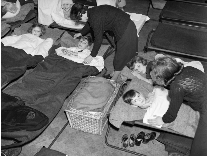
Figure 3.3 Children being put to bed in the air raid shelter of John Keble Church, Mill Hill.

were babies crying and children running around, and coughing, and snoring, it was a wonder people slept at all' (Cole 2005). At the excavation of a school air raid shelter one of the former students I interviewed told me that although metal buckets were provided in separate compartments for use as toilets, no child was willing to use it as the noise echoed in the shelter leading to great embarrassment and ridicule: accordingly, he and many other children emerged from the shelter, particularly after long warning periods, in extreme discomfort but stubbornly unwilling to be heard urinating so loudly.