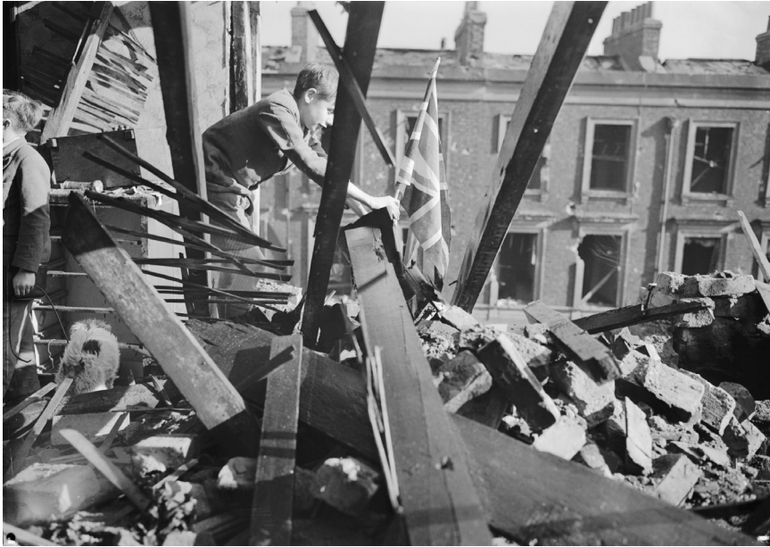
Figure 4.2 A child plants a Union Flag in the wreckage of his home, destroyed in an air raid on London.

had a peculiar effect, as if a giant hand had scooped out the roof timbers and tiles leaving the dividing walls in the loft space between each house. Bomb blast did strange things, a building could have severe damage but sometimes fragile articles like mirrors or vases remained intact and standing on mantelpieces whilst devastation was all around.