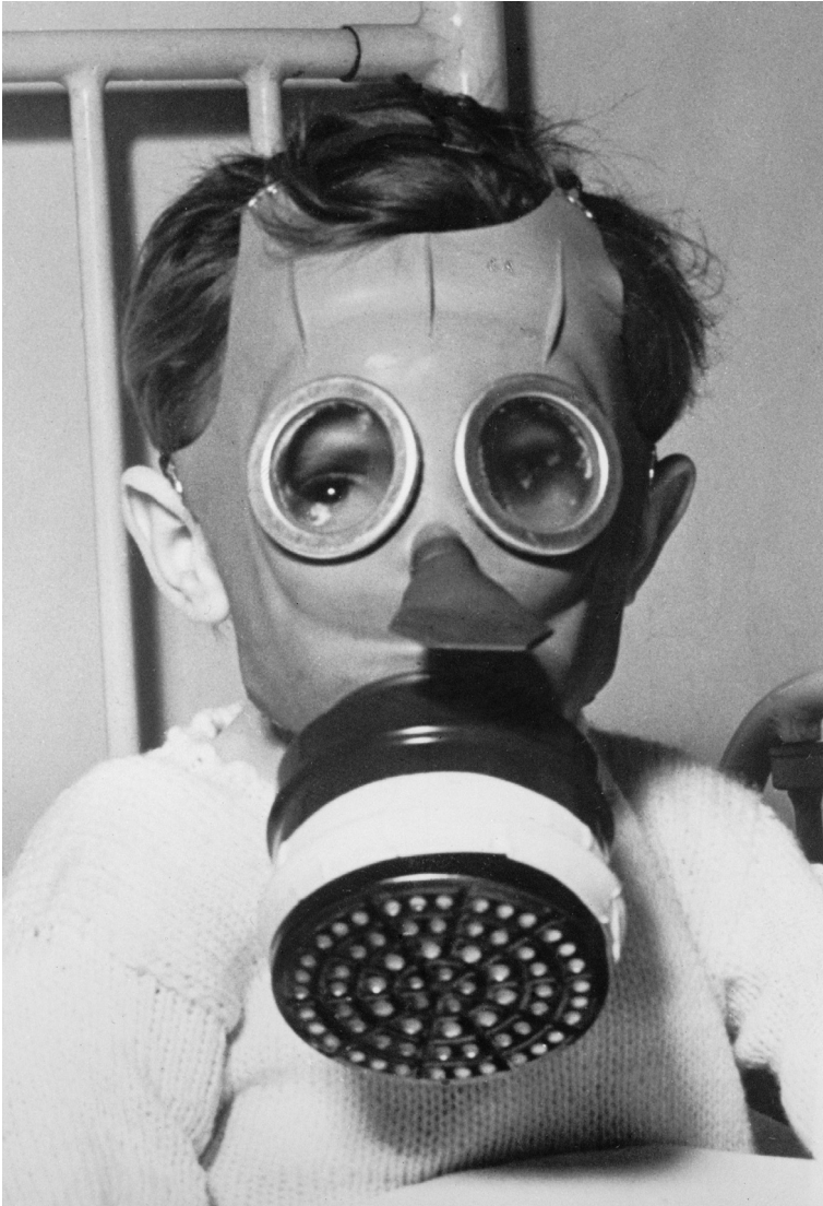
Figure 1.1 Child modelling the brightly coloured ‘Mickey Mouse’ gas mask.

symbol of air pollution, urban decay and innocence (Banksy 2006). What makes the image of the gas mask so popular and widespread?