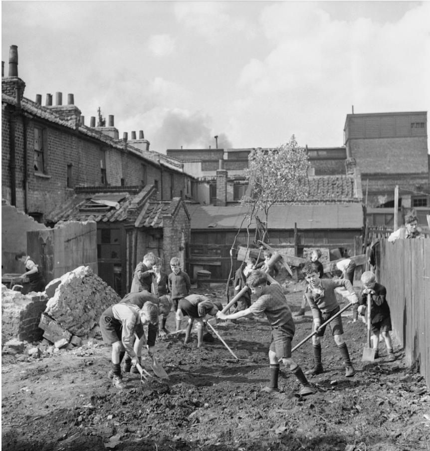
Figure 4.1 Children working on a makeshift allotment on a London bomb site.