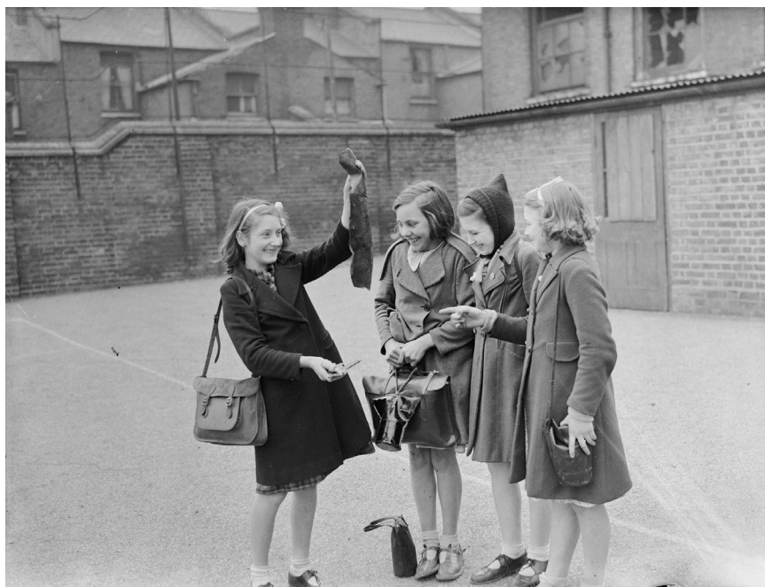
Figure 2.1 Pupils at Calvert Road School, South East London, admiring a fragment of metal collected after an air raid. Note gas mask cases.

During my interviews with children of the Blitz, the significance of shrapnel collecting was highlighted by a number of intriguing factors and recurring themes: the roughly even numbers of men and women who remembered collecting shrapnel; the apparent near-universality of the practice and the vividness with which interviewees could remember individual items in their collections. Shrapnel collecting was evidently an important part of a wartime childhood, and