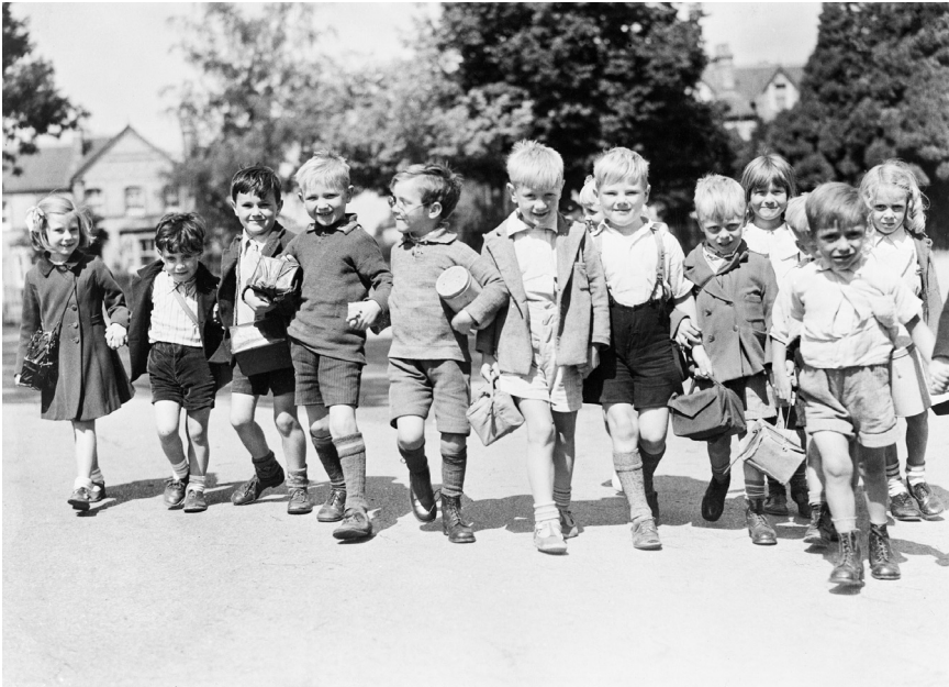
Figure 1.2 A group of young evacuees in Reading carrying their gas masks. A variety of cases, boxes and covers can be seen.

For some children the only way they could afford to improve their gas mask cases was to have a parent sew a fabric or leather cover and shoulder strap: ‘You could get a leatherette cover for the box to make it more waterproof and