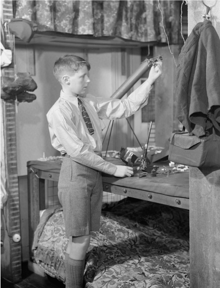
Figure 5.2 In this photograph, originally intended to advertise the shirt and shorts, a 12-year-old boy stands next to his Morrison air raid shelter and plays with a 1/72 scale model of a Westland Lysander aircraft. Behind him on top of the shelter sit models of an anti-aircraft gun and a searchlight, while a gas mask hangs to the right. © Imperial War Museum, D 13081.