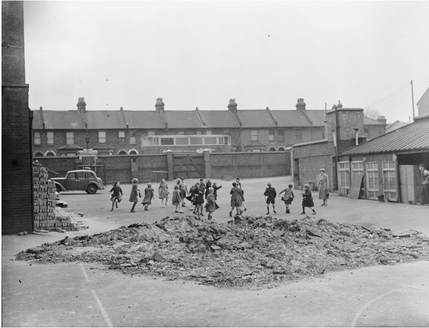
Figure 4.3 Children playing next to a bomb crater full of rubble in the playground of Lombard Wall School, South East London. © Imperial War Museum, D 3170.

new ruins are for a time stark and bare, vegetationless and creatureless; blackened and torn, they smell of fire and mortality. It will not be for long. Very soon trees will be thrusting through the empty window sockets, the rose-bay and fennel blossoming within the broken walls, the brambles tangling outside them.