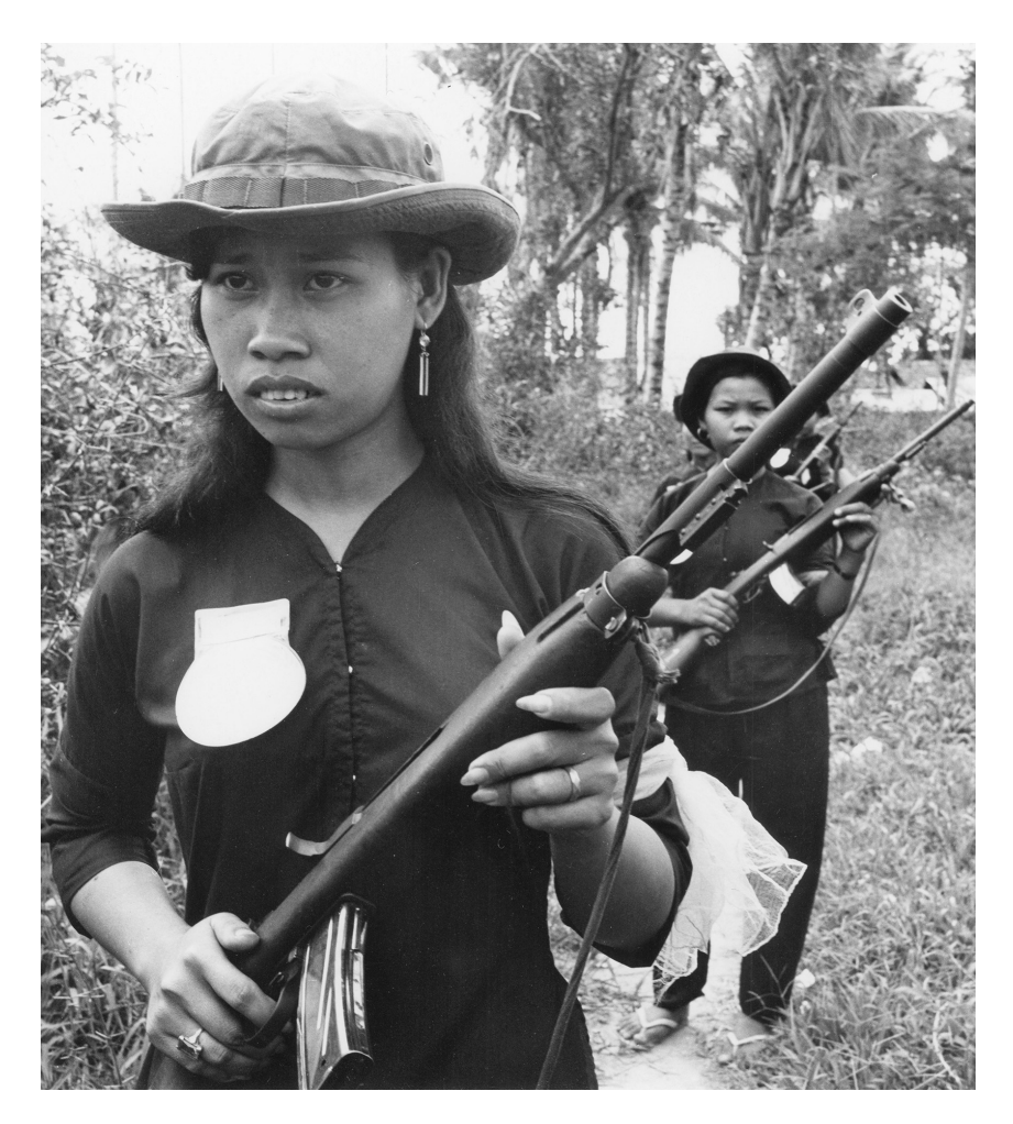
FIGURE 9. Female "volunteers" of the People's Self-Defense Forces patrol Kien Dien, a hamlet fifty kilometers from Saigon. Some PSDF participation was more voluntary than others.