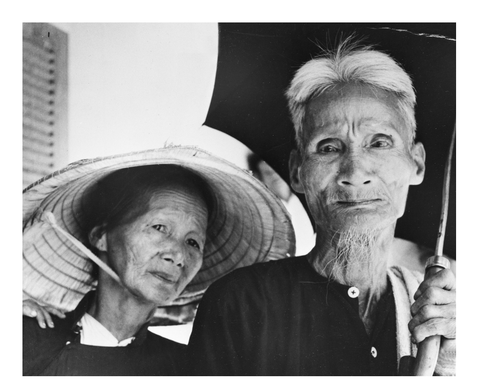
FIGURE 6. Vietnamese refugees in northern South Vietnam, 1965. According to the U.S. Marine Corps photographer, "the wages of many years of war are reflected in the faces of this aged Vietnamese couple."

Project Recovery's immediate focus was to provide for the vast numbers of evacuees created during Tet and the subsequent offensives. A CORDS report later noted that enemy offensives between Tet and August "generated over a million cases of people who, while they did not have to leave their homes for more than a few days, required assistance in reestablishing themselves after the death of relatives and/or the destruction of their homes." Unlike rural refugees, the urban refugees generated during Tet usually moved only very short distances from their homes and maintained access to their livelihoods once normal economic life was restored in the cities. But many saw their homes destroyed in heavy fighting and needed to be rehoused. There was also a fear among Americans in Saigon that food shortages might quickly lead to riots, which the Communists could then misrepresent as the general uprising they had predicted.