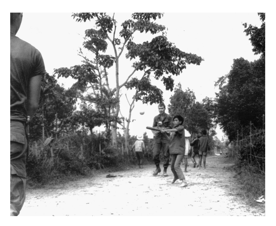
FIGURE 1. Members of the 101st Airborne Division join children in a game of baseball north of Hue during pacification operations, 1970. Such short-term goodwill rarely translated into long-term support for the GVN.