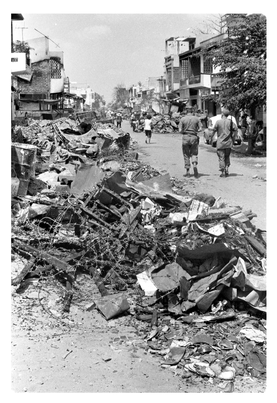
FIGURE 5. Devastation in Saigon in February 1968.