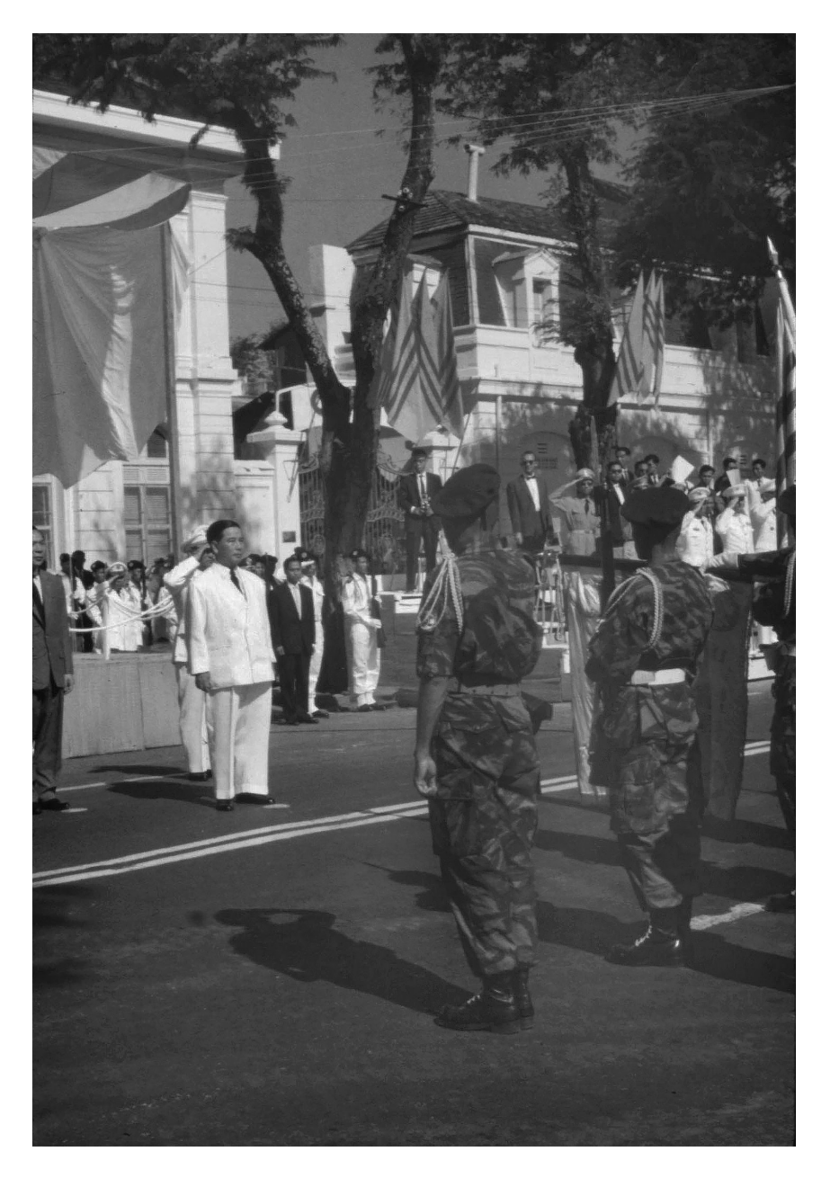
FIGURE 2. President Diem receives a loyalty oath from personnel of the Vietnamese Air Force, 1962. Diem's regime relied heavily on police and security forces to impose control over the countryside.