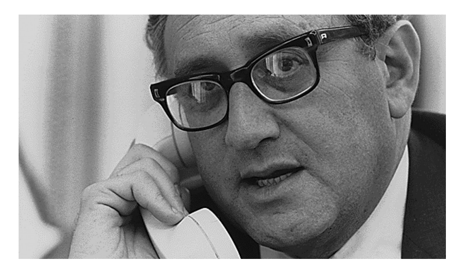
FIGURE 7. National Security Adviser Henry Kissinger set up a sophisticated system in the White House to monitor the progress of nation building in South Vietnam.