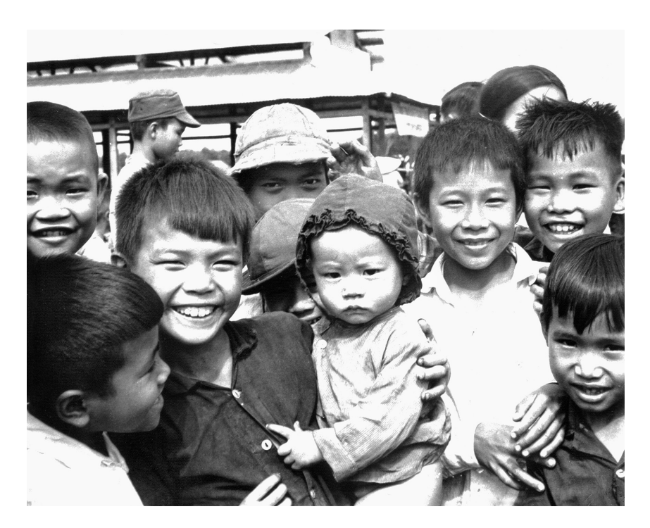
FIGURE 3: Children gather at a market built with the help of USAID. Villagers might appreciate such projects, but they delivered few long-term political benefits to the GVN.

province chiefs were field-grade ARVN officers who were unlikely to change their behavior or views simply because an enthusiastic young American came into their orbit. Even when USOM representatives were successful in prodding GVN officials to carry out limited economic development projects, their involvement was unlikely to change the basic structure of relations between the GVN and the peasantry. Nor were the Tigers in a particularly good position to assess the impact of their own efforts. Although some of them stayed in one province for years and came to know it well, in general they were recruited and dispatched without any specialized knowledge of South Vietnamese history, governance, or politics. As we shall see when we turn to consider the experiences of CORDS advisers in subsequent chapters, this severely handicapped their ability to make a meaningful contribution to nation building. And like their counterparts in the CIA, what exactly the USOM representatives could accomplish was ultimately determined by the province chief to whom they were accredited.