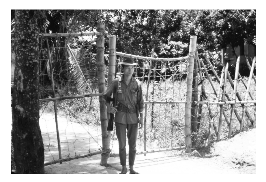
FIGURE 10: A Popular Forces militia member stands guard at the village gate in 1968. Such flimsy defenses were easy for the NLF to infiltrate.