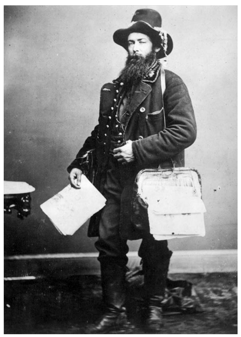
FIG. 8.2. Newspaperman, ca. 1860s.

worked independently, but others attached themselves to regiments and secured passes to ride free on railroads and steamers.