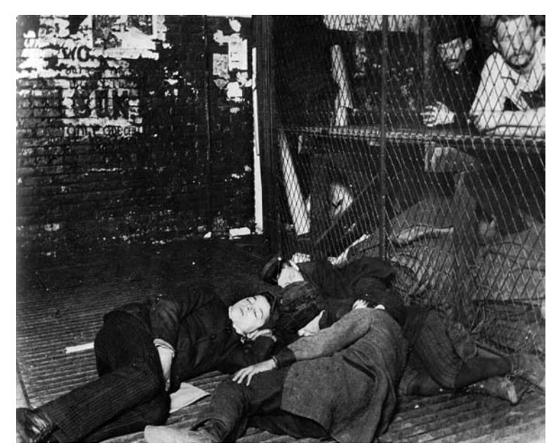
FIG. 8.4. Jacob Riis, "Three A.M in the Sun Office," ca. 1889. New York Public Library

a cage at the p hotographer. He, not the newsboys, was the unusual sight (fig. 8.4).