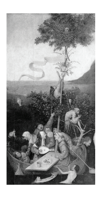
Fig. 1. Hieronymus Bosch, Ship of Fools (1490–1500)

If you're reading the e-book, you can click on the image below to go directly to our donations site. Any amount, no matter the size, is appreciated and will help us to keep our ship of fools afloat. Contributions from dedicated readers will also help us to keep our commons open and to cultivate new work that can't find a welcoming port elsewhere. Our adventure is not possible without your support. Vive la open-access.