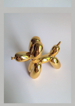
An Unspecific Dog Artifacts of This Late Stage in History