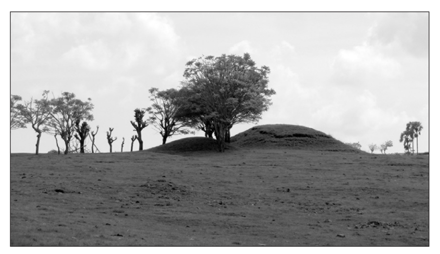
Hanga Loko Pedae, Mab'ba (Seba): Massacre site.

[They were taken] by foot from the Seba hospital... Towards the police barracks, and then... they turned... towards East Sabu to the square, and then to Hanga Loko Pedae [meaning The Dry Riverbed that is always talked about] to the edge of the Terdamu airstrip. I remember that name Hanga Loko Pedae to this day. It took about an hour to get there. There were people accompanying them and crowds of people following behind. When we got to the location, there were also crowds of people already waiting there.