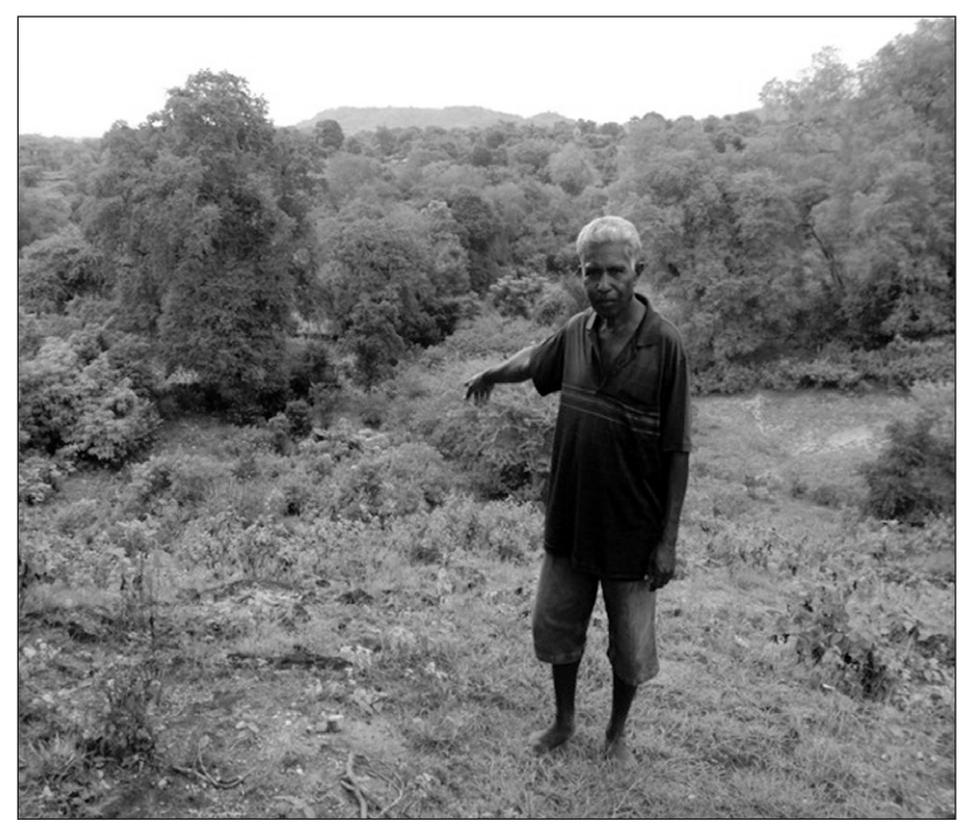
One of the execution sites in Kolbebe, village of Bena, subdistrict of South Amanuban.

congregations after 1965 happened in a natural way, namely through birth and marriage. ^{\rm 35}