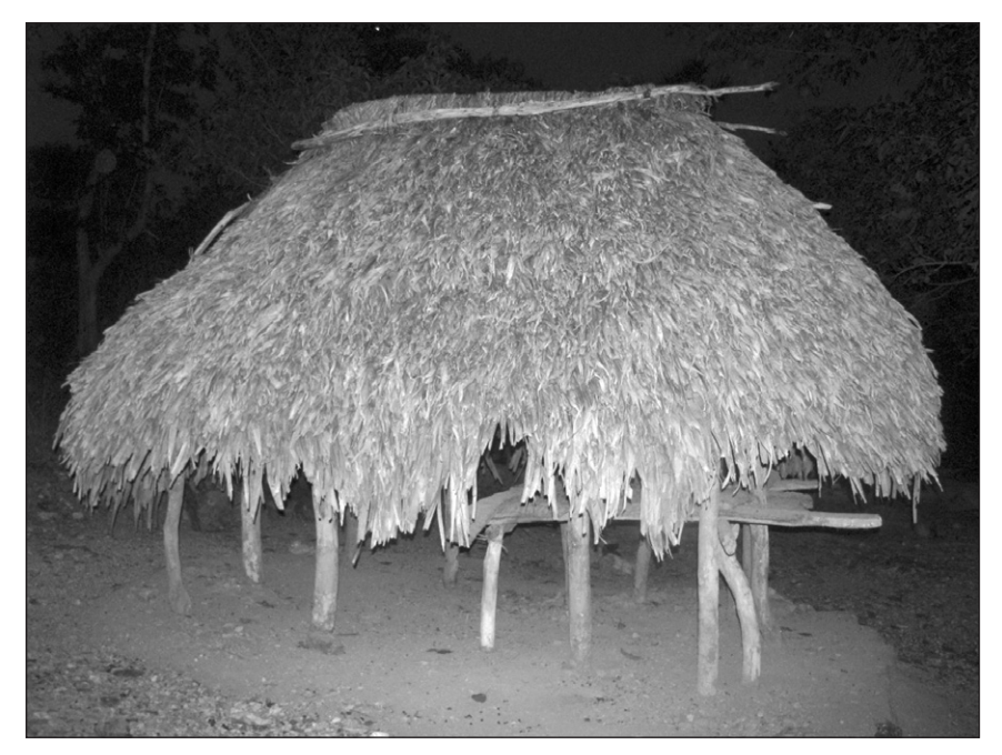
Tegid'a, the women's house in a customary village. As a result of the events of 1965, the cutomary groups in Sabu suffered intimidation, accused of being atheist.

The customary communities were intimidated by being accused of being atheists and communists. Prominent church figures who debated with leaders of customary law tried to cleanse anything considered to be idolatrous and atheistic by belittling and stigmatising people; by burning traditional altars and items used for rituals, including works of art like woven cloth and jewellery; abandoning ceremonial houses, and felling trees at water springs. These were all difficult things for customary communities to accept and they asked: Why are we being attacked? The author herself (Paoina) experienced how her grandfather, her mother's father, almost died one night after drinking poison because he was so disturbed after being accused of being an atheist at a thanksgiving ceremony. Many people in these communities wept to see the treasured work of their ancestors burnt as a sign that they were now Christian.