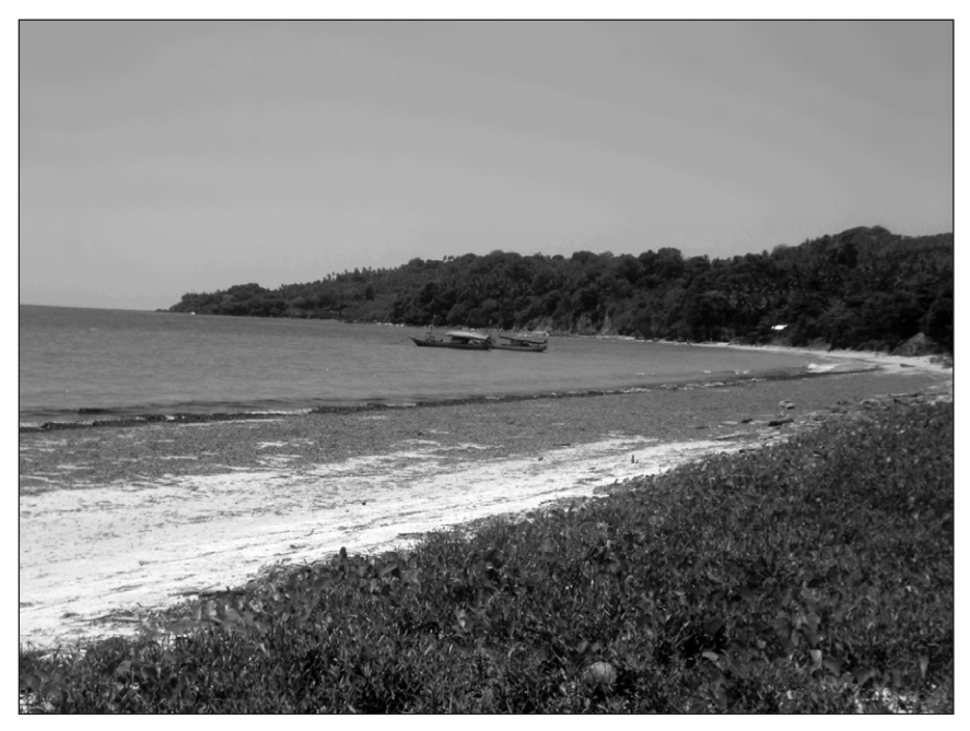
Rua Beach, West Sumba: Massacre site.

About 100m to the right of the jetty at Rua Beach is the site of a massacre that took place in the second wave of killings in West Sumba in September 1966. The victims (13 males) were blindfolded with black cloth, and their hands were tied behind them. They were made to stand facing the sea, and shot in the back. After a check to make sure they were dead, their bodies were put into sacks with large rocks, then taken by boat and thrown into the sea. Rua Beach is the beach closest to the city of Waikabubak, around 20 kilometres to the south. It takes about 30 minutes to get there by car.