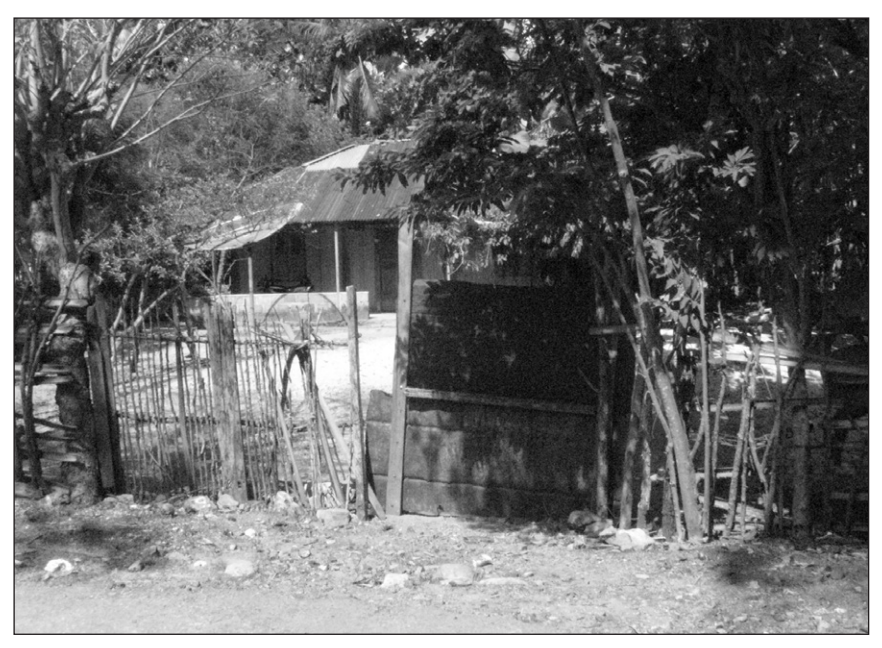
On the night of the first massacre of 29 March 1966, the people were ordered to watch a film about development that was shown in the yard of this house beside the Seba police station.