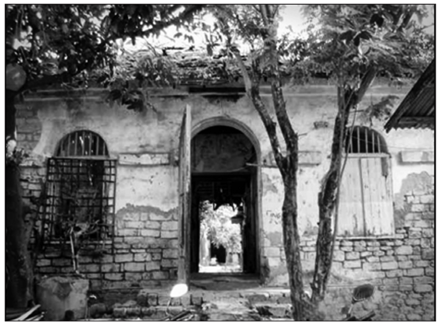
Old prison, Kupang: Male detention centre.

Anyone who defended communists was treated inhumanely and considered to be communist themselves, in other words, they were opposing the government.