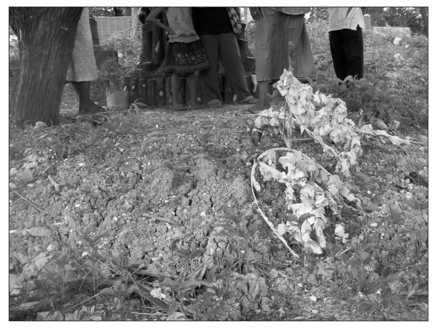
Behind Oesao Market: Execution and mass burial site.

An execution and mass burial site is to be found at Oesao, at the Public Cemetery behind the market. The mass execution of 18 men occurred there on 16 February 1966. Initially, the hole was dug for eleven Gerwani women who were to be executed. However, when they were interrogated, no marks of the sickle [the communist logo] were found on their bodies, and it was discovered that none of them had been formally appointed to the executive committee of the Kupang branch of Gerwani. They were therefore released. The hole was then used for the murder of these 18 men who were suspected of being members of the Communist Party, the majority of whom came from outside Oesao. This execution was the last in East Kupang.