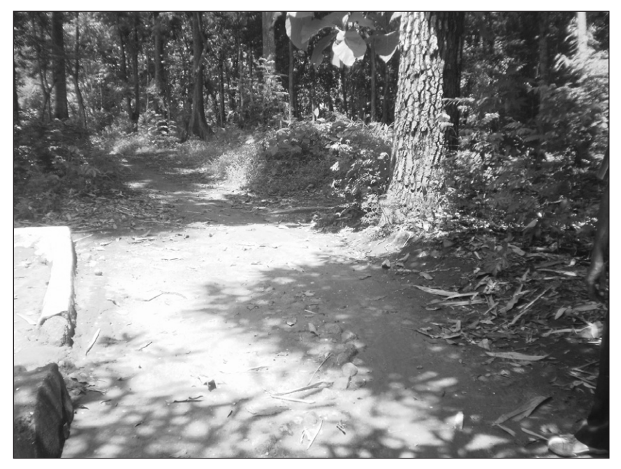
Tanjung Sembilan, sub-district of Teluk Mutiara (in 1965 the sub district name was Alor Barat Laut, or North West Alor): Execution site.

Tanjung Sembilan is located around one kilometre to the west of the centre of the town of Kalabahi. Its name reflects the shape of the Cape – tanjung is cape, and sembilan is nine – for the Cape is shaped like the number nine. Here, nine men were killed in the jungle late one night in March 1966. A hole was dug and after the men were executed, the bodies were thrown into the hole, and the hole covered up. All signs of the execution at Tanjung Sembilan disappeared. Today, people are living at this location, but the forest is still there.