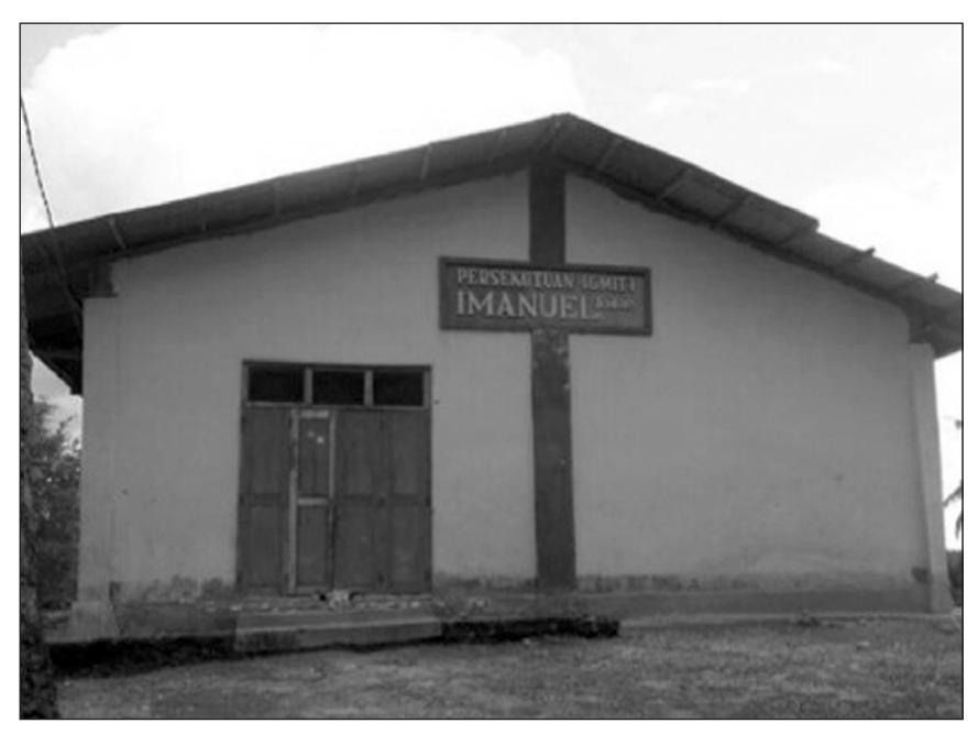
During the 1965 incident, the church found it difficult to protect its members and others. One example in South Central Timor is the Imanuel Congregation worship hall in the village of Kombaki, subdsitrict of Polen, which was used as one of the places of torture.

In the middle of the food shortage, famine, and the Revival Movement, the 1965 incident occurred, which had a huge impact on life in South Central Timor, including on Christianity and customary communities. Studying this helps us to understand the stories presented above from some women who were victims of the 1965 incident.