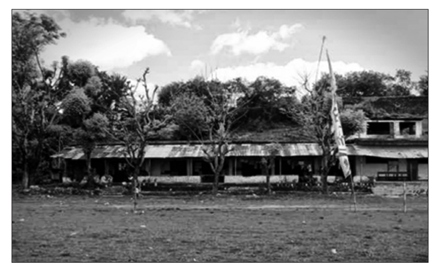
Merdeka Stadium (Freedom Stadium), Kupang City. Female detention centre.

Merdeka Stadium (Freedom Stadium), in the area of Oeba, Kupang, is a sports stadium. At the time of the 1965 Incident, it was used as a detention centre for female political prisoners. Some of the women we interviewed were detained there. According to informants, two to four people were housed per room, each with their own bed. The women were detained here for periods ranging from one week to a month.