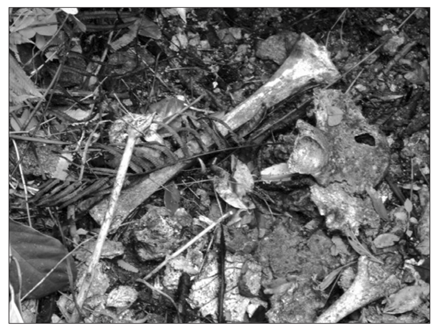
Naismetan Forest, sub-district of Mollo Tengah: Massacre site.

According to some informants, victims from various places in South Central Timor were brought to this forest to be executed, about 20 kilometres to the north of SoE. There are about 16 graves in the forest, and each grave has more than one body buried there. The victims dug the holes themselves, and they are so shallow that when the research team went there for documentation, one could clearly see skulls and other bones. The forest is still covered with thick undergrowth. The people living nearby are afraid to plant anything in the forest, or even enter it or the immediate surroundings.