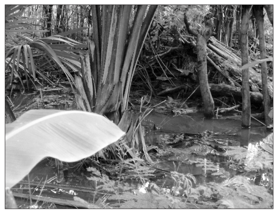
This is one of at least seven known graves for 1965 massacre victims in Tanah Putih, East Kupang.

to stand facing it, then they were shot by soldiers, police, or civil personnel who had been designated this task. If someone was shot and did not die, their throats would be cut with a machete, or they would be buried alive.<sup>21</sup>