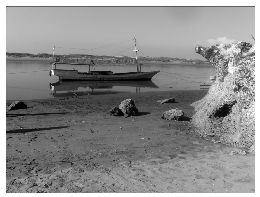
Seven people are known to have been killed on Mananga Beach, Mamboro, on 5 May 1966.

They were taken by truck from the Waikabubak prison in the late afternoon to Mananga Beach at Mamboro, about 60 kilometres to the north. The killing was done at dawn and witnessed by many of the locals at Mamboro as well as village officials, from village to district level. According to Umbu Dangu, there was a government instruction ordering everyone to be present at the execution, which was carried out by the police and the army. The prisoners were blindfolded from the time the left the prison in Waikabubak, with black bands, and their arms were tied behind them. They were accompanied by their executioners led by the East Sumba regional military command (Dandim) from Waingapu (at that time, West Sumba had only the lower level military garrison called Puterpra).