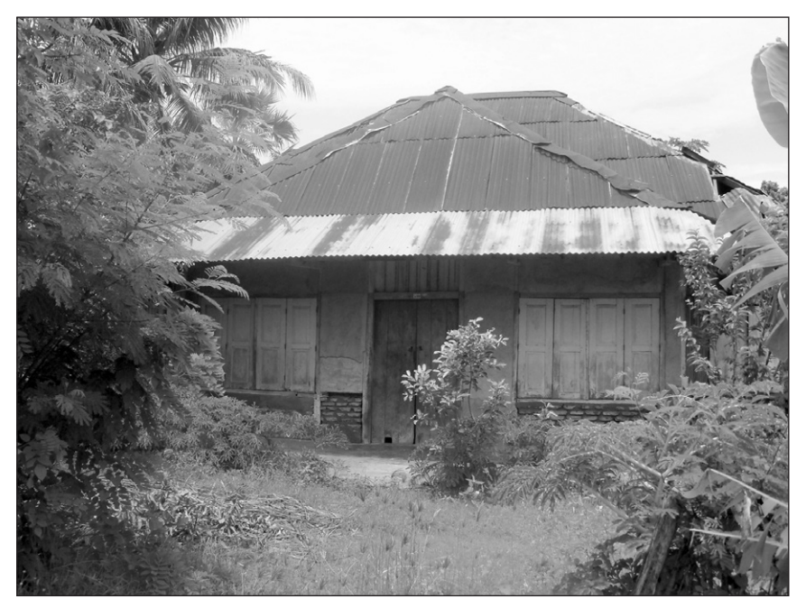
The old East Kupang Sub District Head's office, where Nona Asmi was interrogated.