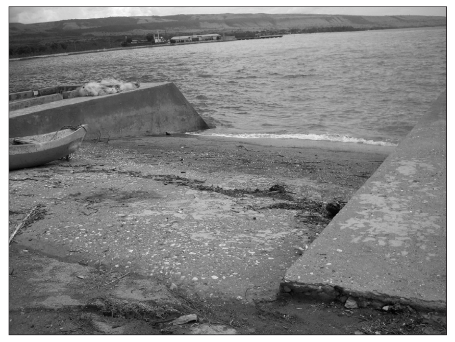
The old wharf. One of the execution sites in East Sumba.