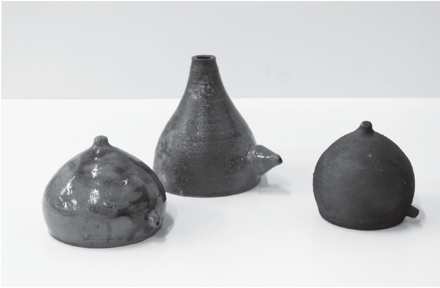
Figure 7.3 Diachronic evolution of a breastmilk pump piece ( pezoeira ).