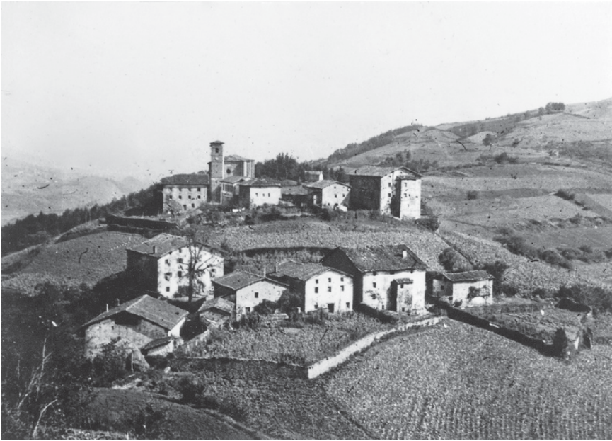
Figure 6.1 The village of Alkiza, 1945.

town hall, were sold to young families from San Sebastián within a short time. Also, two old buildings, located near the plaza, were bought, restored, and are now homes for couples with children. The rest of the houses were not built by a profit-seeking intermediary but by locals. These were villagers who would not inherit or had rejected their inheritance; they built on the family's farmland, so living near their aged parents, who were still tending the farm. Some features of these houses, such as size and style, as well as the fact that their inhabitants were employed in activities other than farming, make farmers identify them as kaletxeak , 'city housing'. But people from out of town who do not share the farmhouse culture usually describe the houses as chalets, or villas. The houses stand on an ambiguous space in the local map: the proximity of the family farmhouse, the fact that the inhabitants participate regularly in farming work, that they keep vegetable gardens, fruit orchards or crops for cattle feed in the same land make them not, in the strict sense of the word, kaletxeak or chalets. It is interesting that neighbours use the term etxea , house, to refer to one of these buildings. However, they always use baserria to refer to the farmhouse, and chalet or villa to refer to the houses built by real estate agents or construction companies to make a profit.