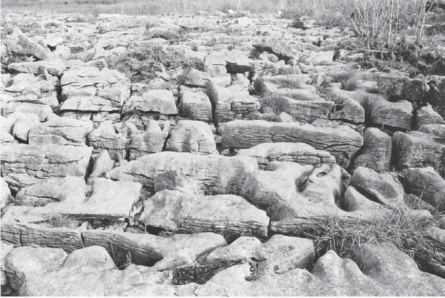
Figure 8.1 The Burren: karst limestone.

Be that as it may, many locals displayed great kindness to these newcomers in their midst. Many blows, when asked about their relations with their neighbours, will spontaneously and very happily list the unpaid labour that locals gave them to help rebuild their ramshackle houses, the tractors they were loaned, the furniture they were given, the repeated advice about farming that was freely offered, the parcels of food left out for them, the seemingly endless teas they were invited to, and so on. One said she and her partner need never have gone shopping in their first three years if they had accepted all the invitations made to them. Another cried when he recounted to me the thoughtfulness of his local postman: one day, several months after the arrival of he and his partner, the man knocked at their door with a big box of food. The blow suspects the postman knew the pair did not know many people. The following year, his French neighbour was still putting felt on his roof at the time his son was born. When, a few months later, the baby was kept in hospital because of whooping cough and poor home conditions, the postman offered to loan the blow a caravan and a radiator until he had fixed his house.