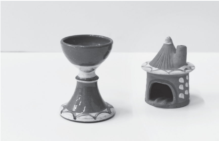
Figure 7.4 Souvenirs sold as traditional pottery.