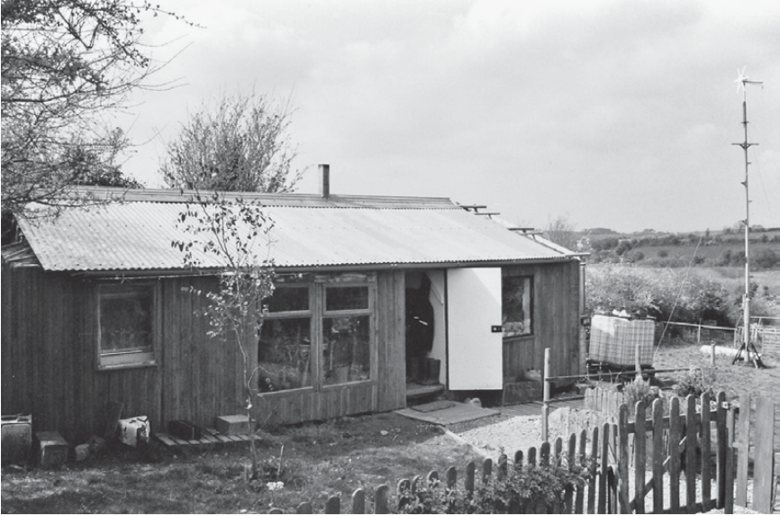
Figure 8.2 This blow-in's house has been built around the original caravan (just visible through the leftmost window).

cottaging business, giving the otherwise unconnected access to the Net. Teachers and parents of pupils at the school also revived or revitalised seasonal celebrations: in particular, they boast of transforming the town's St Patrick's Day parade into a very popular, lively event.