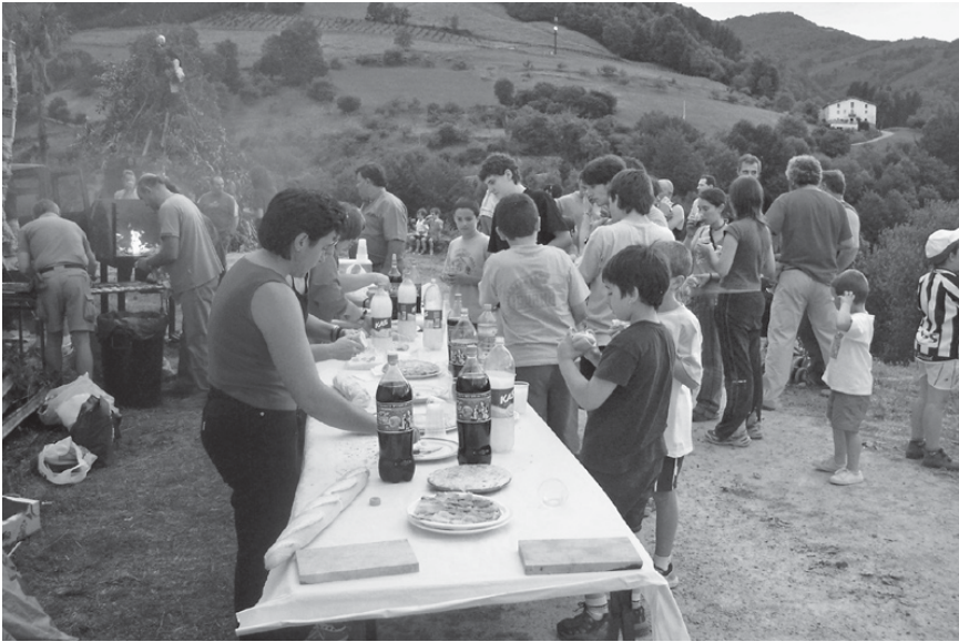
Figure 6.3 The festivity of San Juan, Alkiza, 2006.

For the last decades San Juan has been an invented festivity linked to school life in Alkiza. Those who take part display their links to their neighbours and the degree to which they are part of a socially constructed space. However, in contrast with the role it played in the 1980s and before, in the late 1990s the school did not act as a space of cultural and social integration for newcomers. Rather, it became an institution immersed in controversy, and the source of social division among residents. It happened that some people started questioning whether a rural school really possessed the educational requirements to prepare children to continue their education in an urban centre and among urban teenagers. In addition, in the early 2000s, a violent incident between young children led two local families to withdraw their children from the school. As a result, members of the gurasoen elkartea can see that withdrawing their children from this very small school is a threat to its very existence. They also believe that taking children out of school is a disloyalty to the community spirit which should surround the local school.