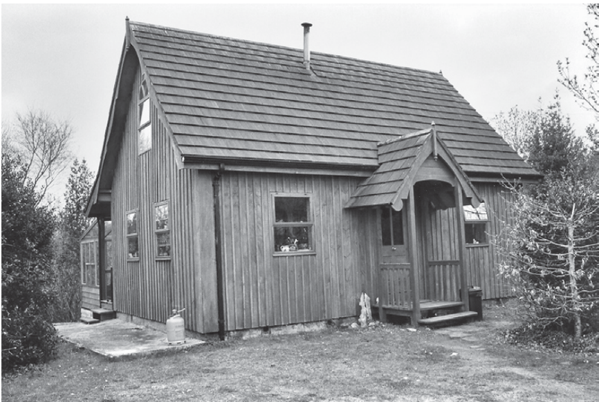
Figure 1.2 Locals thought this blow-in carpenter ‘mad’ to construct a wooden house in such a gale-swept area as County Clare, west Ireland. More than a decade later, the house still stood, in good shape.