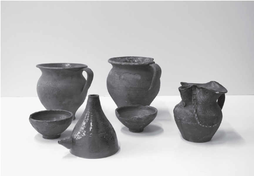
Figure 7.1 Pieces made before 1960, and a modern reproduction of an original shape (the breastmilk pump piece).

temperature, for at least two hours, during which the pieces turned reddish. From then on, the pace of firing decreased slowly, until the oven's heat was finally extinguished and the pots left to rest. This phase of production has been the one most subject to innovation: today potters use electric hermetic ovens with external temperature controls. Also, in order to apply the modern glazes, the firing has to proceed through two interrupted temporal sequences; something completely new compared to the ceramics made up until the 1960s.