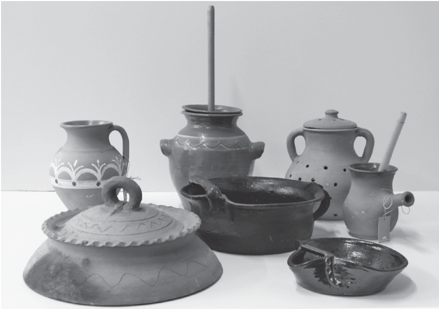
Figure 7.2 Pieces of traditional pottery made in the twenty-first century in Galicia.

and jobs for rural areas to replace the unviable primary-based economy. Of course, the limited economic scope of this measure, insufficient itself to replace the totality of the previous economic system, can be considered in some sense as the institutional Trojan horse, which comes accompanied by a series of parallel interventions of an ideological character. 2