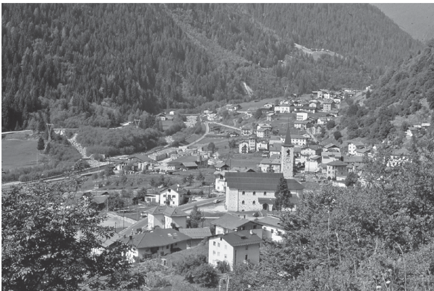
Figure 2.2 Caoria in 1992: the forest is encroaching on the village.