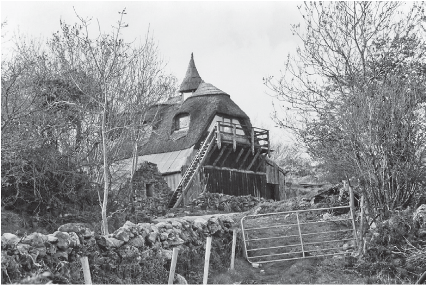
Figure 1.1 Fairy-tale turreted house, for a blow-in cheesemaker, County Clare, west Ireland.