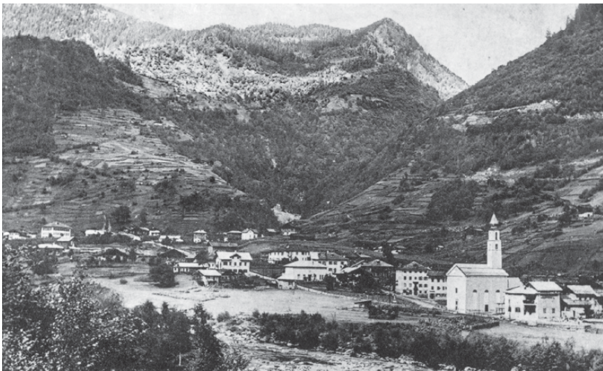
Figure 2.1 The 'cultural landscape' of the village of Caoria and its surroundings in the 1930s.