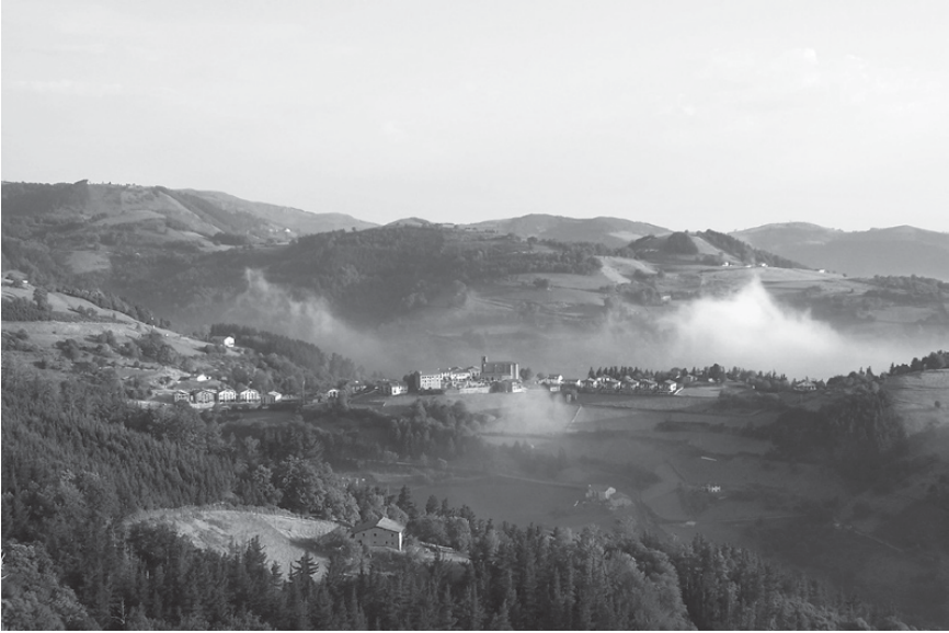
Figure 6.2 Alkiza, 2006.

the plaza. 6 One cause was the rise of ‘officially protected housing’ promoted by the Basque government in line with an EU objective for rural development: to stop the gradual emigration from villages by giving locals incentives to remain in their hometowns. To that end, the Basque government, together with the rural municipalities, designed an intervention plan whose goal was to create affordable housing for locals. Alkiza participated successfully in this scheme: in 1998, two new buildings with a total of eight flats were finished; seven years later, sixteen flats in four recently completed buildings were allocated to young locals.