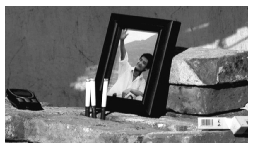
Figure 1.3. The makeshift shrine Han Sanming makes for Xiao Ma Ge. The photo shows the latter imitating Chow Yun-fat in Old Shanghai.

exchange, and seemingly naturalistic acting, the film manages to tell a heartwrenching story about a young man whose life is lost in a senseless way. From visual clues one can infer how he meets his end—he is recruited (seemingly by Shen Hong's estranged husband, Guo Bin), with 50 RMB as his payment, to take part in a gang fight. He must have been killed during the fight and is subsequently buried under the pile of bricks where Han Sanming's character finds him. Seemingly quietly—with the violence symbolized by the pile of bricks in the midst of a demolished and about-to-disappear "past"—and almost without a trace, the young man with a fancy for the television drama Old Shanghai and its main character has come and gone. He is young, but his short life seems to have included a mixture of hardships, innocence, small hopes, fanciful moments, and eventual destruction. What do his youth and his life stand for when associated with a place in ruins, about to disappear, and yet nevertheless layered with history? To complicate this question further, let me return to Han Sanming's character, his ring tone, along with other snippets shown in the film about his past, his present, and his uncertain future.