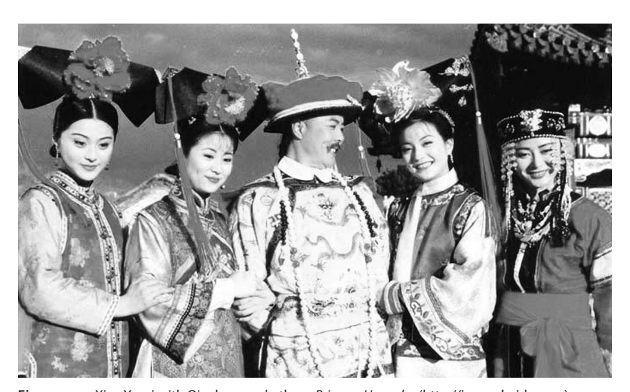
Figure 2.2. Xiao Yanzi with Qianlong and others. Princess Huanzhu (http://image.baidu.com)

Qianlong, a grandson of Kangxi who became the fourth Qing dynasty emperor in history, returns again and again on television as the favorite emperor in playfully told dramas of emperors. Historically, as the Qing emperor with the longest reign (which lasted sixty years, after which he ceded the throne to his son in 1795 before he died in 1799), Qianlong presided over one of the most prosperous periods of the dynasty. But he is also known for his propensity to extravagance and for many controversial decisions, ranging from conducting a literary inquisition (wenzi yu) to promoting and protecting He Shen, a known corrupt official, to refusing Western demands for trade. In the playfully told dramas, however, his stature is significantly softened, and he becomes a loving father, a lustful man with power over any woman he wants, and a sometimes confused emperor who does not know how to distinguish between bad and good. Like many temporarily misguided father figures in typical Hollywood productions, Qianlong the emperor is able to learn lessons along the way and to acknowledge that he was wrong and to express willingness to mend his ways. At the same time, the