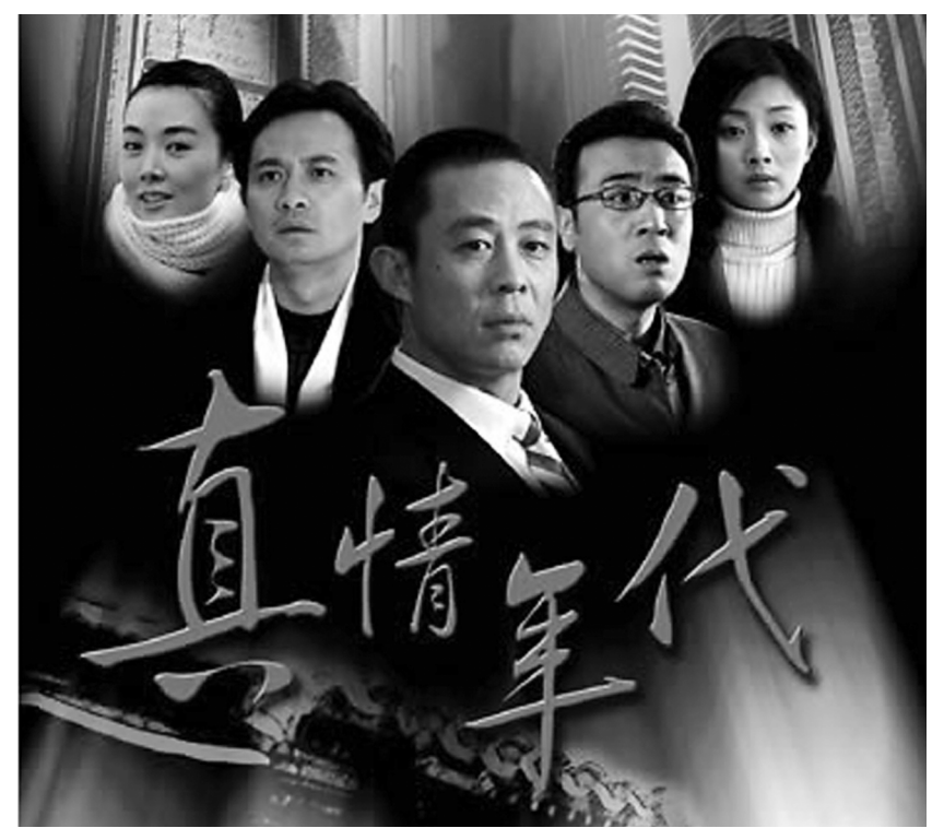
Figure 4.3. The five main characters in Age of True Feelings. Age of True Feelings

and Li Heping, the other two young men who were trapped in the mine with him. Not long after the Cultural Revolution, all of them return to the city, only to have the first fissure occur amongst the four friends when He Ying decides to marry Zhao Penghui instead of Hao Jiefang.