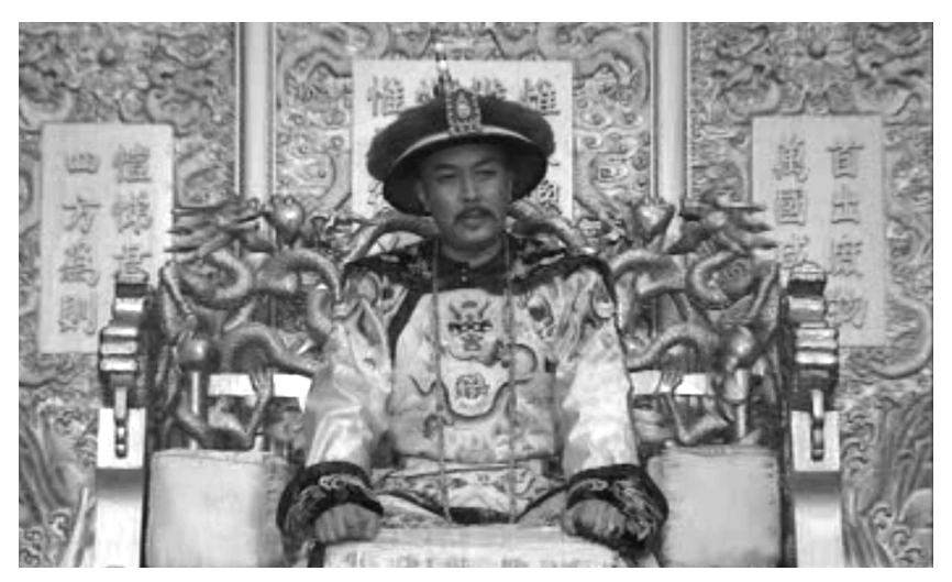
Figure 2.3. Yongzheng takes the throne. The Yongzheng Court (Zhongguo Guoji Dianshi Zonggongsi)

oriented around the choice of the next emperor, the first episode shows Yongzheng as si ah ge , or the fourth son, of Emperor Kangxi, together with the thirteenth (younger) brother, on a mission ordered by the emperor to collect taxes in a province. Instead of placing them in an official mansion or governmental quarters, the drama shows them walking in the street, witnessing the cruel treatment of ordinary people by local officials. When they interfere, because no one knows who they are, they are rudely challenged and disregarded. With this scene setting the tone from the opening, the drama places Yongzheng in a positive light in direct contradiction to the customary belief that Yongzheng was a ruthless ruler. Indeed, how can a hardworking and sympathetic prince who tries to honestly carry out his duties not ultimately manage to win his father's trust and subsequently his throne? Duty and honor are already written into the representation of the young prince.