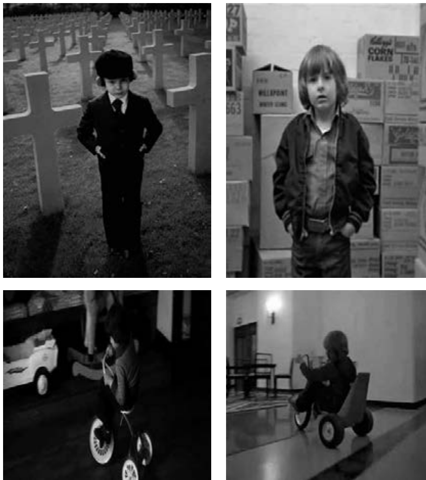
Figure 1. Visual echoes of THE OMEN in THE SHINING : Damien (left) and Danny (right). ( THE OMEN image credit: AF Archive/Alamy Stock Photo Archive).

external to the child, but a doubling of the child himself; Danny's tricycle riding does not result in the murder of either of his parents, but merely depicts his childish means of passing the time within the vast, isolated hotel to which his family have moved. By establishing and then discarding these connections to earlier evil child films, Kubrick emphasizes the manner by which the film delves beyond the shallow tension established between the child as innocent empty vessel and the evil demon that lurks within. In THE OMEN , a priest remarks of Damien 'This is not a human child', thus denying that the frightening or inscrutable qualities of the child character are anything to do with the nature of childhood itself. By contrast, in the opening of THE SHINING , a doctor examines Danny