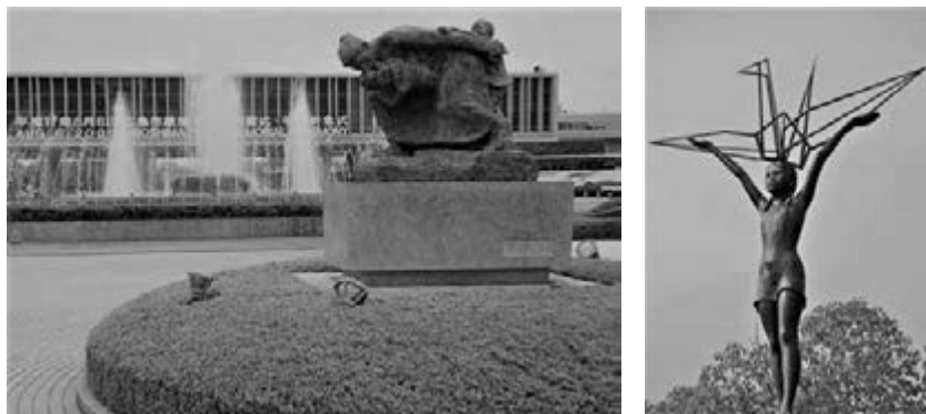
Figure 12. Left: Statue of Mother and Children During the Storm , Hiroshima Peace Park. Bronze, Shin Hongo, 1960; photograph by Fg2. Right: Children's Peace Monument , Hiroshima Peace Park. Bronze and Concrete, Kazuo Kikuchi and Kiyoshi Ikebe, 1958; photograph by Lewan Parker. The child on top of the monument represents Sadako Sasaki holding a large paper crane.

myth of national innocence and victimology' (1999, 38). The child became bound up in such mythology in particularly affective ways. In fact, images of orphaned children and of widows holding their children amongst the ruins of devastated cities became some of the most potent signifiers of Japan's postwar suffering and victimization. 16