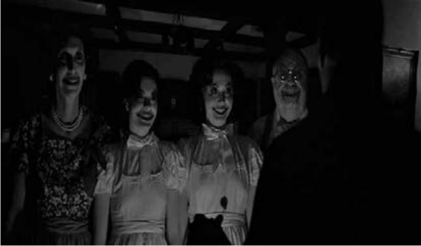
Figure 4. The doll-like 1950s-era family leer at Josh in The Further ( INSIDIOUS ).

Elise has taken his photograph without permission that he strangles her, leaving her face frozen in an expression of fear that aligns her with the immobile postures of the beings in The Further . When Renai enters the room and picks up the camera she is able to see the frightening vision that the photograph revealed to Elise: the ghostly old woman who haunted Josh's childhood has taken over Josh's adult self, as an image of the ghost's visage is superimposed upon his own face. Josh has been consumed by the childhood traumas – signified by the ghost woman – that were previously locked inside his repressed inner child.