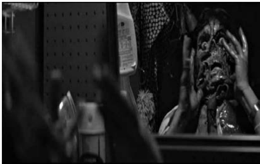
Figure 3. The paranormal investigator is confronted with the collapse of his identity upon looking at his reflection in POLTERGEIST .

upon a gravesite. Subsequently, this vision of suburban domestic bliss is literally sucked into the muddy ground by the aggrieved ghosts first raised by the uncanny child's penetrative perceptual capabilities. 12