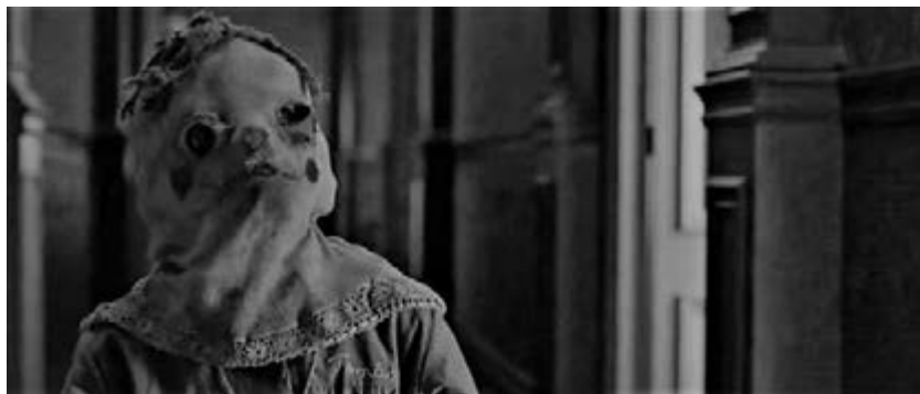
Figure 11. Simón/Tomás simultaneously disturb the boundaries between their singular selfhoods and the past and the present through the adornment of the dead child's mask in THE ORPHANAGE .

indiscernibility by not only dressing in the dead Tomás' clothing, but by deciding to dwell in what he calls Tomás's 'little house' – the cellar in which Tomás spent the majority of his short life, concealed and alone. Thus, the children in THE ORPHANAGE function as the loci for concealed traumas of the past, disallowing teleological narrative progression and preventing the adult protagonist from blindly papering over recent history.