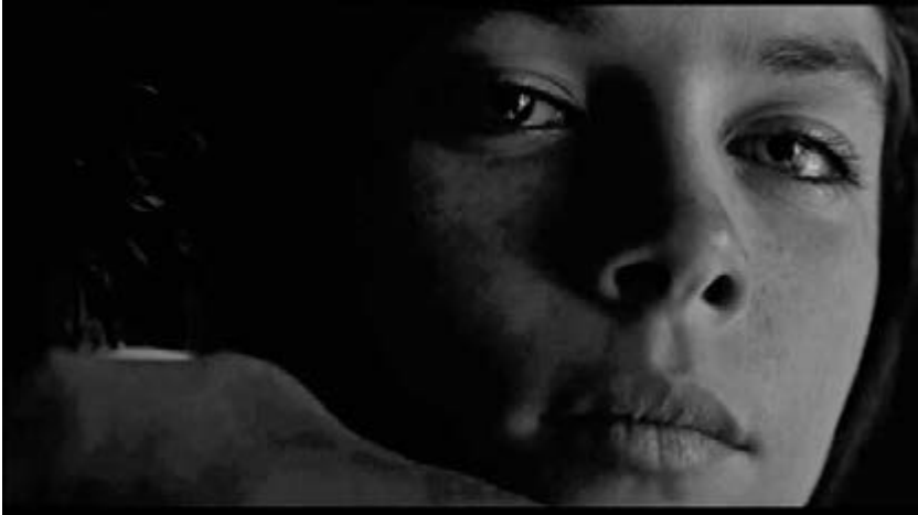
Figure 10. 'Ángela' directs a cold stare at the viewer behind her mother's back in THE NAMELESS .

child seer's inability to establish a sensory-motor link between perception, understanding, and action: 'we no longer know what is imaginary or real, physical or mental, in the situation, not because they are confused, but because [...] there is no longer even a place from which to ask' (1997a, 7). The child in THE NAMELESS forces the adult to inhabit an inescapable position of indiscernibility, as the final scene suggests that Claudia will be forever entombed by the any-space-whatever of traumatic loss.