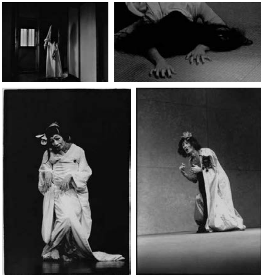
Figure 14. Top from left: RINGU 0 and crawling through the television in RINGU. Bottom: Kazuo Ohno performing Water Lilies (1987); photographs by Nourit Masson-Sekine (1988).

forgotten dead girl – an explicit evocation of prosthetic trauma. In defining counter-memory, Foucault proposes just such a replacement of ‘objective’ historical narratives with personal memories and genealogies (1977, 139-164). As a result of its prosthetic trauma, Sadako’s tape powerfully conjures the ‘insurrection of subjugated knowledges’ (2003, 10) that Foucault asserts is the project of counter-memory. As Medina explains: