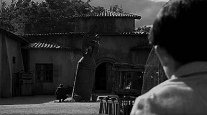
Figure 7. The children gaze at and hover around the unexploded bomb in THE DEVIL'S BACKBONE .

was caught playing near the cistern in the orphanage's cellar late at night by the violent and angry young janitor, Jacinto, who was covertly searching for gold he believed to be hidden somewhere on the orphanage's grounds. Jacinto is a former inhabitant of the orphanage who has been inexorably damaged by his experience, and thus represents a parallel realist figuration of the child deformed by wartime turmoil. Furious about encountering the child during his furtive search for gold, Jacinto struck Santi, injuring his head and rendering him unconscious. In a panic, Jacinto then placed the motionless boy into the cistern of amber water. His body immobile, Santi was unable to swim and drowned in the murky water. This amber water, which appears like an infinite void as Santi is filmed in a tight close-up sinking into its depths in slow-motion, epitomizes the unnavigable qualities of the any-space-whatever. Through this death, the ultimate extreme of sensory-motor helplessness, Santi is transformed. He becomes an 'insect trapped in amber': a ghost whose consciousness is fused to the any-space-whatever represented by the seemingly endless depth of the amber water.