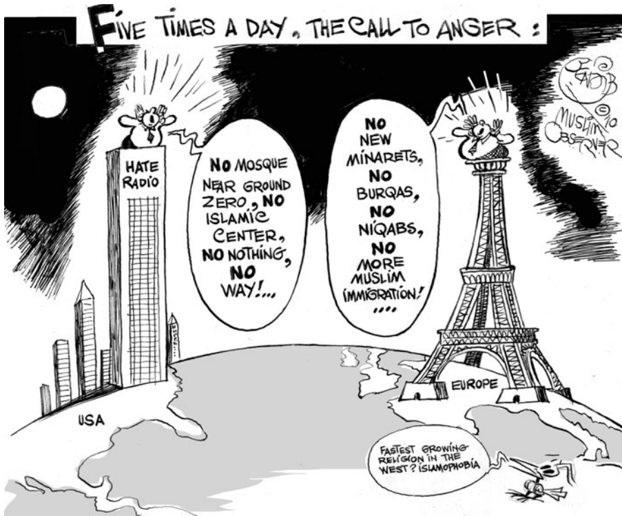
Figure 1.1 Five times a day, the call to anger. From Muslim Observer, 2 September 2010 © Khalil Bendib, all rights reserved.

individuals, between collectivities, and between individuals and collectivities, of relationships of similarity and difference.