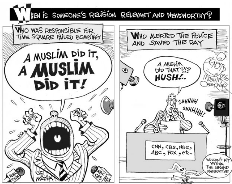
Figure 4.1 When is someone's religion relevant and newsworthy?