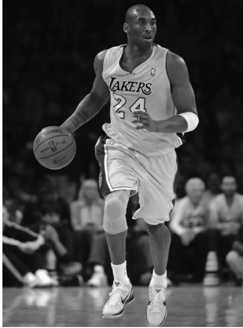
Figure 3.2 Kobe Bryant. Los Angeles Clippers v. Los Angeles Lakers, 25 March 2011. Result: Clippers 104, Lakers 112. Bryant scored 37 points.

season, there were 1.76 billion TV viewers. In 2008–9, the Sporting Goods Manufacturers Association said (based on their recent survey) there were 25.9 million regular basketball players in America, making it the most played sport, with baseball and outdoor soccer ranked second and third. 71