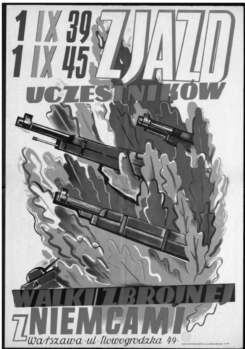
2.2 Poster of the Congress of ZUWZoNiD in Warsaw, 1945. National Library of Poland.

vectors of memory were in dynamic relation to each other, with the politicians reacting to the initiative of the masses and vice versa.