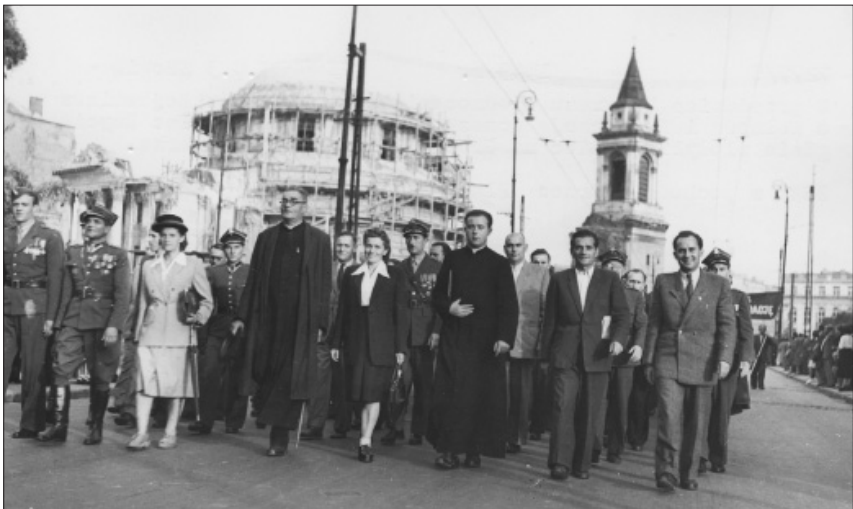
3.4 Delegates to the Unification Congress after wreath laying ceremony at the Tomb of the Unknown Soldier, 31 August 1949.

The slogan of a ‘fight for peace’ became one of the ideological foundations of the new organization. ‘We unite at a time when the battle is escalating between the forces of peace and democracy, led by the Soviet Union, and the forces of imperialism, which are planning to unleash a new war of conquest,’ declared the ideological manifesto of ZBoWiD. The Congress sent out four communiqués. Two of these were addressed, respectively, to the Soviet Committee for the Defence of Peace and the chairman of the World Peace Council, Professor Frédéric Joliot-Curie. 12 The other two, sent to Bierut and Stalin, contained assurances of the organization’s readiness to defend the freedom and peace. Similar formulations were present in the majority of speeches and texts.