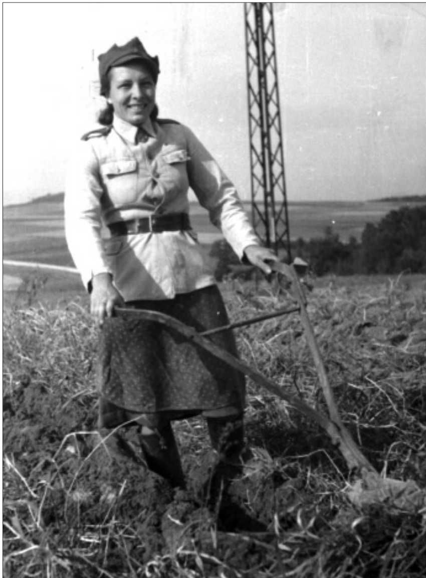
2.7 Propaganda picture of a former soldier of a female brigade of Polish Armed Forces ploughing the post-German territories, Platerowo, 1946.