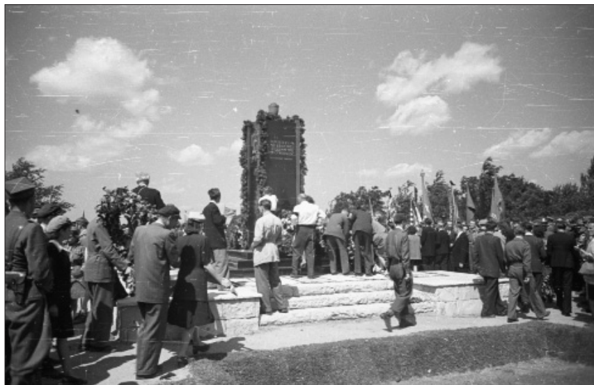
2.6 Unveiling of the ‘Gloria Victis’ Memorial dedicated to the Home Army, the second anniversary of the Warsaw Uprising, Powązki Military Cemetery, Warsaw, 1 August 1946.