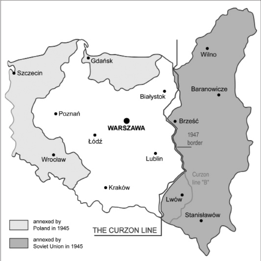
2.1 Map of post-war shifts of borders. Wikimedia Commons.