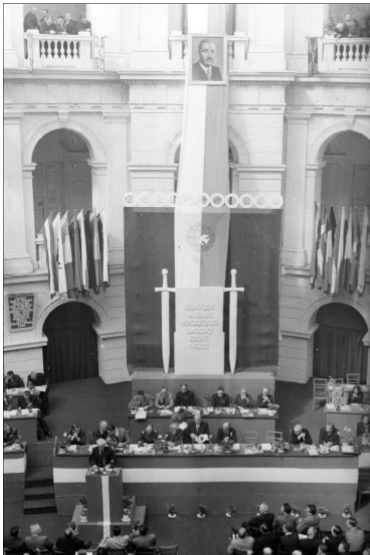
3.3 Decorated backdrop in the hall of the University of Technology during the Unification Congress. The two swords symbolize the victory over the Knights of the Cross in the Battle of Grunwald (1410) and, by extension, over Germany. The caption between the swords runs: 'We stand united guarding Democracy and Independence of People's Poland', Warsaw, September 1949.