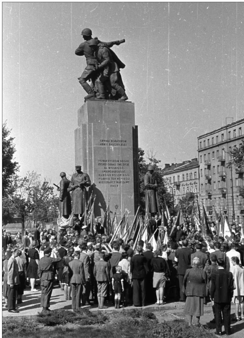
3.1 Ceremony at the Monument to Brotherhood in Arms, on the fourth anniversary of the liberation of Warsaw's Praga district. September, 1948, Warsaw.