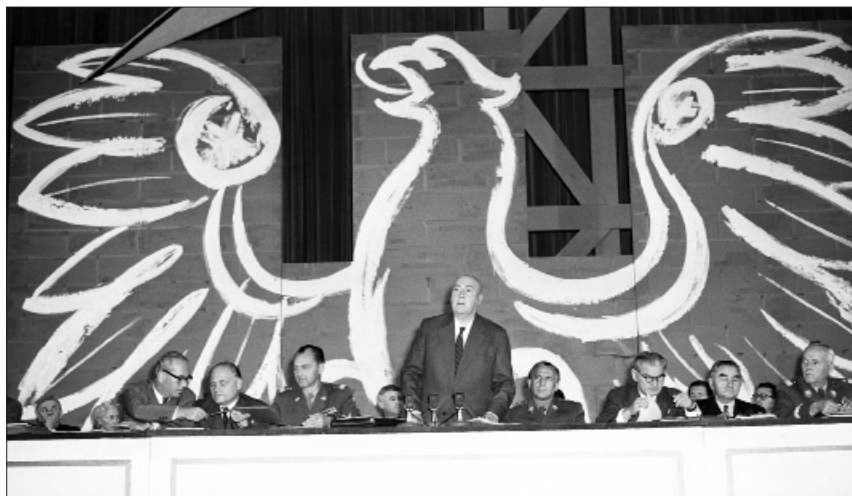
4.3 Second Congress of ZBoWiD, a view of the presidium: Józef Cyrankiewicz is addressing the audience; to his right: Janusz Zarzycki. Palace of Culture and Science, Warsaw, 1959.

The Congress took place on 1–3 September 1959, similarly to the Unification Congress, i.e. on the anniversary of the invasion of Poland by Nazi Germany. 133 However, this time it was not commemorated as a defeat, but as the beginning of a successful struggle for independence. The official event poster and the iconography of the presidium contained the national symbol, the white eagle, and the words ‘the Polish people were victorious’. Three exhibitions added to the ideological packaging of the Congress. The biggest, on the main square in front of the Palace of Culture and Science, was entitled ‘Poland under Hitlerite Occupation’ and showed war crimes against the civilian population and the activities of the resistance movement. It also reminded viewers that there were still Nazi criminals at large in the FRG. ZBoWiD published an album to accompany the exhibition, bearing the title ‘We Remember’ and featuring similar material. The Museum of the Polish Armed Forces in Warsaw had a display which recounted the history of ‘the September Campaign’, whilst the International Press and Book Club ran an exhibition on the history of Warsaw in the years 1939–45. A Resistance Movement Film Week complemented the Congress, and anti-war demonstrations were held