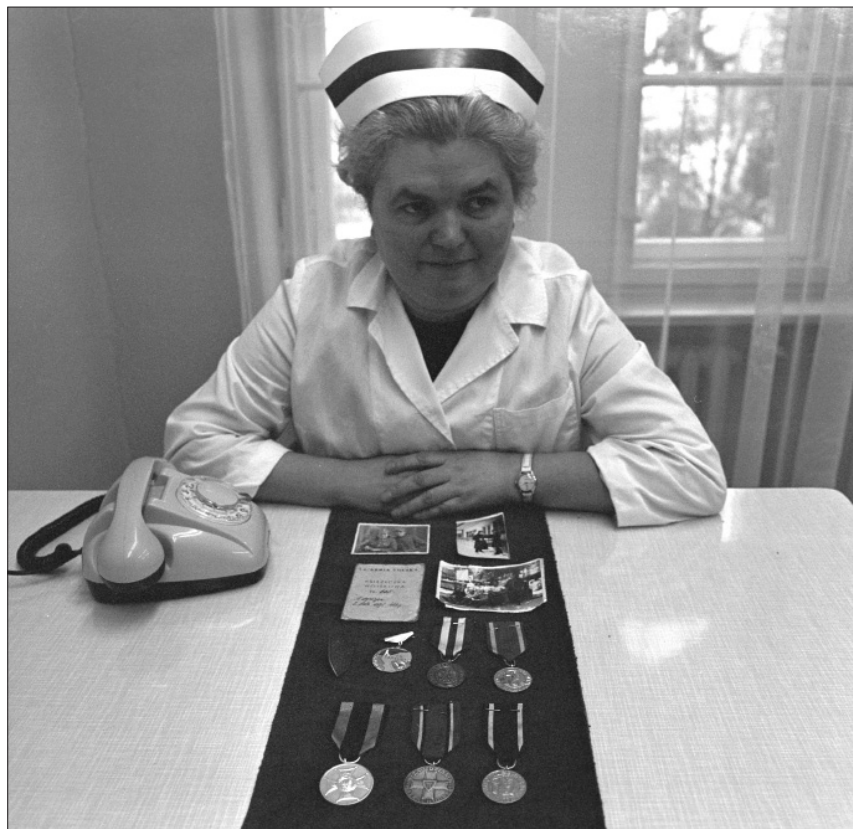
5.1 A head nurse with her war medals. She was responsible for running a home for elderly members of ZBoWiD. Assigning propaganda roles to women was typical for Mieczysław Moczar. Włocibórz, December 1969.

Significantly, the exceptional pension also applied to members of ZBoWiD who owned their own farm or craft enterprise, i.e. those who were not entitled to a state pension through other channels because of their self-employed status. For this same reason, membership in ZBoWiD could also confer entitlement to free medical treatment for those who were not covered by social insurance – primarily smallholder farmers. Initially, this right was dependent on an individual's income from farming or crafts-making. In 1968, all members of ZBoWiD became eligible if agriculture was their sole source of income.