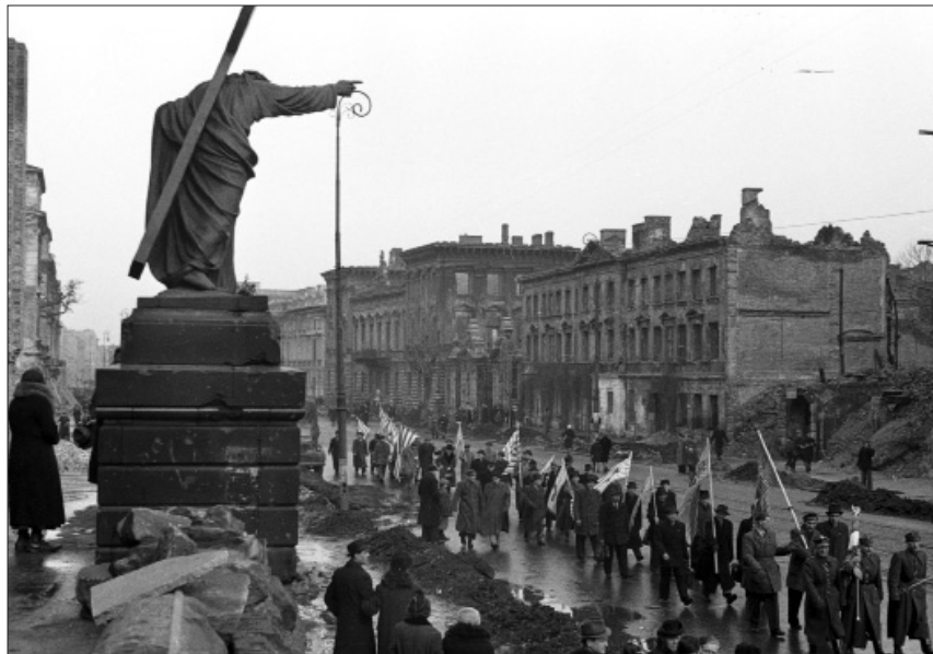
2.5 March organized by Polish Union of Former Political Prisoners, Krakowskie Przedmieście Street, Warsaw, March 1947.

For people returning to Warsaw, the sight of lifeless bodies became something familiar – as quotidian as the sight of ruins or the necessity of finding the means for survival in a destroyed city. Hundreds of descriptions of Warsaw are available in the documentary collections of the Polish Red Cross for 1945, e.g.: 52 ‘a grave without a cross, a leg protruding, unidentified. A grave by the stadium covered only by a net, three unburied persons in a pile of tomatoes’ (Myśliwiecka Street, March 1945); ‘site of execution of 28 people. In the vestibule of a stairwell leading from a courtyard, charred bones and the remains of a person, supposedly a man called Stefan, who lived on the fourth floor of this building, tall, broad-shouldered, a fruit-seller ... In a shop on the corner, covered in rubble, unidentified corpses. In the shop in the courtyard, two corpses, one of them had a prosthesis (stolen)’ (17 Grójecka Street); ‘the university gardens, left of the gate, the remains of a woman in full decomposition’ (7 Browarna Street); ‘in the watchman’s apartment, the charred remains of a newborn infant lie on the window sill’ (5 Skolimowska