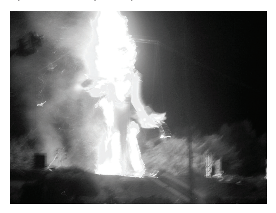
Figure 2. Zozobra burns 2011, Douglas H. Johnson