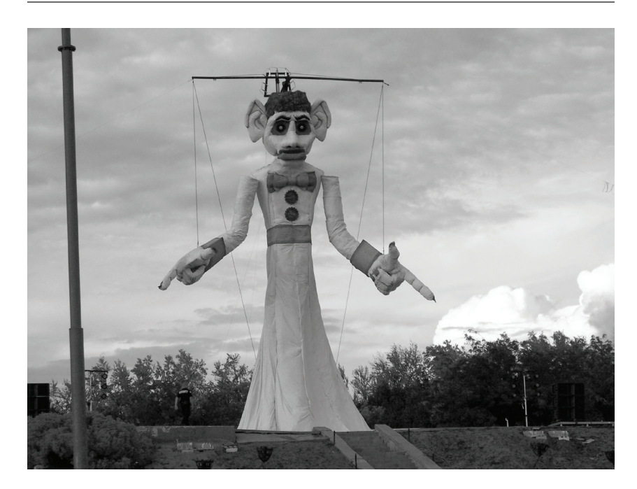
Figure 1. Zozobra limbering 2011, Douglas H. Johnson