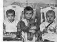
Efter en tids vård börjar de små åter blomna upp.