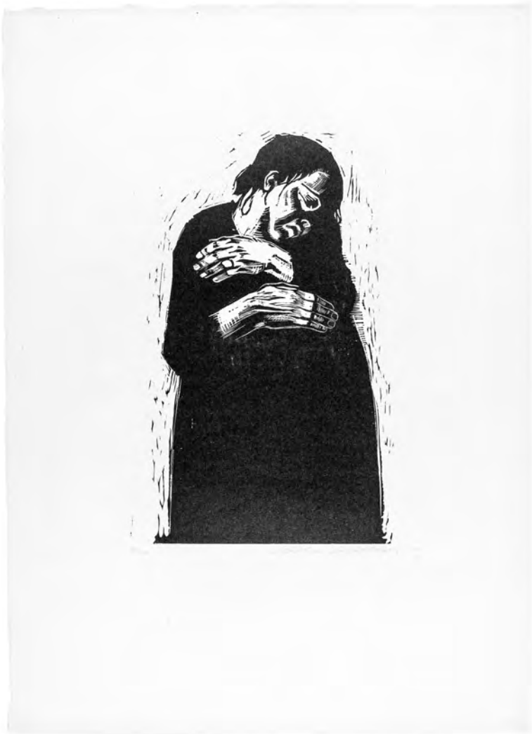
Kollwitz, Käthe (1867–1945): The Widow I (Die Witwe I) , plate 4 Digitale (1) from War (Krieg) 1921–22 (published 1923). New York, Museum of Modern Art (MoMA).