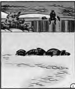
'Corpse on the Imjin!,' page 1. Art by Harvey Kurtzman.