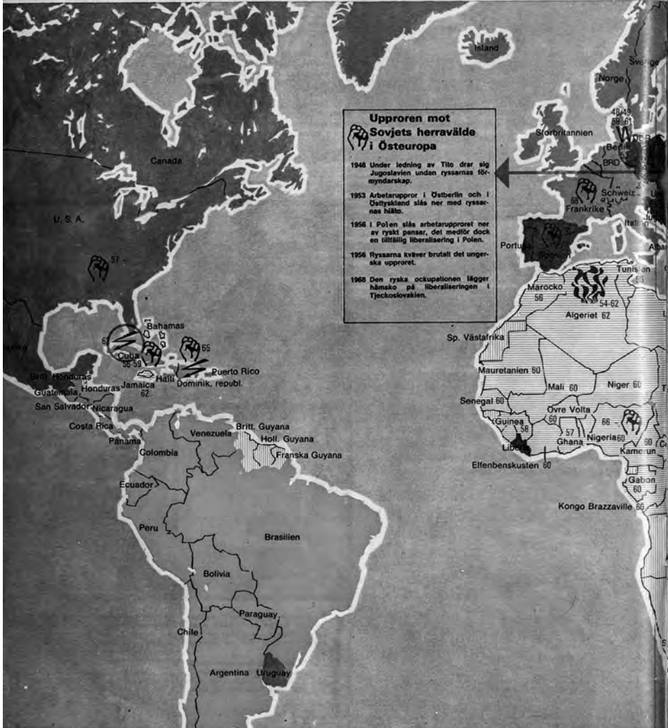
Mapping the current conflict areas in 1968 ( Lektyr 1968, 51–2).

I skuggan av ett kärnvapenkrig brinner oroshär