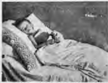
Tvåtalas mätningar ha följts till Rädda Barnen i ett tillstånd som detta

Den 30 nov. och i dec. anordnar Rädda Barnen en basar på Grand Hôtel i Stockholm för att få in nya medel. Där blir bl. a. ett särskilt "offerstånd" och man ber att det till detta måtte sändas gåvor: smycken, gravtyger, vad som helst. Adressen är Rädda Barnen, Vasagatan 13. — I slutet av månaderna skall föreningen ha ärmåden och man hoppas till det för bl. a. så många ombud som möjligt från hela Sverige.