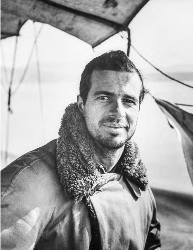
John Hersey traveling on assignment in the Far East, 1946.

as an early prototype or precursor of the so-called ‘new journalism’ movement of the sixties and seventies, and Time Magazine has called it ‘the most celebrated piece of journalism to come out of World War II.’ 4 In an American context, its contemporary importance cannot be overestimated. In a review of the subsequent book edition, the New York Times stated, for example, ‘nothing that can be said about this