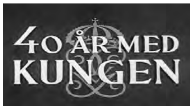
Screenshots from 40 år med Kungen ('40 years with the King', 1947, dir. Gösta Werner).