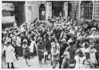
Berlinborn vänta på Rädda Barnens måltid mat

Men som sagt, det gäller att hålla ut åtminstone ännu en tid. F. n. underhålles det