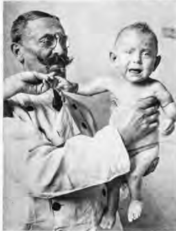
ett tykt barn som fått rickets till följd av undernäring. Bliken ur den lilles tårfyllda ögon torde säga mer än ord förstår.

Dagen därpå, den 10, blir det stort möte på Audinrum med tal av statsministern och ärkebiskopen. En dag, den 12 maj, reserveras åt skolbarnen, som då i brev, ett till var skola, uppmanas att ge vad de kunna; om t. ex. varje barn skänker blott to öre, blir resultatet 77,000 kr. Ty vad som behövs är fortlöpande hjälp —