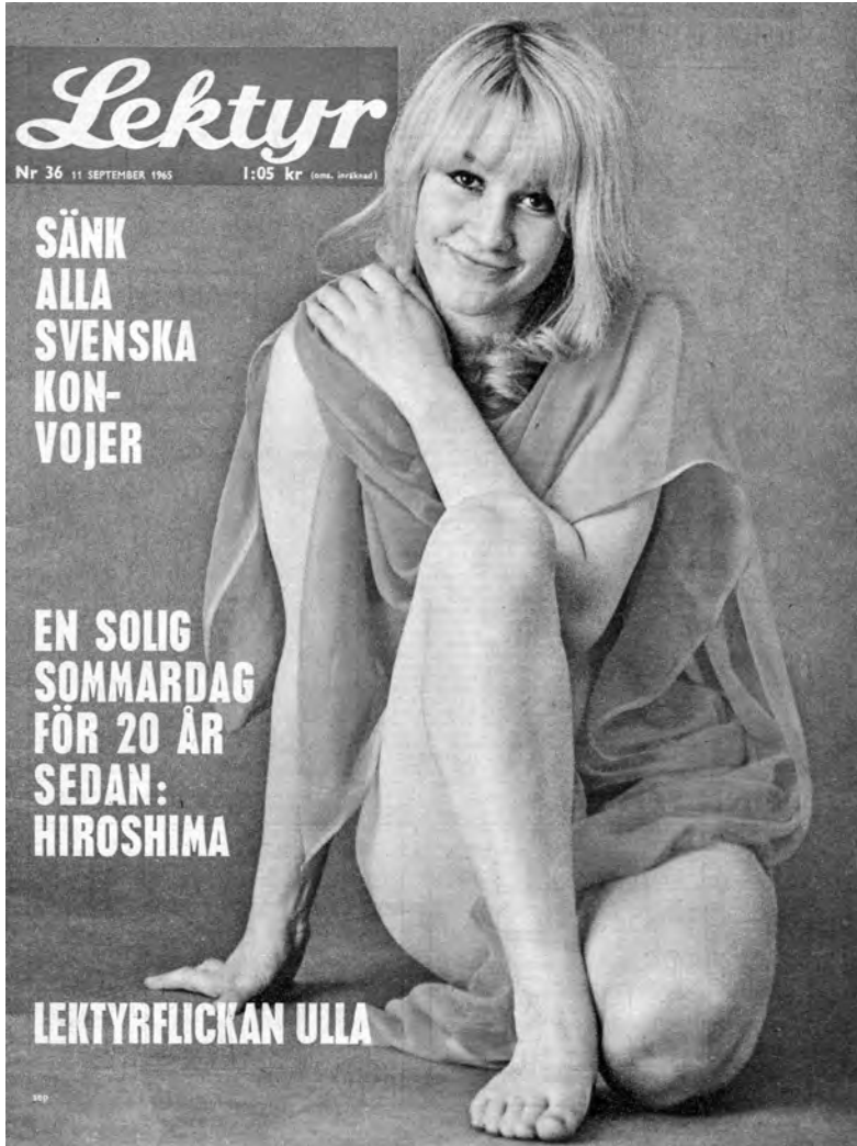
Remembering a sunny day in Hiroshima twenty years before ( Lektor 1965:36).

the concept of circulation makes it possible to study the role of the nation-state as an actor in the transnational process. 9