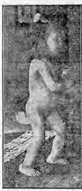
T. v. 19-åriga goss, offer för krigsordning, t. h. en fjärd av under- näring, t. h.

WIEN, 12 jan. En anlag om hur situationen i Wien är kan man möjligen få, om man här utt alla, säger och skriver alla, familjer med en inkomst underliggande 90 tusen kronor, giveträ österrike, räknas som hjälplöshärande. För ett i någon mån hanna kontrollera den giva hjälpen har i dagarna ett "Familjörorgelant" utgivits. Detta forumär utvalda till- sammans med beaktningen till alla famil- jer med lägre inkomst än 20 tusen kro- nor. På detta forumär, som svarer de- utligna ekonomiska situation, lärnattal o. d. antecknas av de olika hjäl- plighetsnämna varje givet underord. Na- turligtvis är detta förfarande i många rätts och förhållanden som det är dock