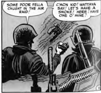
'Search!', page 2. Art by Harvey Kurtzman.