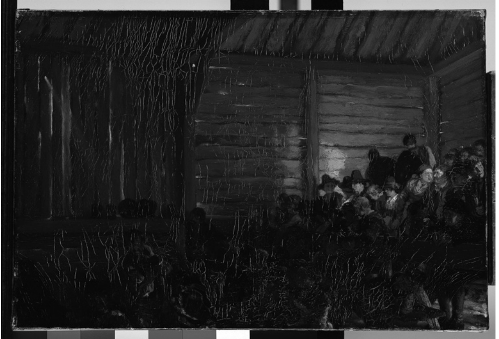
FIGURE 8 Adolph von Menzel, Bauerntheater in Tirol (Peasants' Theatre in Tyrol), oil on canvas, 375 × 550 mm, 1859, Hamburg, Hamburger Kunsthalle, bpk, Elke Walford.

Altmutter's drawing clearly idealises—even romanticises—its subject, which includes both the scene on stage (presumably a Saint George play) and the audience. In a bright and cheerful setting, children, youths, adults, and elderly people—peasant and bourgeois, male and female—congregate to enjoy the play. The drawing provides interesting insights into details that seem typical of a folk theatre audience: the mixed classes, their orientation towards the magnetic action on stage, and the scene's impact on the audience.