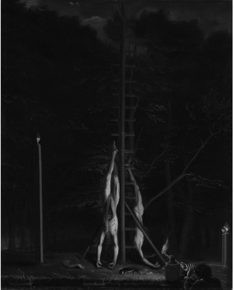
FIGURE 6 'The Corpses of the de Witt Brothers, Jan and Cornelis, Hanging on the Groene Zoodje on the Vijverberg, The Hague, 1672', attr. Jan de Baen, 1672–c. 1675, Rijksmuseum, Amsterdam, Netherlands.