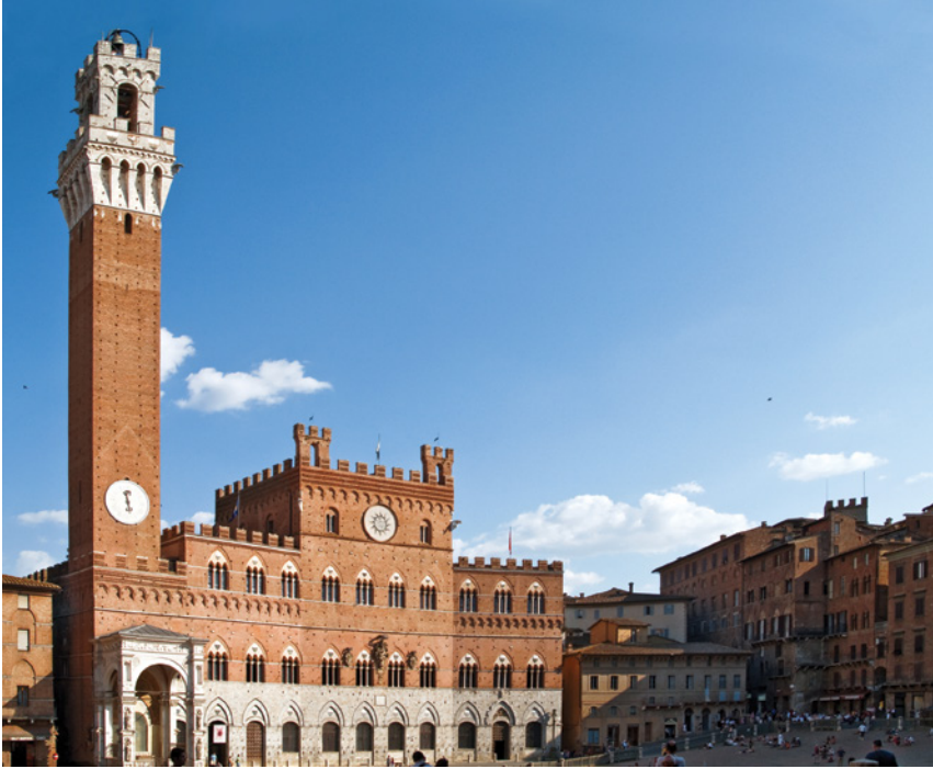
FIGURE 5 Palazzo Comunale, Siena.

shows us, however, that the fools' play is not finished. Instead, it is transferred from the favola of the comedy to the space of direct interaction between actors and audience.