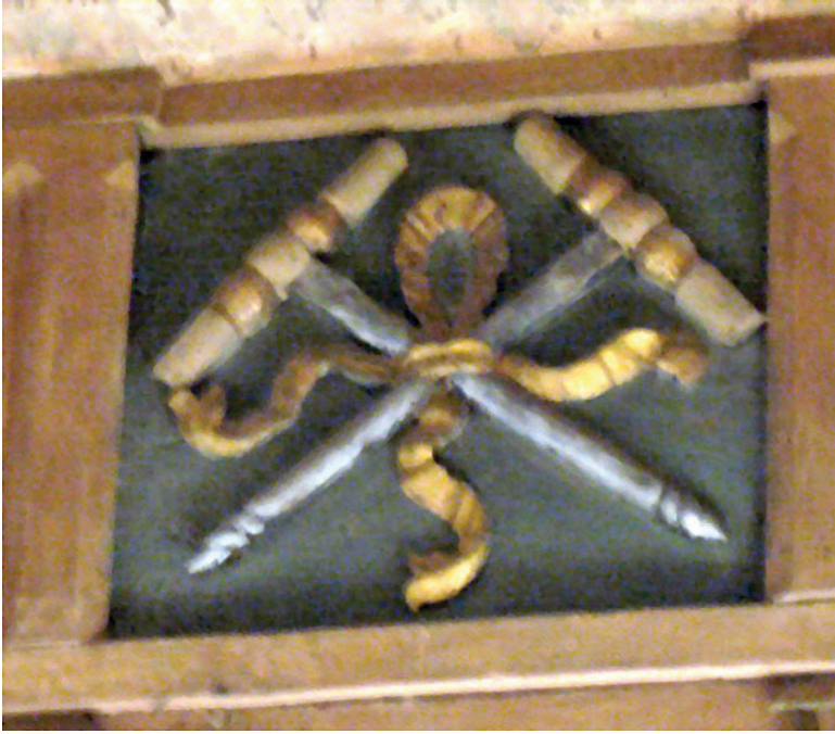
FIGURE 3 Modena coats of arms, Sala del Fuoco, Palazzo Comunale.

makes a man go crazy', 75 projecting the visual experience of this symbol of triumphant virility into the boy's future: 'You will see' ('Tu vedrai'). This scene is clearly not just a 'casual chat' establishing an 'illusion of a real contemporary setting', as Andrews would have it (p. 29). Instead, it is an ideogram of the play's symbolic trajectory that depicts the transformation of an effeminate, foolish boy into a wise and powerful adult man through a succession of initiatory riddles.