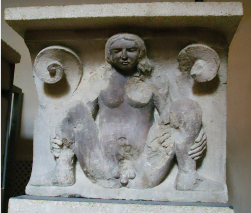
FIGURE 2 Potta da Modena, by Master of the Metopes , (Twelfth century). Modena, Cathedral Lapidary Museum. I. Sailko.

The foolish and ignorant boy does not understand the symbolic reference of this image to his own ambiguous sexual identity as an effeminate boy and his passive, woman-like role. Instead, he bursts into laughter, simplistically seeing the obscene image as nothing more than a joke.