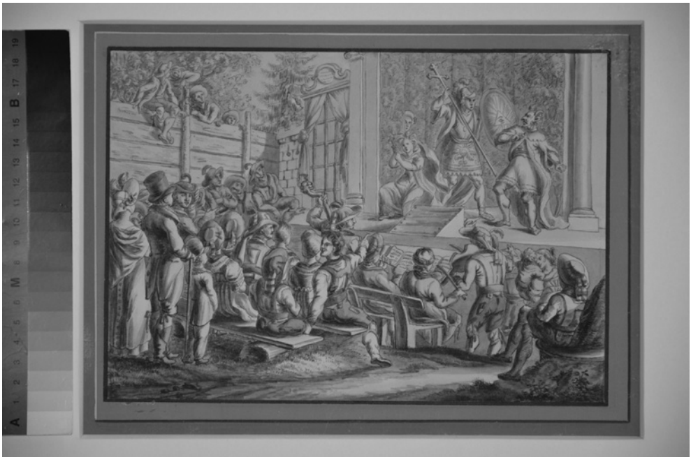
FIGURE 7 Jakob Placidus Altmutter, Bauerntheater (Peasants' Theatre), pen-and-wash drawing, 179 × 254 mm, c. 1805, Innsbruck, Tiroler Landesmuseum Ferdinandeum, Grafische Sammlungen , TBar/149.

The folk theatre audience, too, has been idealised from the beginning, a fact that is evident in two pictures from the first half of the nineteenth century. The earliest known depiction of a Tyrolean folk theatre audience appears in Bauerntheater ( Peasants' Theatre , c. 1805) by Jakob Placidus Altmutter (1780–1819), who is famous for his folkloristic drawings and paintings of rural subjects.