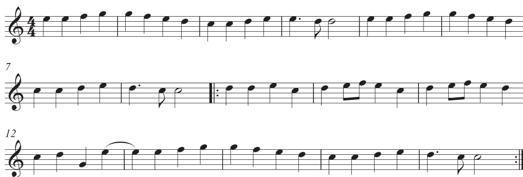
Figure 7.3 The European anthem melody.

The theme comprises 24 bars in 4/4 rhythm, with a straightforward song structure: AA’BA’BA’. In the symphony, when the solo voice first sings the ode (AA’BA’BA’), the choir joins in for the last eight bars (BA’). Also in instrumental versions, the last BA’ repetition is often performed louder with more instruments. This makes this section