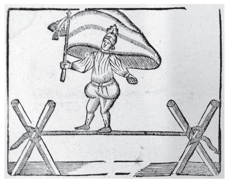
Figure 1. Tightrope dancing with balancing prop from Trondheim, 1751. Detail from a poster by De kinesiske kunstnere (The Chinese artists), 1751.

Established European theaters would seldom hire an artist who was not within their closed circuit, and consequently, many ensembles had to move regularly in order to find work. Some probably preferred this, but others likely went in search of a safer or more stable work environment.