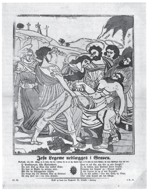
Figure 7. Laterally reversed copy of a German lithograph probably printed in Nürnberg ca. 1830. The original source is Raphael, The Entombment , woodcut, 1507. Printed in Denmark by Th. Petersen, ca. 1847. V. E. Clausen, Copenhagen.

The lack of shadowing contributes to flattening everything in this picture. There is no rounding—that is, no synesthetic dimension—to grasp and no space to enter. But also the relationship between image and imaged is uncertain and left to us to determine.