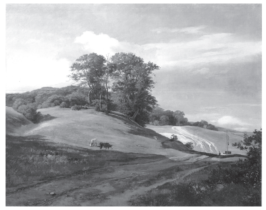
Figure 6. J. Th. Lundbye, Søbyvang. Oil on canvas, 1841. Ordrupgaard.