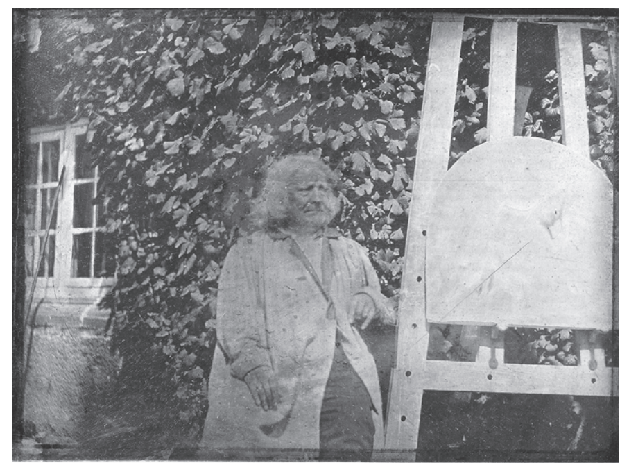
Figure 3. A. C. T. Neubourg, Portrait of Bertel Thorvaldsen . Whole-plate daguerreotype, 1844. Thorvaldsens Museum, Copenhagen.

body consisted of several transparent layers that were successively drawn off by the camera with each new exposure.<sup>8</sup> Finally, there was a risk of becoming as transparent as a ghost and, like a ghost, being left without a soul.