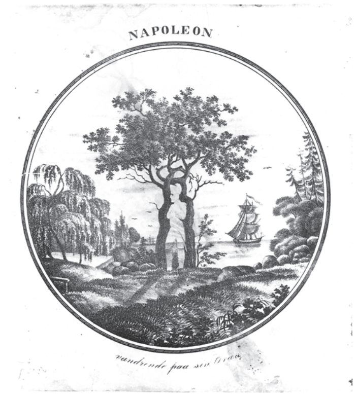
Figure 8. Anonymous, Napoleon Haunting His Grave , engraving, ca. 1820. Royal Library, Copenhagen.

The trick picture gives us an understanding not only of Kierkegaard's perception of Socratic irony, which reappears, reworked, in his diagnosis of controlled irony, but also of the manifestation of the relation between the dialogue partners that the controlled irony takes as its premise: co-acting, cocreating, producing, and, in brief, performing. If we transplant the traits and abilities of the trick picture, and the perception of the reception process that determines its design, there appears to be a relation between Kierkegaard's opting for the popular pictorial culture and the controlled irony.