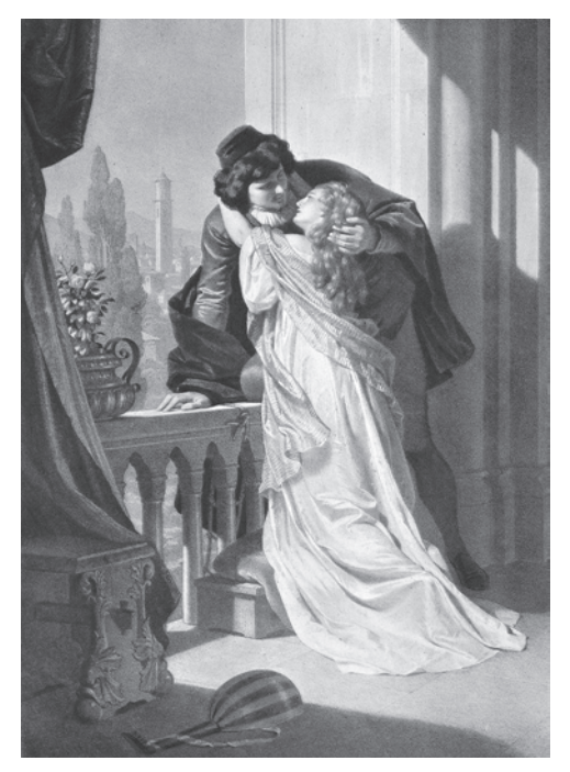
Figure 2. Romeo and Juliet's Farewell Kiss , lithograph by Ferdinand Piloty, from William Shakespeare, Romeo und Julia , trans. [to German] August Wilhelm von Schlegel (Berlin: G. Grote, 1875), facing p. 75.

( SKS 6:156 / SLW 167), namely Juliet sunk in admiration at her lover's feet. Her gaze at Romeo is filled with heavenly bliss, "but Romeo stops this look and with a kiss all the longing of erotic love is set at rest forever, for the reflection of eternity surrounds the moment with a halo, and no more than Romeo and Juliet does anyone who looks at the picture think that there will be a next moment, even if it were only to repeat the sacred seal of the kiss" ( SKS 6:157 / SLW 168). The picture of Romeo and Juliet is thus "an eternal picture" as its tableau depicts an eternal moment that can never change. Yet it is also an eternal picture because it is timeless and depicts a universal ideal that transcends history: "Do not ask the lovers, for they do not hear your voice, but out in the world ask in what century this happened, in what country, at what time of the day, at what hour it was—no one replies, for it is an eternal picture" ( SKS 6:157 / SLW 168). This pair of lovers is "an eternal subject for art" ( SKS 6:157 / SLW 168).