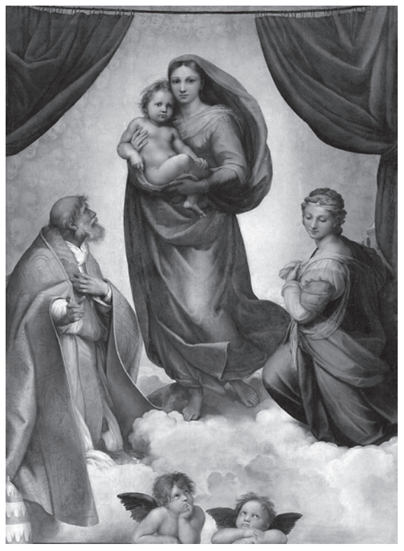
Figure 9. Raphael, The Sistine Madonna , oil on canvas, 270 \times 201 cm., 1513–14, Gemäldegalerie, Dresden.

etchings in conjunction with a critique of Friedrich Ast's book Platon's Leben und Schriften (1816, Plato's Life and Writings ), in which Ast argues that Socrates's defense is written neither by Plato nor by Socrates himself, but by someone unknown. Kierkegaard finds Ast's viewpoint absurd and—(Romantically) ironic.