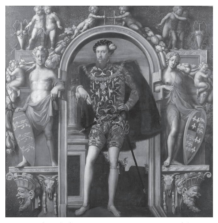
Fig. 2. Henry Howard, Earl of Surrey, NPG 5291.

succession, despite its obvious reverence for the Howard past. In boasting a "genealogy worthy [of] a possible king," the painting argues that its subject "possessed a right to be Protector to the young Prince Edward"—and the canceled image of Richmond, Edward's half-brother, would have powerfully reminded that Surrey had already once nursed the blossoming of a Tudor royal son. 126 At the time of Surrey's trial, we will see below, similar images of genealogical interest were seized from the Howard residence at Kenninghall—where they served, we must presume, not as external envoy of Surrey's credentials, but rather as an identity-affirming mirror of their subject, mired in the most difficult (and final) year of his young life. The form of that identity, emerging from the insistent, inextricable proximity of Surrey's Howard blood to the Tudor throne, replicates much of the symbolic dynamics embedded in "So crewell prison."