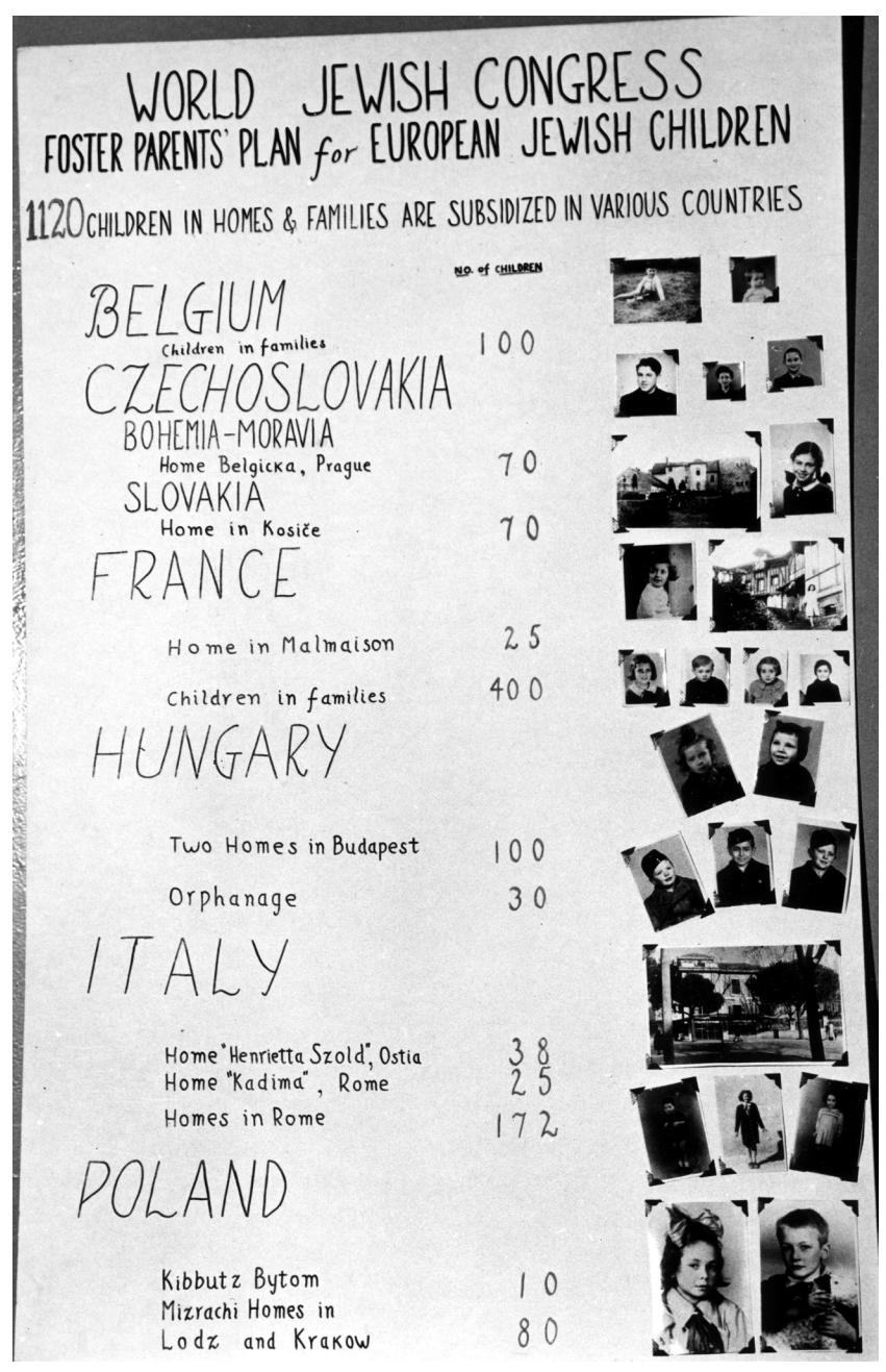
Figure 1: A poster advertising the Foster Parents Plan for European Jewish Children. AJA, 361 J11/5.