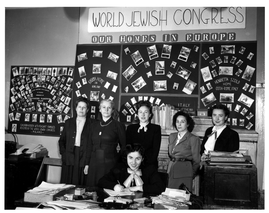
Figure 3: World Jewish Congress Children Division, 1946. AJA, 361 J11/5.