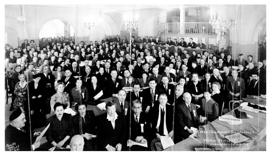
Figure 9: War Emergency Conference at the St. Charles Hotel, Atlantic City, N.J., 26-30 November 1944.