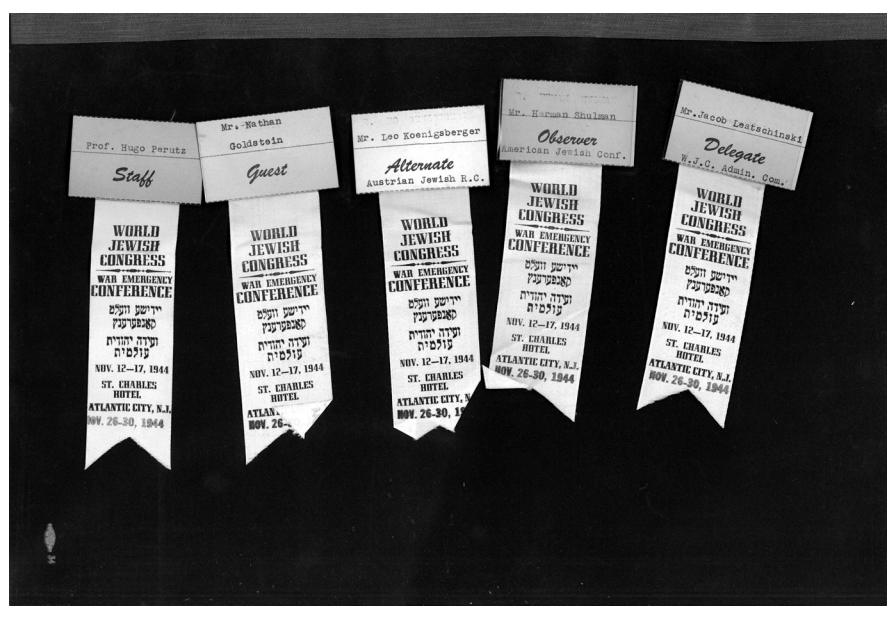
Figure 7: Participant tags of the War Emergency Conference, Atlantic City, N.J., 26-30 November, 1944. AJA, 361 J17/1.