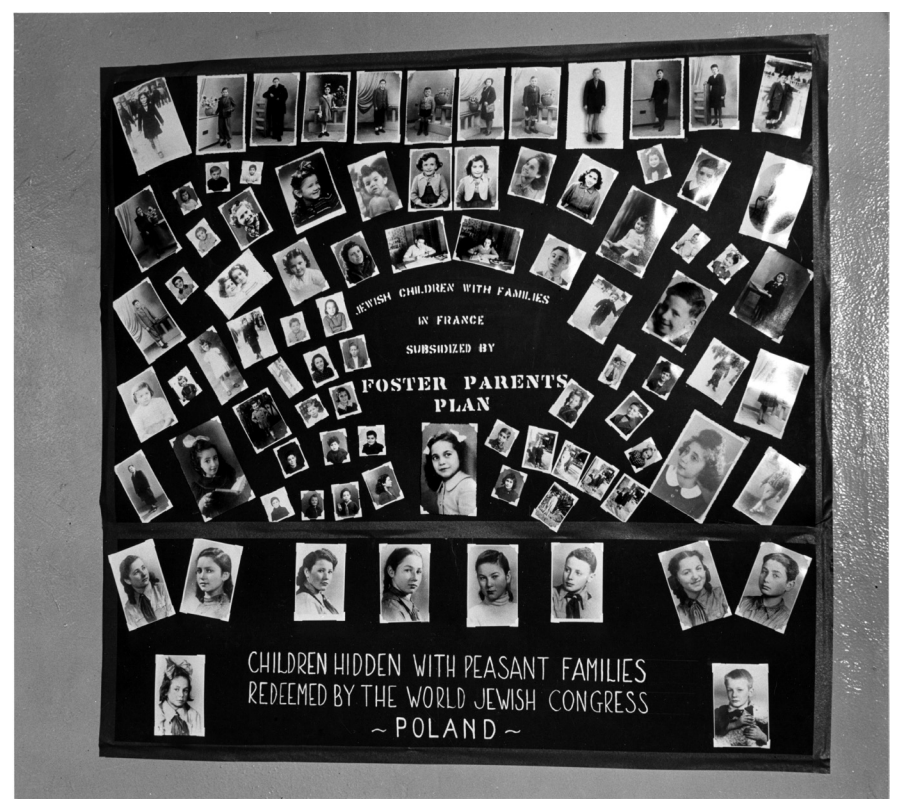
Figure 2: Photographs of children hidden with peasant families in the Foster Parents Plan for European Jewish Children. AJA, 361 J11/5.