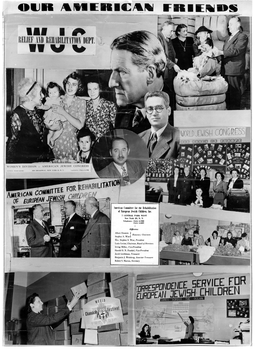
Figure 8: Poster of the American Committee for the Rehabilitation of European Jewish Children. AJA, 361 J18/1.