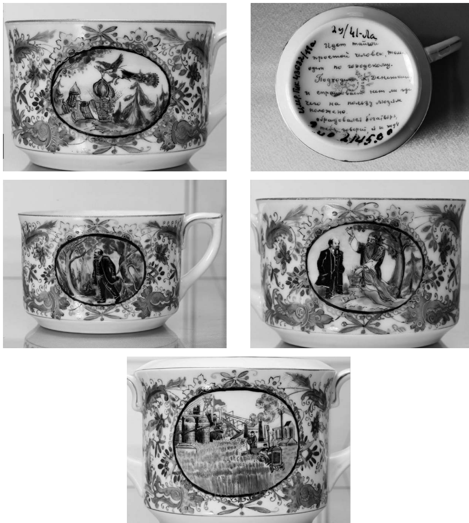
Figure 6a-i. China set with the motifs of P. P. Bazhov's tale, "Warrior's mitten." Gift to I. V. Stalin for his 70th birthday from the collective of the Baranovo Porcelain Factory, 1949.

This china set was presented as a gift to Stalin in 1949, on the occasion of his seventieth birthday, from the Baranovo porcelain factory workers. This is a vivid example of the narrative construction of the original gift of socialism by the gift of gratitude. This gift is just one example of a mass flow of gifts on that occasion, from all corners of Soviet society and communist movements from around the world (Ssorin-Chaikov 2006a). This particular china set marks the time of Stalin's anniversary, which itself marks the time of socialist modernity, with the gift time of Urals mythology. Bazhov modifies this story's supposed folklore origins with the figure of Lenin as culture hero. Lenin, by taking the