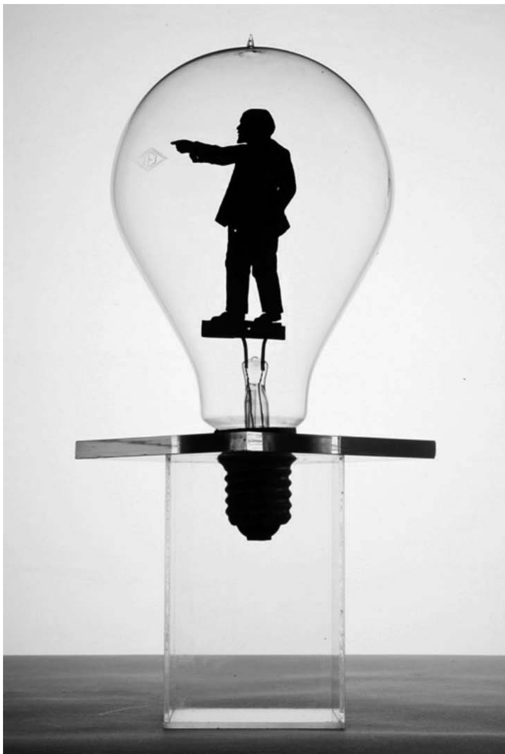
Figure 2. Electric light bulb of a half-watt 1000 svechi , with a filament in the shape of V. I. Lenin. Gift to the 12th Congress of the Russian Communist Party (Bolsheviks) from the workers of the First and Second United Electric Lamp Factory, April 23, 1923.