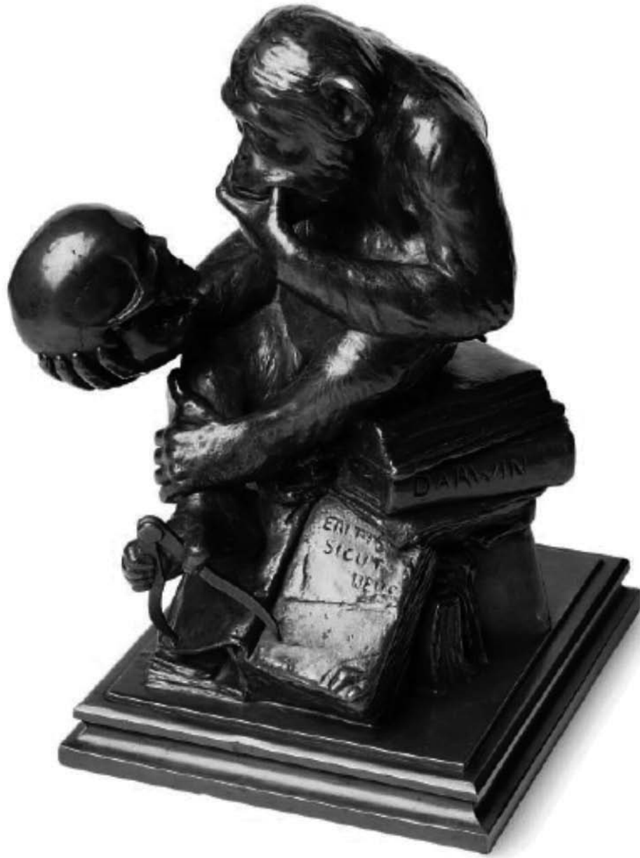
Figure 1. Sculptural composition, Eritis sicut deus , by Hugo Wolfgang Rheinhold, circa 1893. Gift to V. I. Lenin from American businessman Armand Hammer, October 1921.