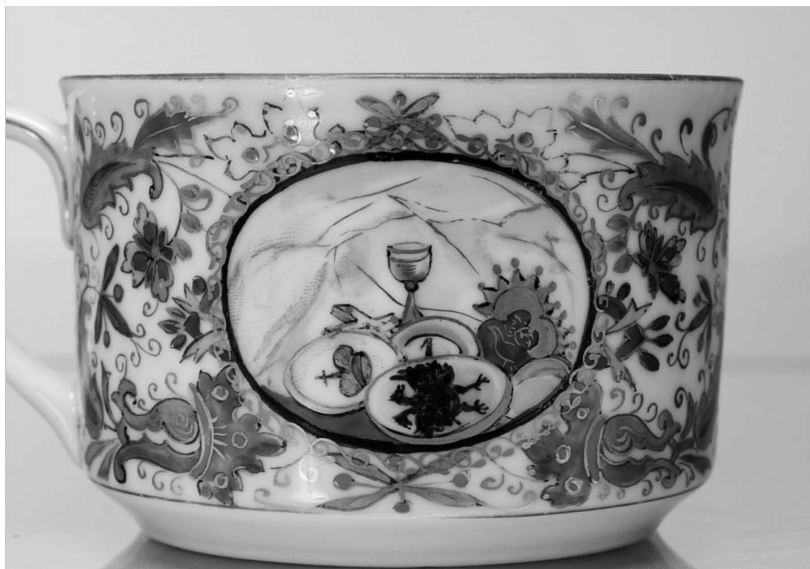
Figure 7b. A cup from china set with the motifs of P. P. Bazhov's tale, "Warrior's mitten." Gift to I. V. Stalin for his 70th birthday from the collective of the Baranovo Porcelain Factory, 1949.