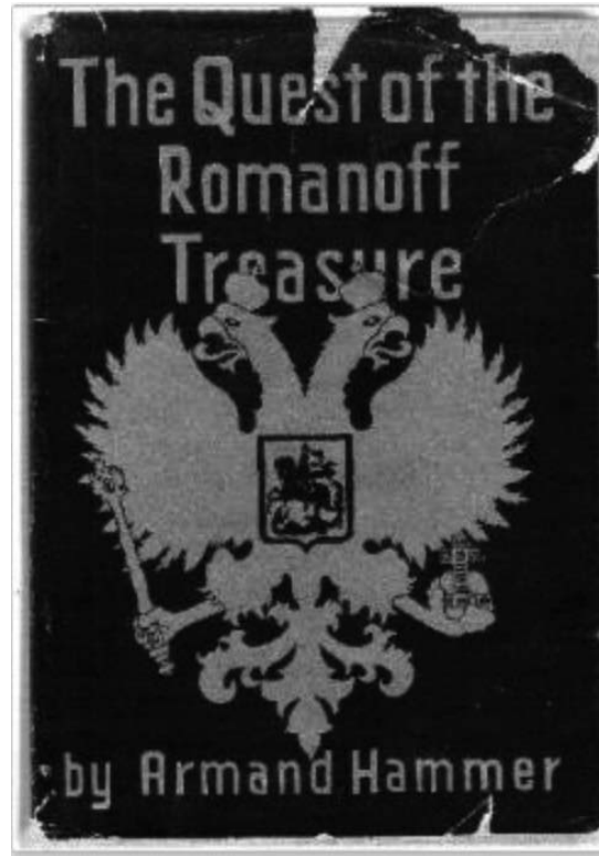
Figure 7a. Book cover of Armand Hammer's The quest of the Romanoff treasure . New York: W. F. Payson, 1932.