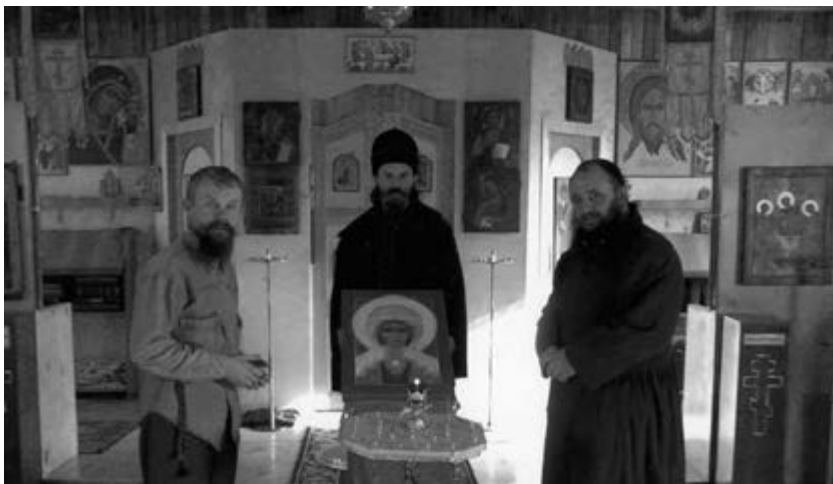
Figure 11 A s'ezd ('congress') of Far Eastern Old Believers in the mid-1990s held in Bolshoi Kamen'