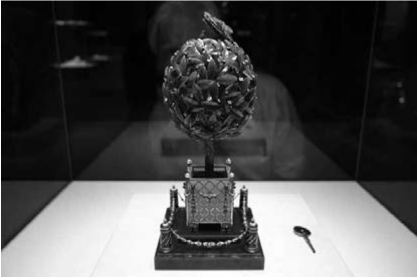
Figure 15 Carl Fabergé’s Easter egg, made predominantly of jade from a private collection of Viktor Vekselberg, the fourth richest person in Russia. The object is on display at special private museum in Saint-Petersburg, Russia

was part of an elitist lifestyle and jade was never reconfigured as a Russian stone in a democratic sense: it did not become popular or recognizable, and no artisan craft arose to work the stone into objects of value. This situation was in some ways similar to the heyday of jade in Chinese history, when only the members of royal family and those close to it were permitted to own jade. Even though jade objects like imperial eggs are of Russian origin, their price now is determined at auctions abroad, and foreign experts play important roles in the process. In this respect Russian buyers are similar to Chinese ones: they buy these objects because of the emotional ties they feel towards them.