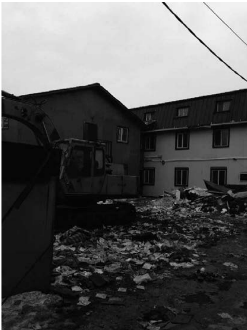
Figure 9 Chinese market in Ussuriisk, 2016

Earlier, it had been the precarious balance of the mutuality of two parties across the border that had enabled the frontier market economy to be sustained and flourish. In accounting for what happened next, it is useful to refer to Gellner. According to him (1988, 143), it is often the state ‘that destroys trust’, replacing the delicate equilibrium of social cohesion with