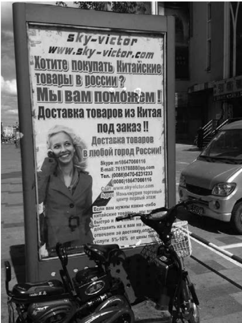
Figure 17 Advertisement for a company offering help with on-line purchases in Manzhouli, China

to the brothers' invention (i.e. they are mediators between Russian purchasers and the Chinese bazaar), but some are more similar to the technical architecture of Taobao itself. For example, the company 'Russian Bridge' simultaneously offers online shopping on Taobao and other means and