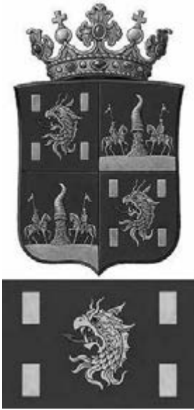
Figure 2 The Coat of Arms and official flag of Kyakhta, Russia

this is not just a head of a dragon: as an 1861 document states, it was meant to depict ‘a severed head ( otortvannaya golova ) with red eyes and red tongue’; 9 when the dragon as a whole signified China itself. The same symbol of the guillotined dragon became the official flag of Kyakhta town, which is still in use. 10 It should be noted that a beheaded and vanquished dragon is one of the most popular motifs of Russian orthodox iconography, depicting Saint George’s victory over pagans. Indeed, the newly established border was perceived by Russians as the front line of the confrontation between European Christianity and Asian pagans. Perhaps this is one reason why Kyakhta was so rich in large Orthodox churches; it has the most outstanding and impressive ecclesiastical architecture in all of Asiatic Russia east of the Urals. The largest and most monumental, the Church of the Resurrection ( Voskreseniya ), 11 was built just a few meters from the border next to the