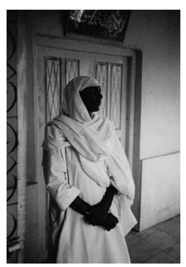
Figure 5 A Christian convert who is khalifa of Zindapir

A further element relates to the spiritual authority of the saint, which transcends that of worldly rulers. If his authority is above that of temporal rulers, it follows also that it recognises no temporal political, ethnic, or religious boundaries. His tolerance towards members of other religions is stressed in many of the morality tales he tells. He repeatedly told me that