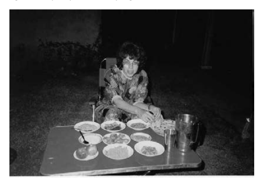
Figure 6 Hospitality for the anthropologist at Ghamkol Sharif

and debt (Peters 1990, 139). Despite the idealisation of the ethics of hospitality as spontaneous and without calculation, in reality hospitality is at the same time also often highly instrumental for survival, as in the case of Afghan long-distance traders. Marsden shows that among such traders the hospitality they depend on or extend may, and often does, go wrong (Marsden 2012). Guests are a necessary risk and particularly so when it comes to movement across dangerous borders. Nevertheless, hospitality is essential to the lives of these traders.