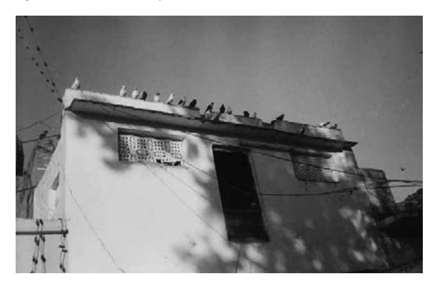
Figure 3 Doves over the shaykh's room at Ghamkol Sharif